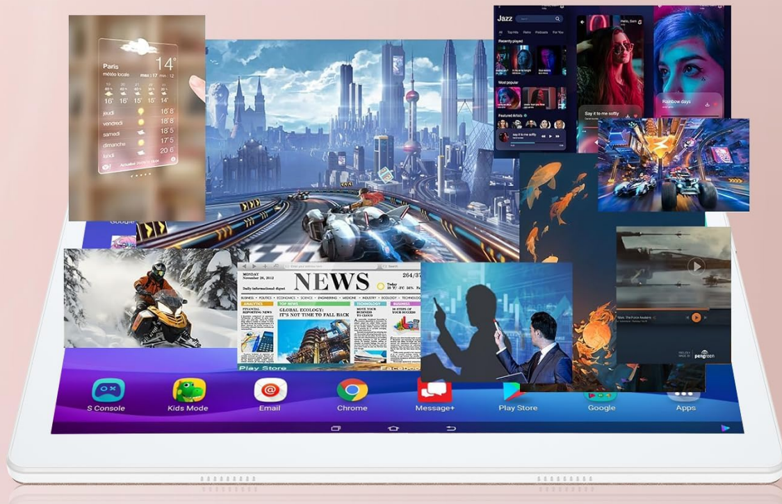
Figure 6.1: Performance and storage capabilities of the ZUSZOX tablet.