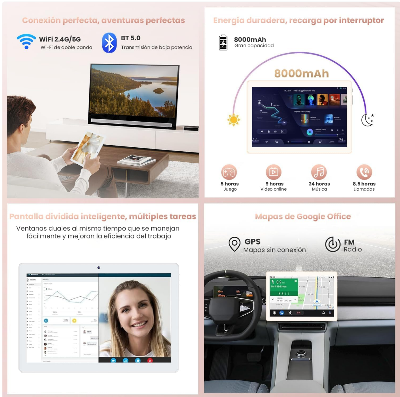
Figure 3.3: Overview of tablet connectivity, battery life, and multitasking features.

The tablet includes built-in GPS for navigation. Use pre-installed mapping applications or download your preferred navigation app from the Google Play Store. Ensure location services are enabled in Settings > Location.