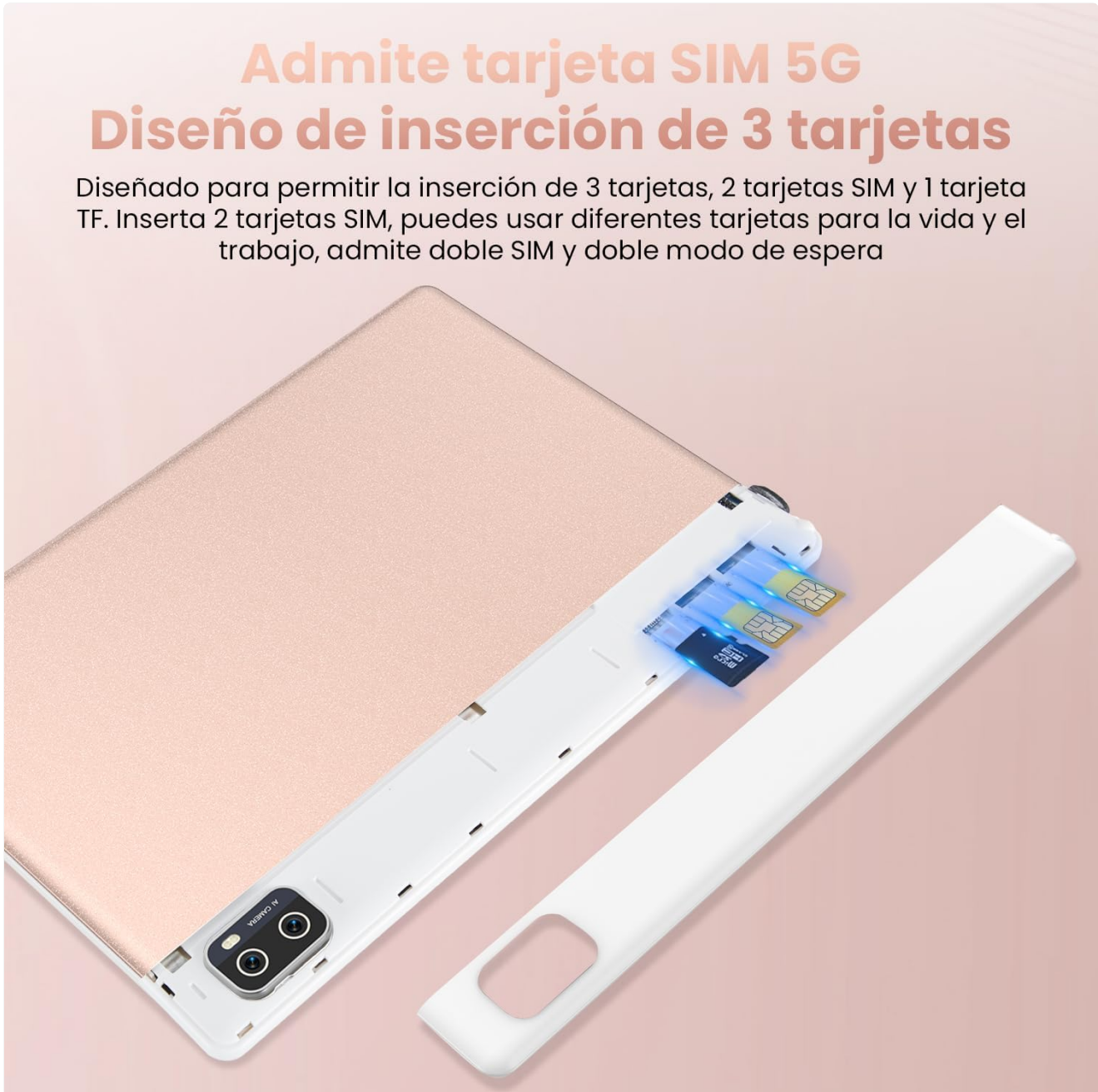
Figure 2.1: SIM and MicroSD card tray with slots for two SIM cards and one TF card.