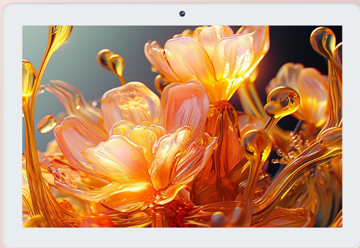
Figure 6.2: The tablet's 10.1-inch IPS display with 1280x800 resolution.