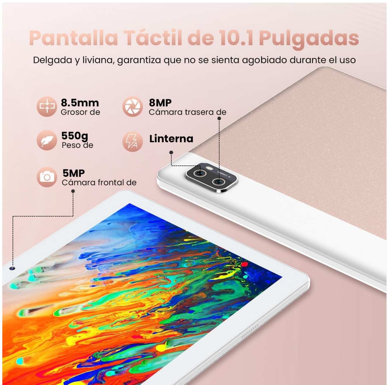
Figure 3.2: Tablet camera specifications and physical attributes.

The tablet features a 5MP front camera and an 8MP rear camera. Open the Camera app to take photos or record videos. You can switch between front and rear cameras, adjust settings, and apply filters.