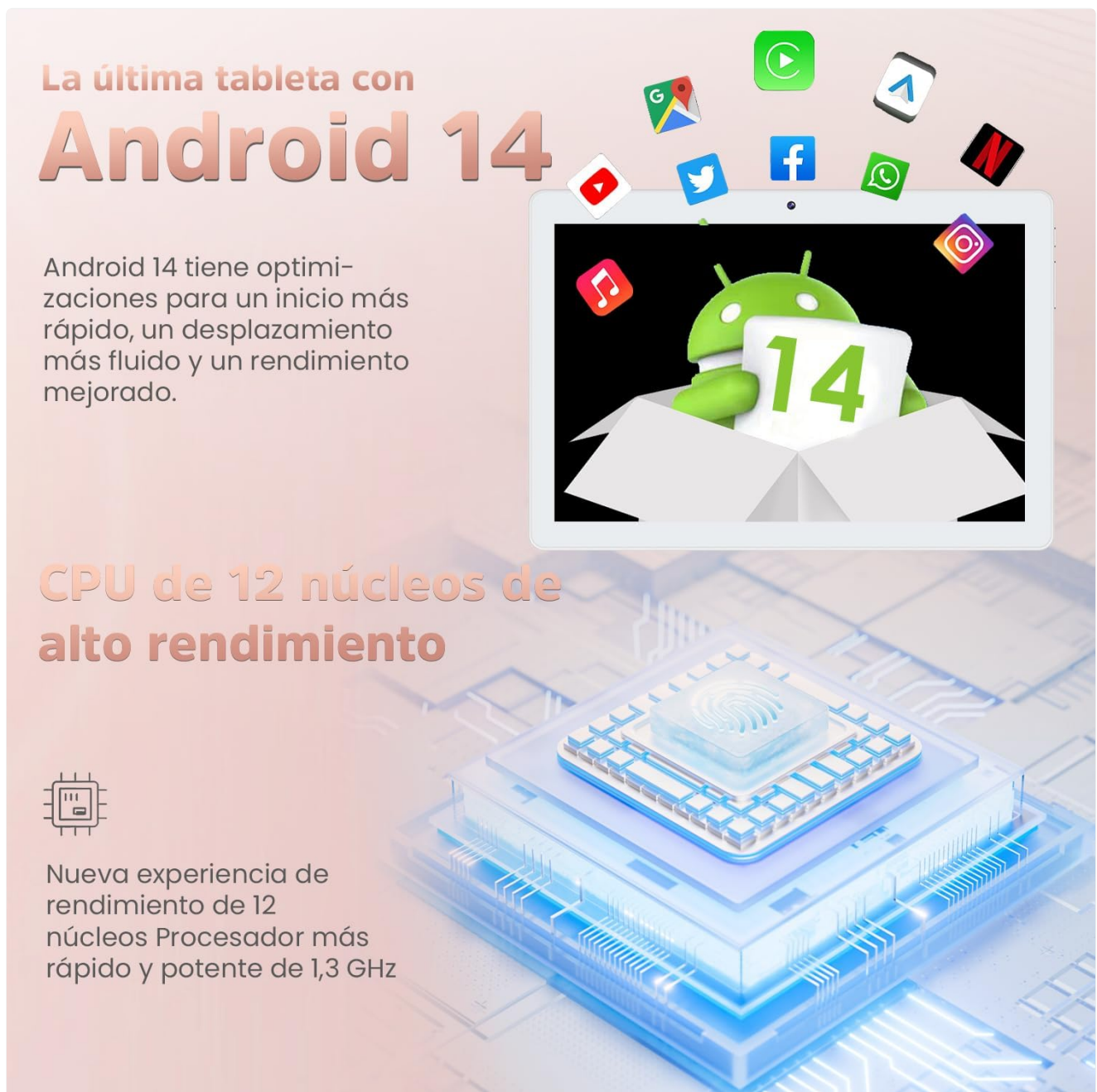
Figure 3.1: The tablet running Android 14, powered by a 12-core CPU.