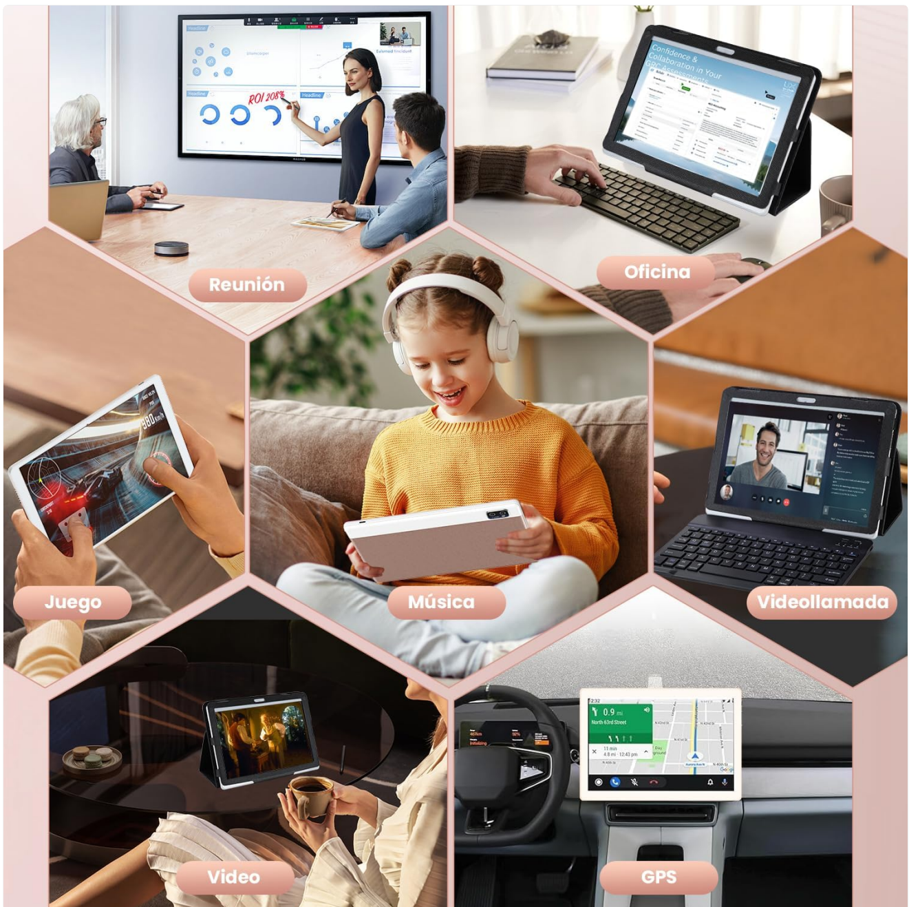
Figure 3.4: Diverse applications of the ZUSZOX tablet in daily life.