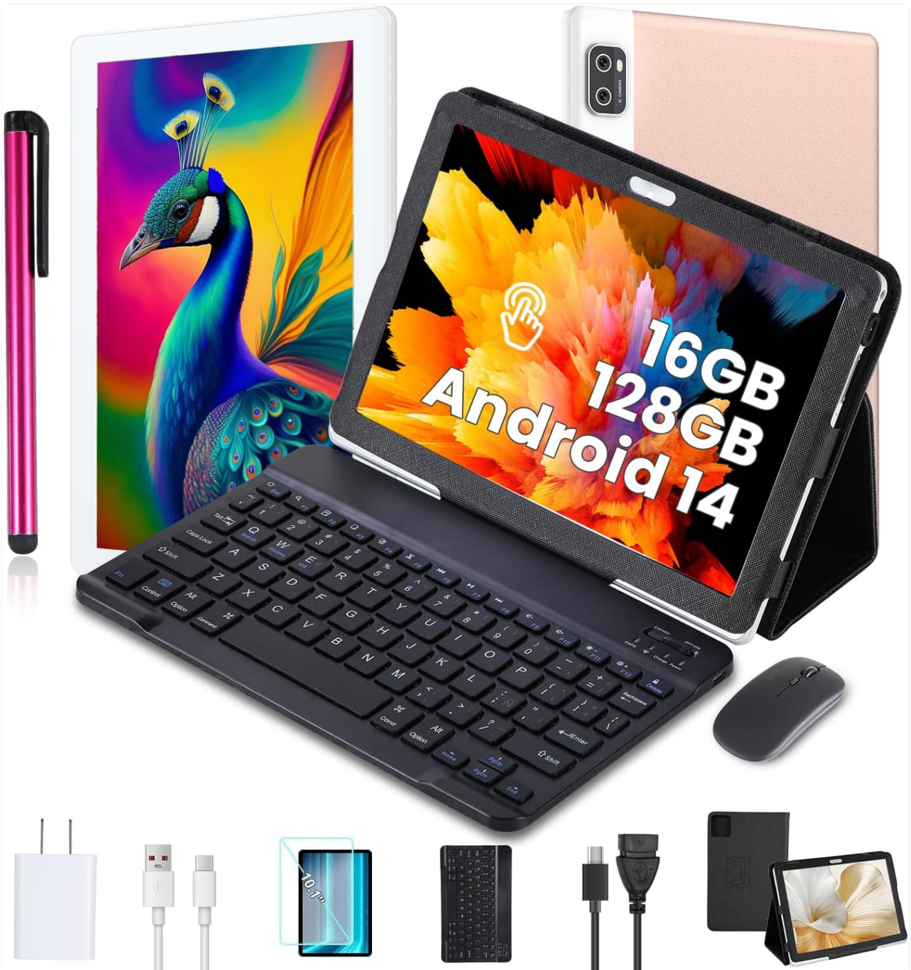
Figure 1.1: ZUSZOX Android 14 Tablet and its complete set of accessories.