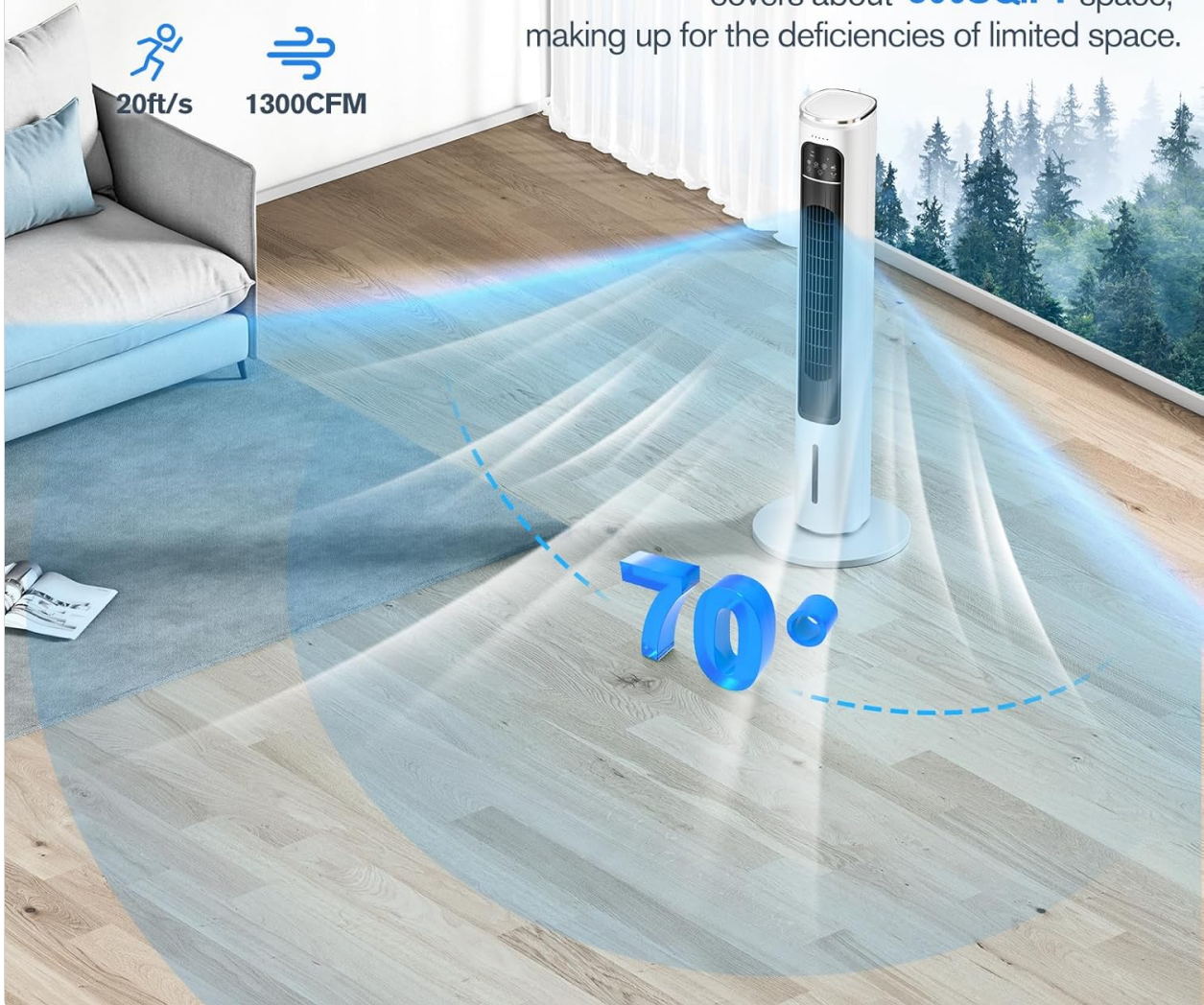
Image: The air cooler demonstrating its 70-degree oscillation feature, designed to cover a wide area for effective cooling.

Auto-rotate design increases the cooling range and covers about 300SQ.FT space, making up for the deficiencies of limited space.