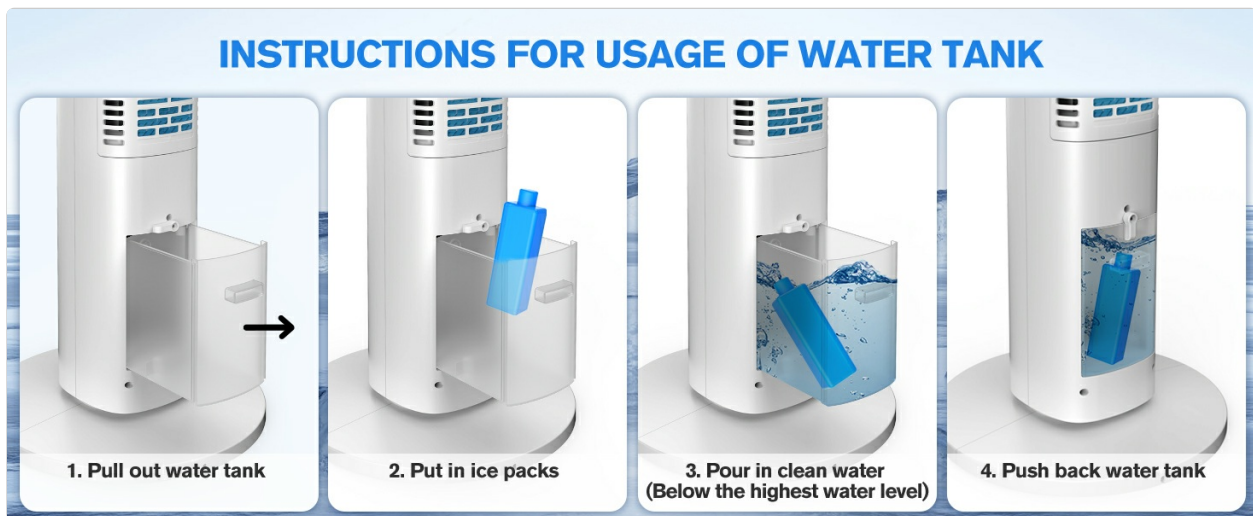
Image: Step-by-step guide on how to pull out, fill, and reinsert the water tank with ice packs.