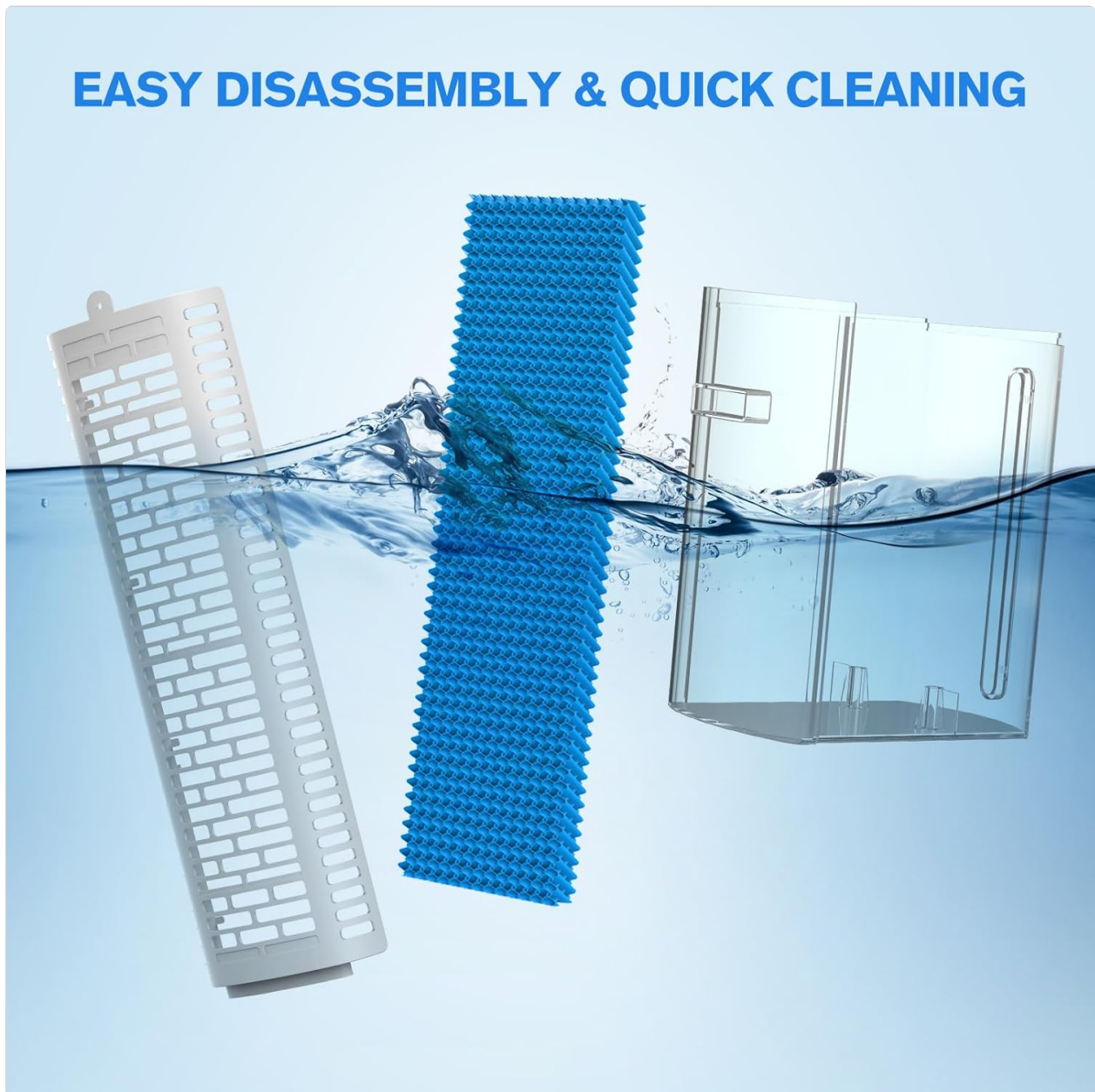
Image: Visual guide for easy disassembly of the water tank and fiber curtain for quick cleaning.