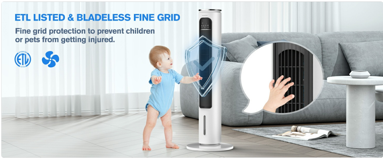
Image: The FLOWBREEZE DT3 Evaporative Air Cooler features a fine grid for safety, protecting children and pets from internal components.