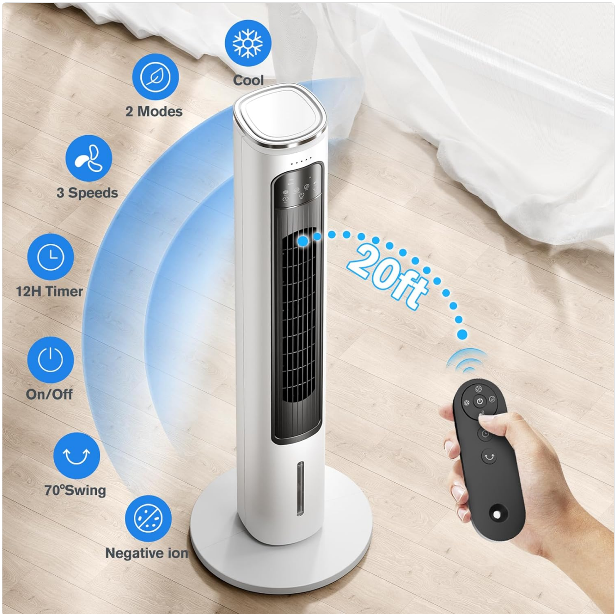
Image: The FLOWBREEZE DT3 Evaporative Air Cooler highlighting its key features including modes, speeds, timer, oscillation, and remote control functionality.