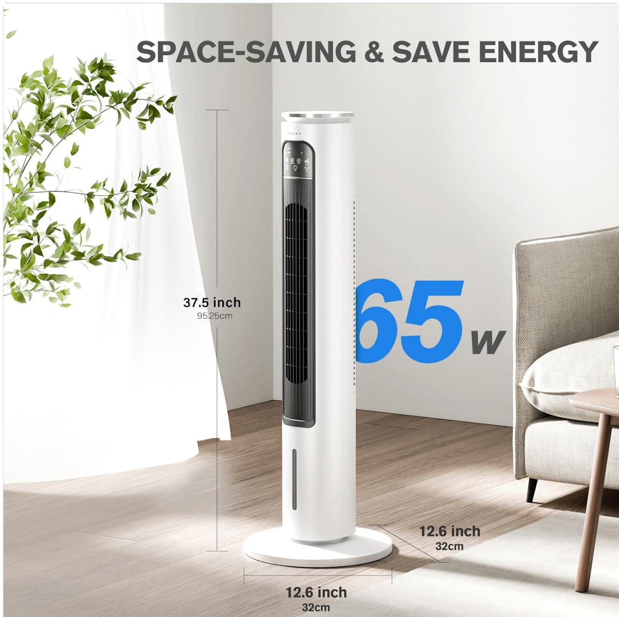
Image: The FLOWBREEZE DT3 Evaporative Air Cooler with its dimensions and 65W power consumption highlighted.