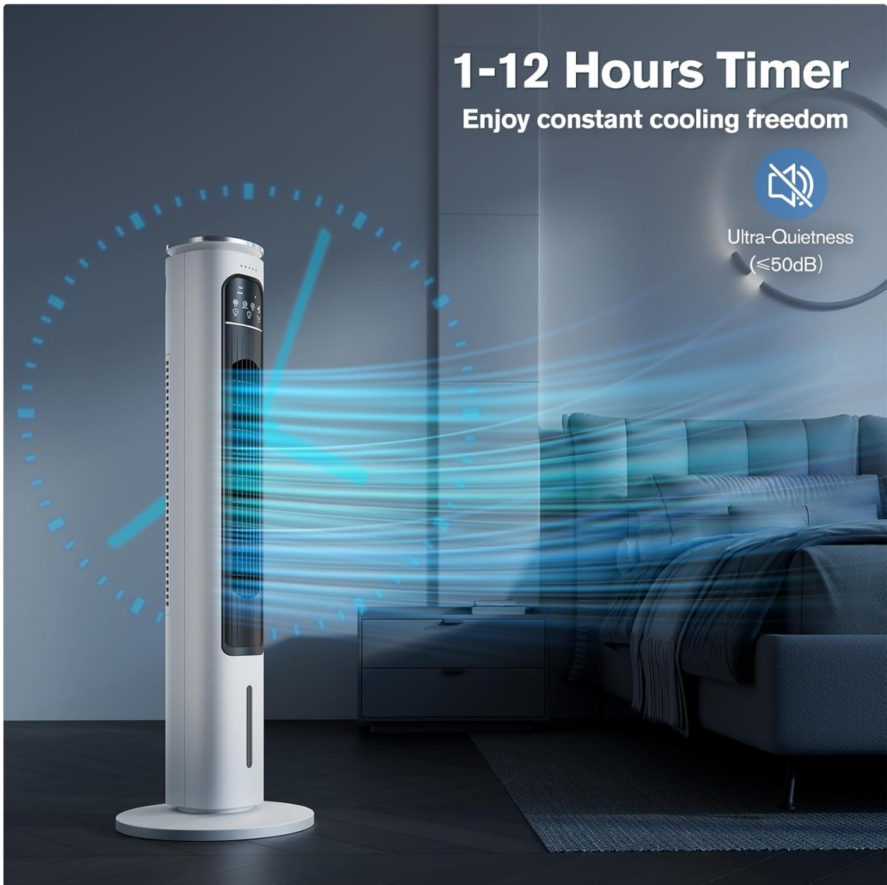
Image: The air cooler operating in a bedroom, demonstrating the 1-12 hour timer for scheduled use and its quietness.