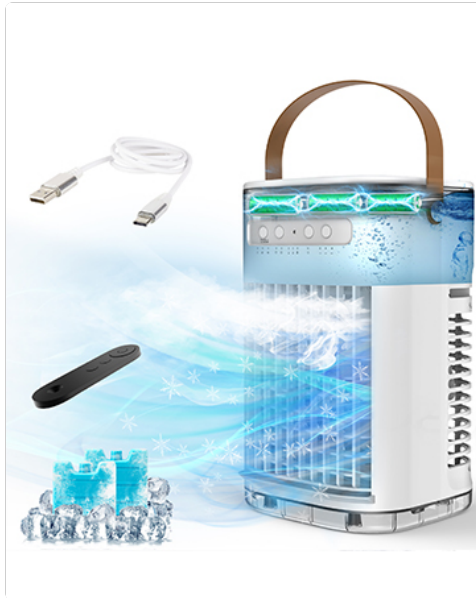
Image: The touch control panel with various function icons.

The control panel features intuitive touch buttons for all functions. The remote control offers the same functionality for convenient operation from a distance.