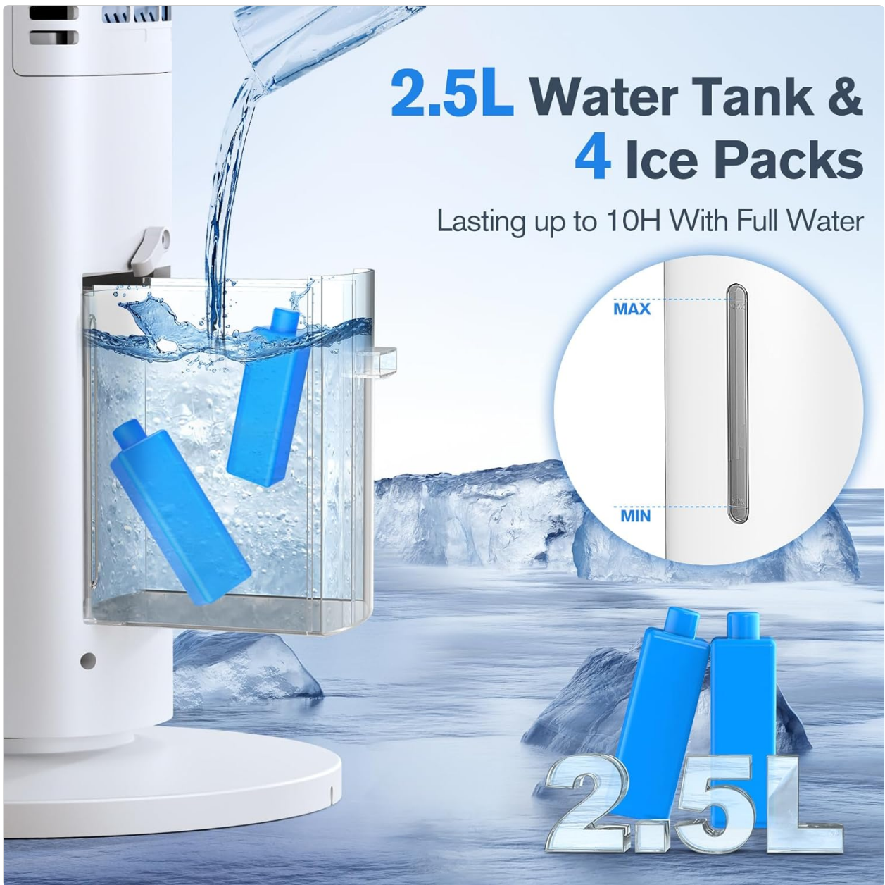
Image: The 2.5L water tank with maximum and minimum fill lines, shown with four ice packs.