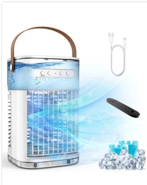
Image: The compact remote control for convenient operation.