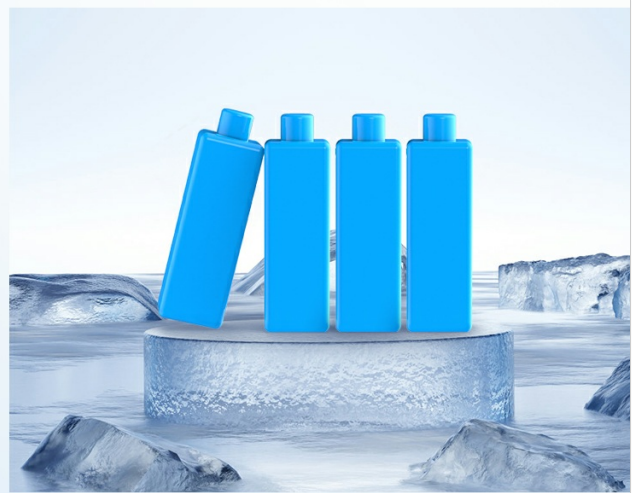
Image: Detailed instructions for freezing and using the gel-filled ice packs.