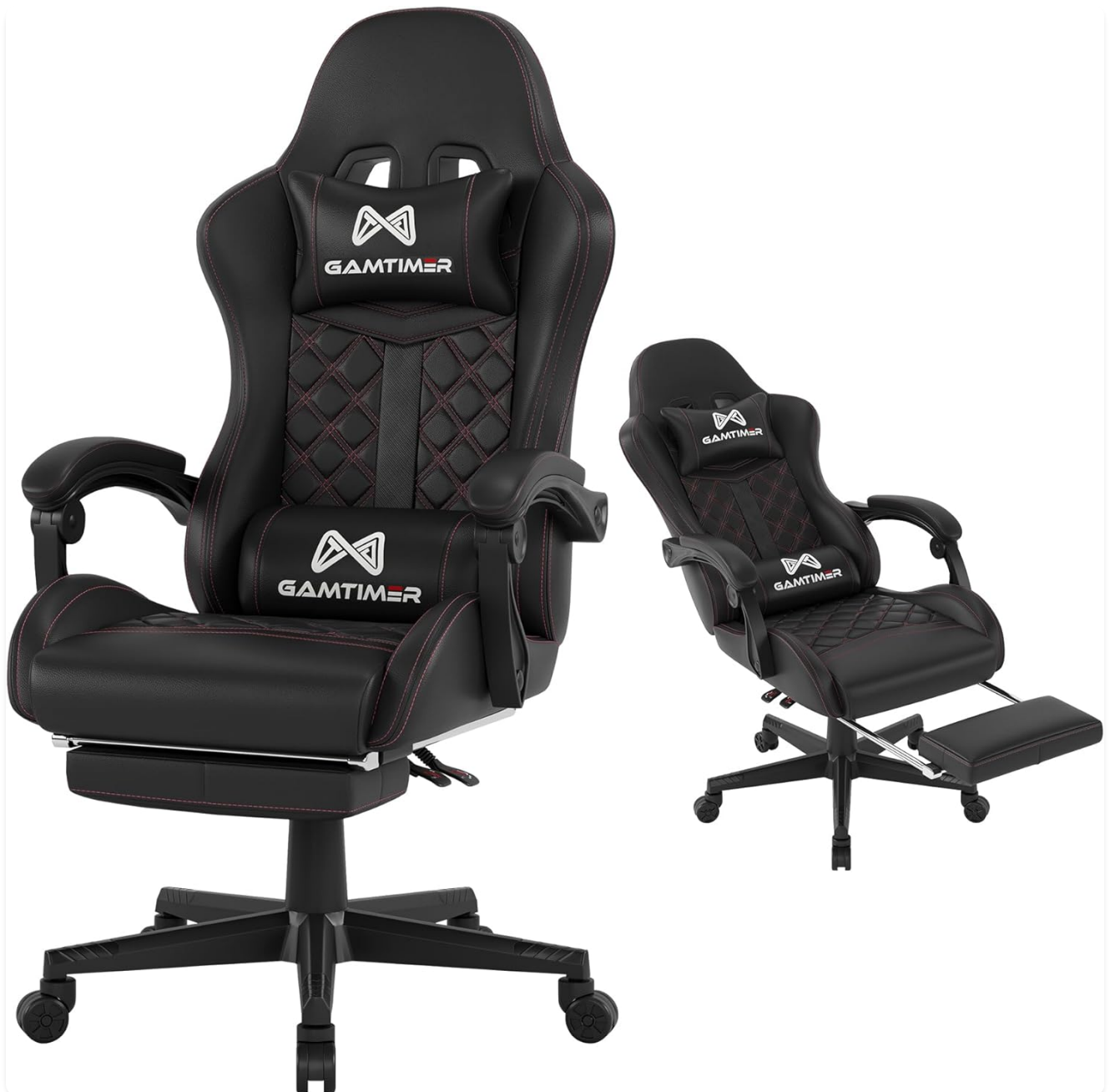
Image 1.1: Gamtimer Gaming Chair in upright and reclined positions, showcasing its versatility.