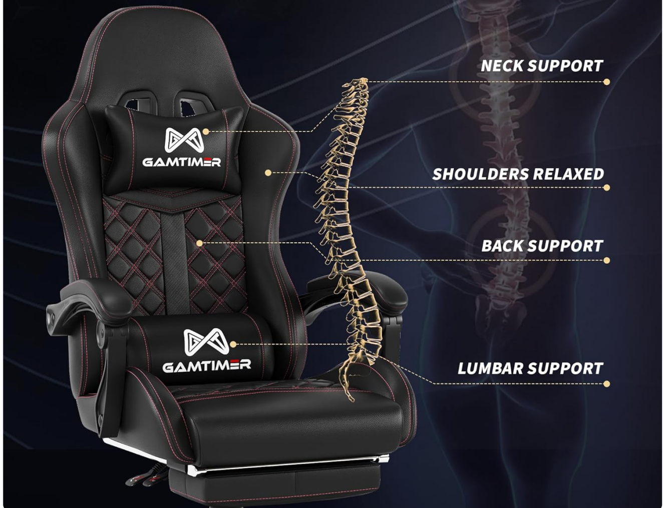
Image 5.1: Illustration of the chair's adjustable features, including recline angles, height adjustment, 360-degree swivel, and the concealed pull-out footrest.

relieves long working hours and pressure on lumbar and cervical vertebrae. Reduce fatigue