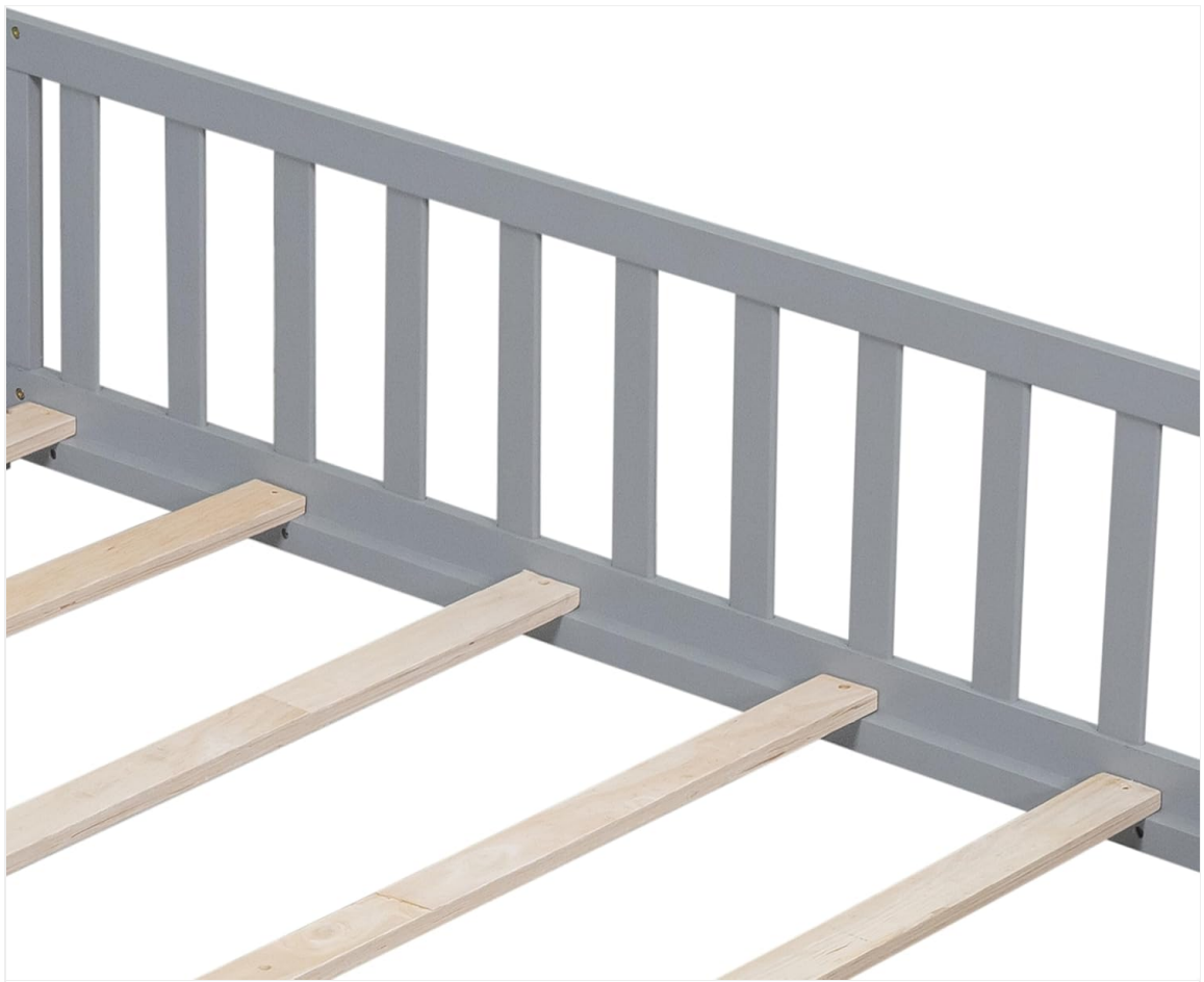
Image: View of the sturdy wooden slats providing mattress support.