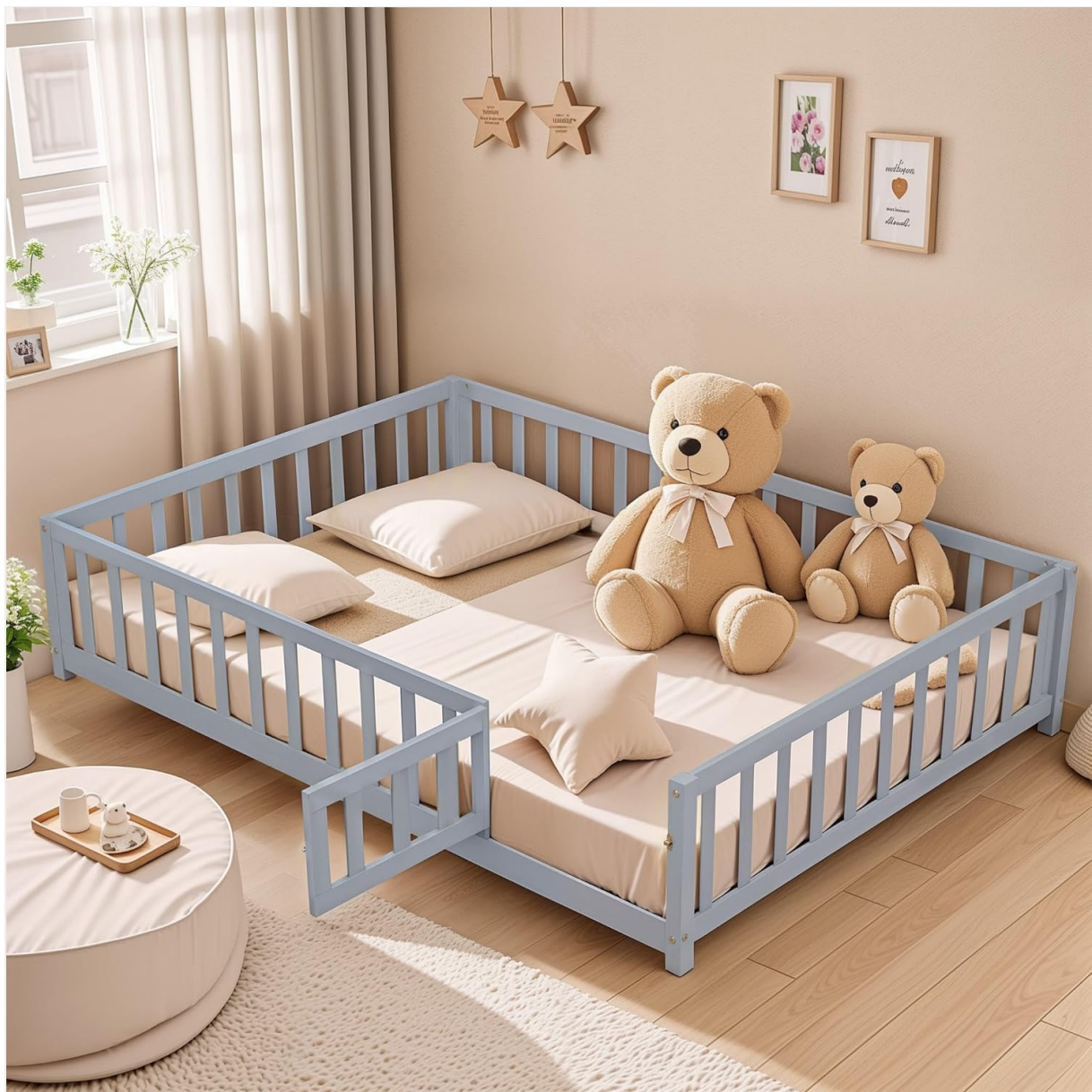
Image: The assembled bed frame with a mattress and decorative items, showcasing its low-profile design and fence.