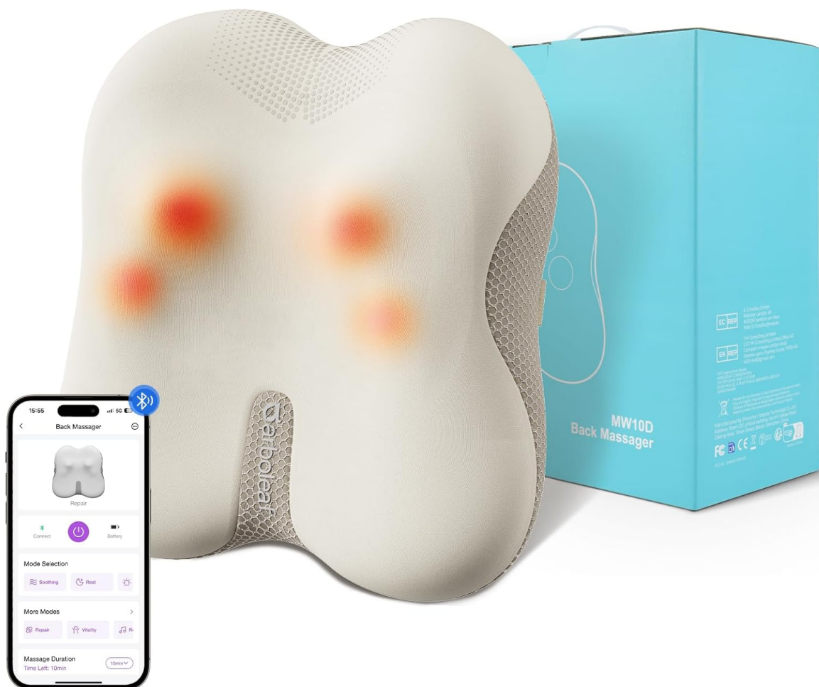
Image: The arboleaf MW10D Back Massager in ivory color, shown with its packaging and a smartphone displaying the control app.