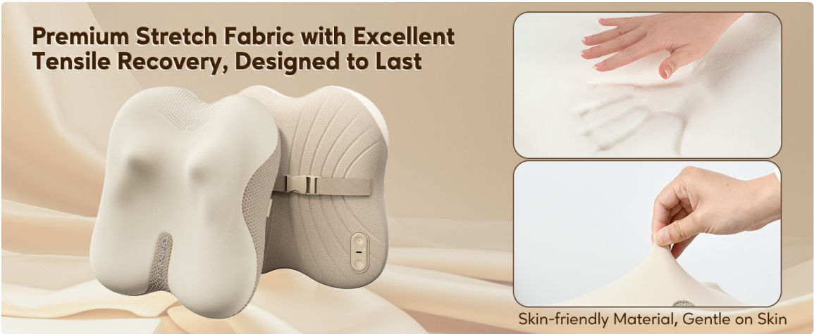
Image: The arboleaf MW10D Back Massager with its removable, dust-resistant, and washable cover being detached for cleaning.