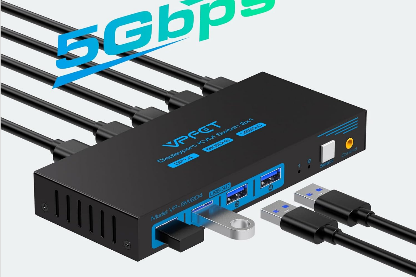
Figure 5: USB 3.0 Transfer Speeds. Highlights the 5Gbps transfer rate of USB 3.0, which is 10 times faster than USB 2.0.