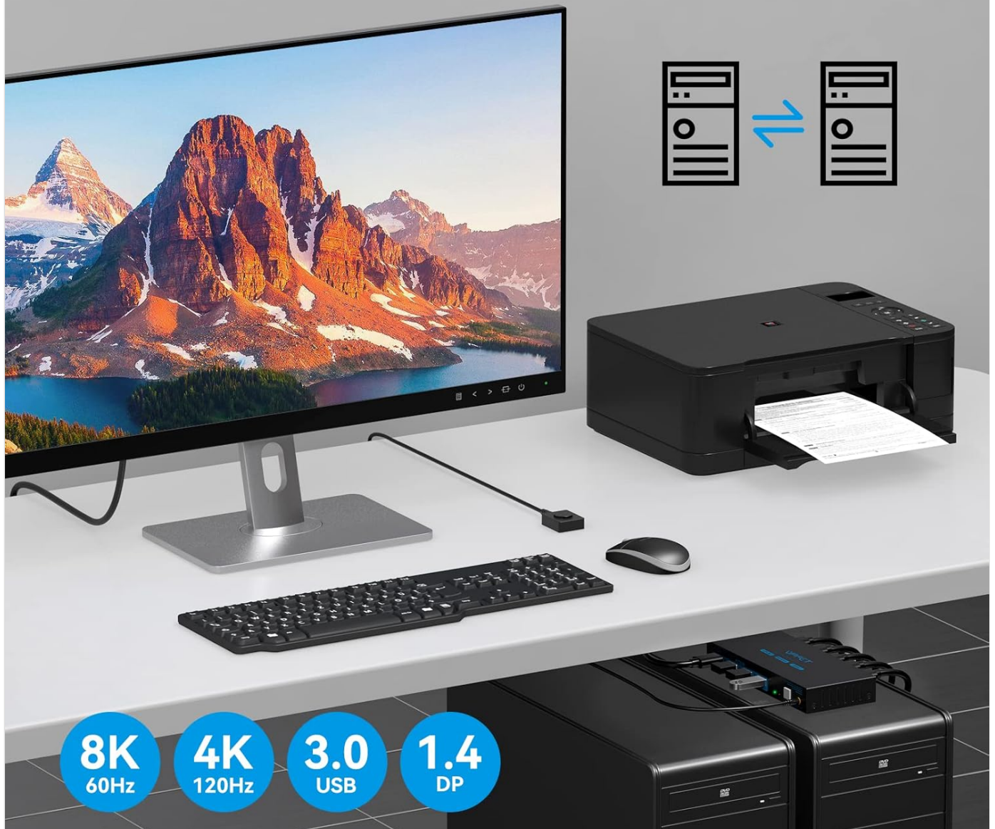
Figure 4: Two Quick Switch Modes. Illustrates the physical button on the KVM unit and the external desktop controller for switching inputs.