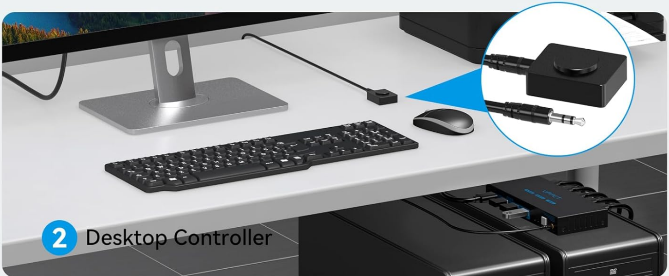
Figure 6: Shared Peripherals Setup. Demonstrates how two PCs can share a single monitor and multiple USB devices through the KVM switch.