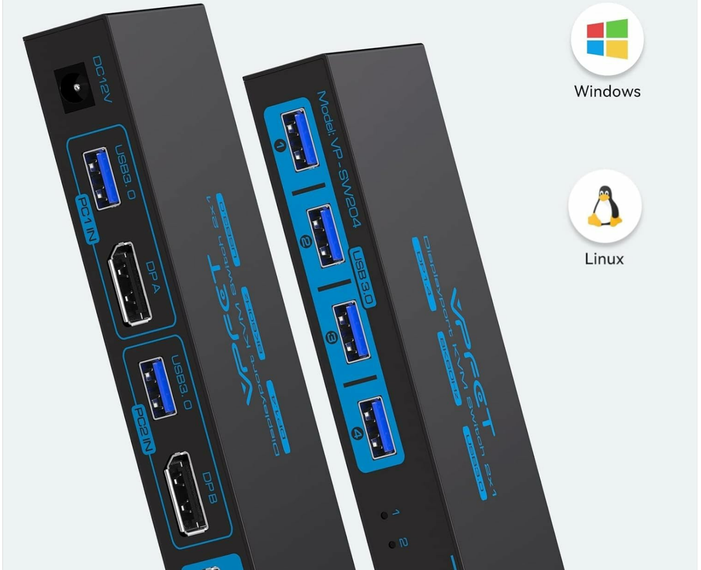
Figure 7: Broad Compatibility. The KVM switch supports Windows and Linux operating systems.