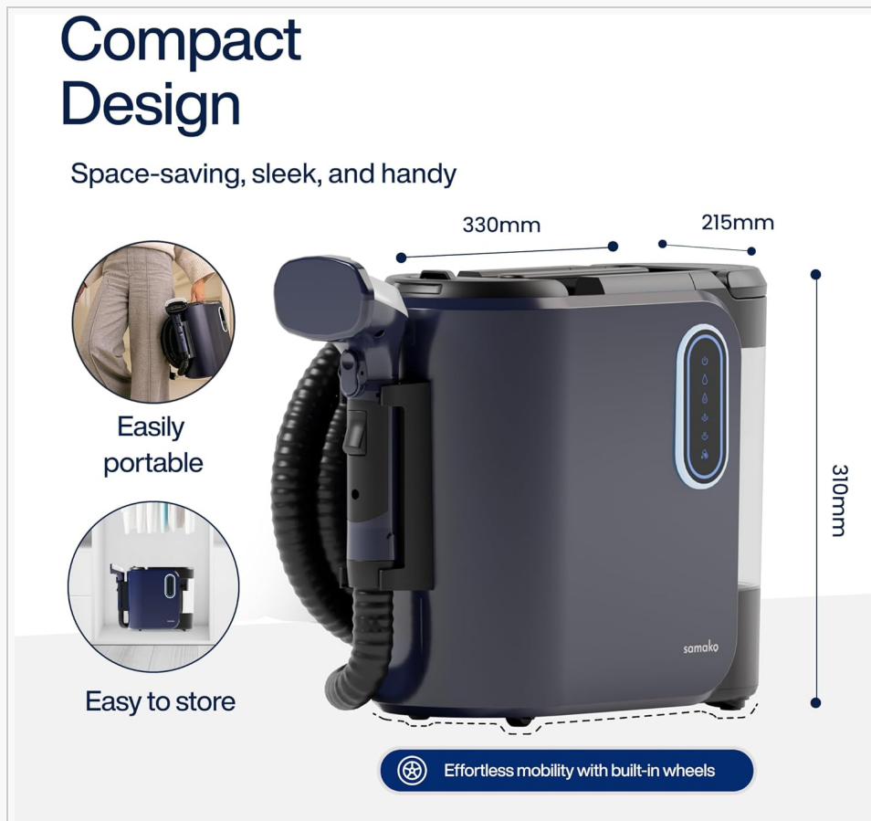
Figure 9: Compact design for easy storage.