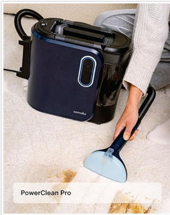
Figure 2: Main unit of the PowerClean Pro.