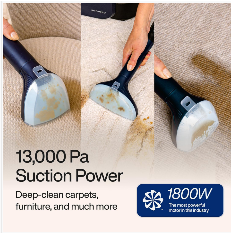
Figure 5: Demonstrating powerful suction on a carpet.