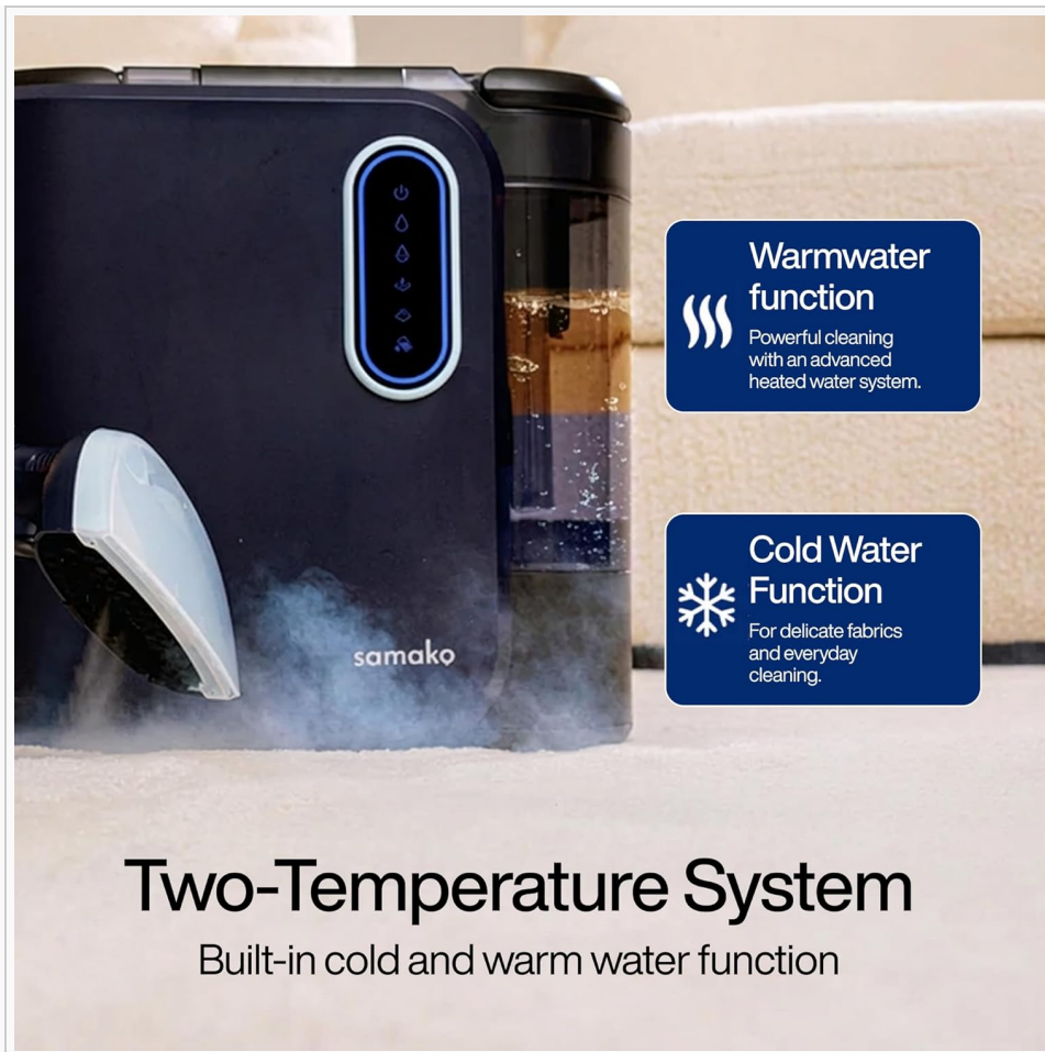
Figure 4: Warm and Cold Water Function indicators.

The appliance features both warm and cold water functions: