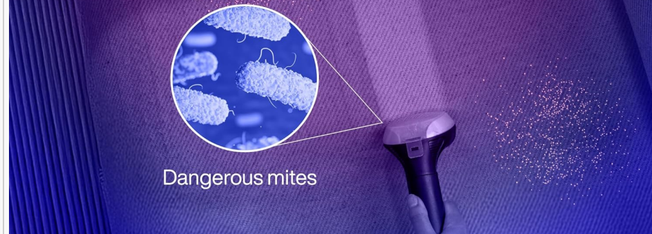
Figure 7: Cleaning upholstery and eliminating bacteria.

For a hygienic and healthy home, from floors to furniture & more.