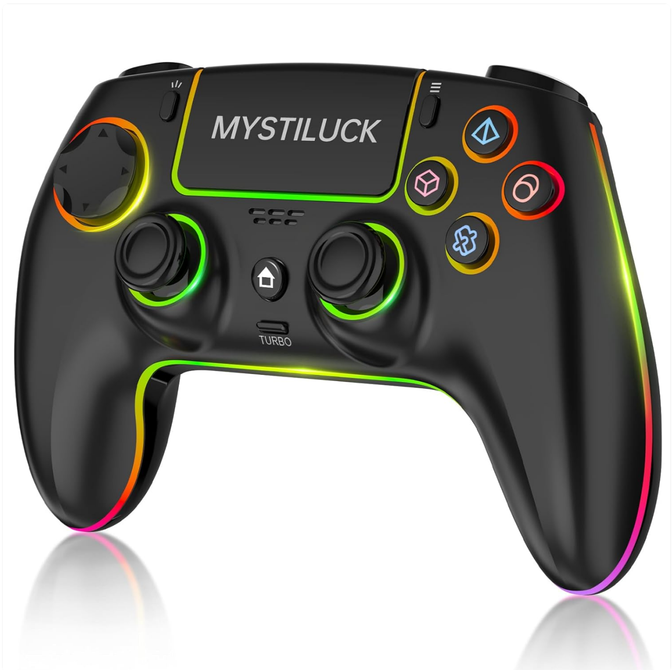
Image: The MYSTILUCK Wireless Controller, featuring a black finish with colorful LED accents around the joysticks, touchpad, and button outlines.