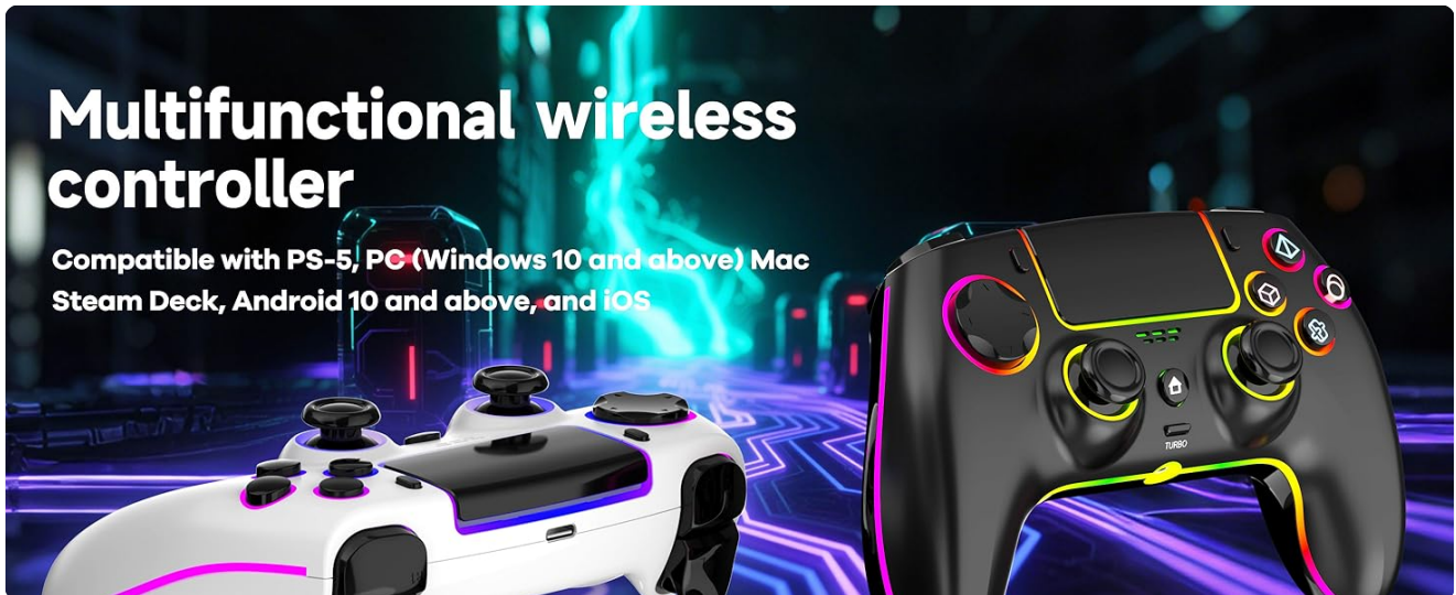
Image: A graphic illustrating the MYSTILUCK Wireless Controller's compatibility with PS5, PC, Mac, Steam Deck, Android, and iOS devices.

The MYSTILUCK Wireless Controller supports multiple connection methods depending on the device.