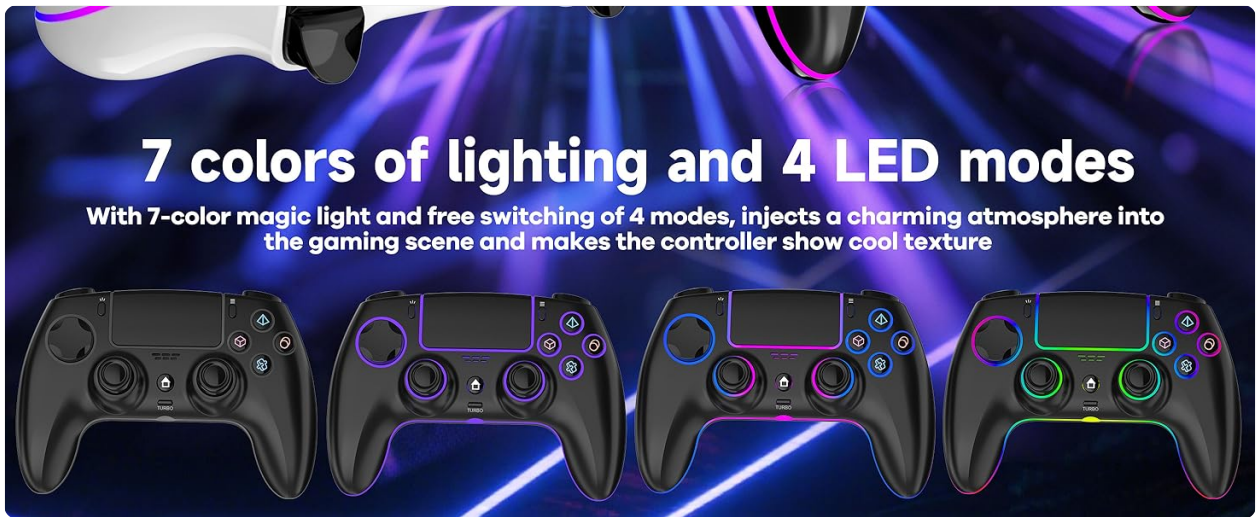
Image: Four MYSTILUCK Wireless Controllers, each illuminated with different LED colors, demonstrating the customizable lighting options.