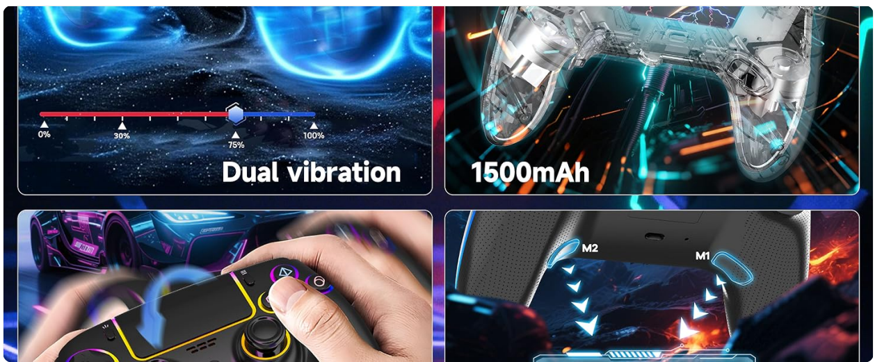
Image: A visual representation of the controller's dual vibration feature and its 1500mAh battery capacity.