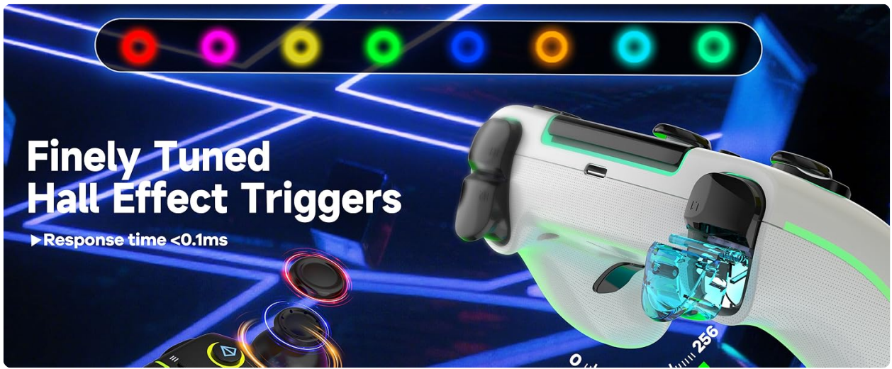
Image: A cutaway view of the controller's trigger mechanism, highlighting the Hall Effect sensor for improved responsiveness.