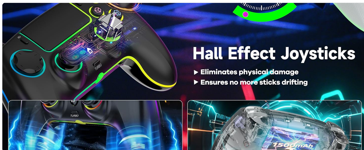
Image: An X-ray style diagram illustrating the internal mechanism of the Hall Effect Joysticks, emphasizing the magnetic sensing technology.