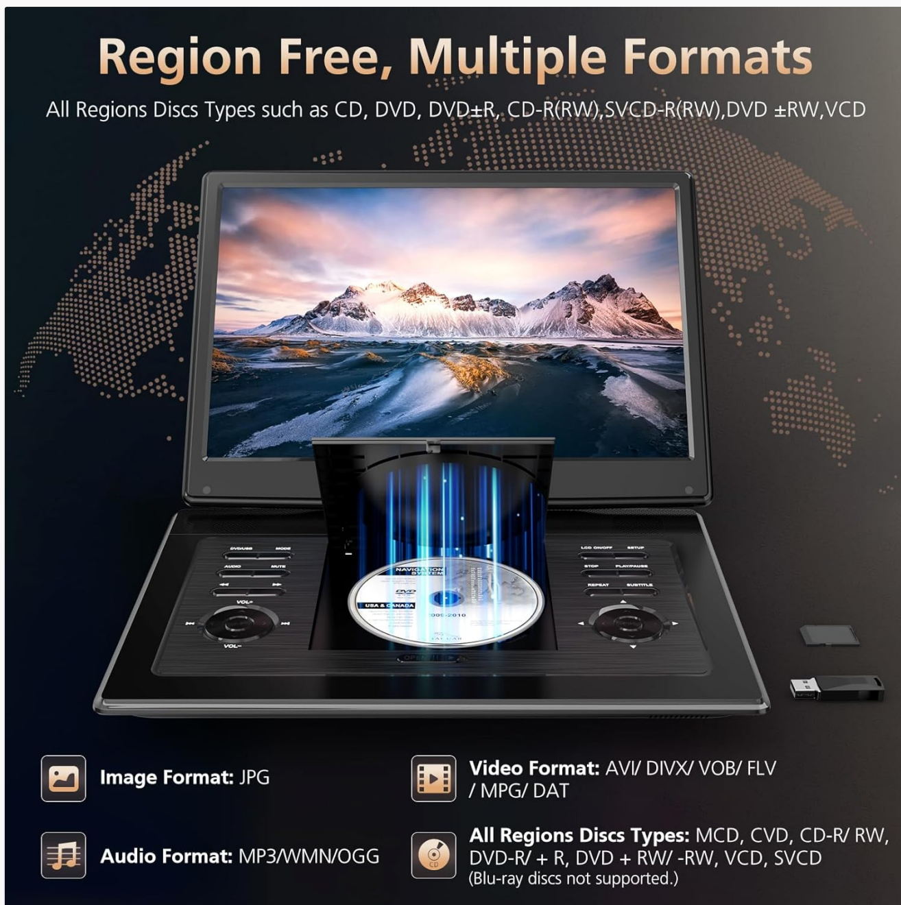
Figure 5.1: The disc tray open, showing how to insert a DVD into the player.