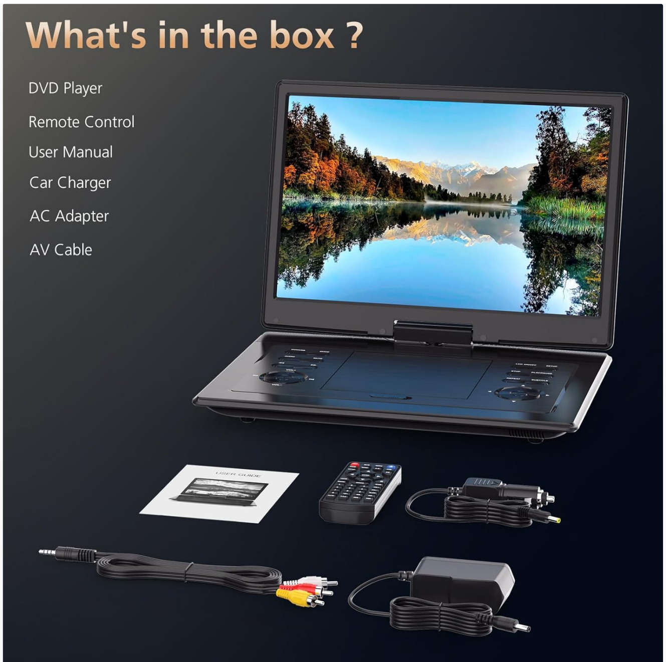
Figure 3.2: All items included in the PJGCWB PD-1504 Portable DVD Player package: the player, remote control, AC charger, car charger, and AV cable.