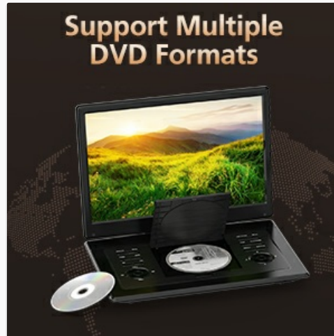
Figure 5.3: The portable DVD player shown with its remote control, highlighting flexible screen and convenient control.

The included remote control provides full functionality from a distance. Ensure batteries are inserted correctly (not included).