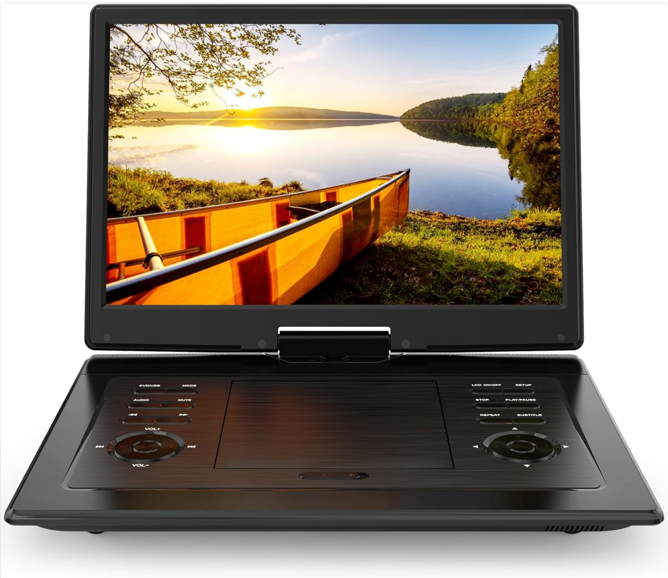
Figure 3.1: Front view of the PJGCWB PD-1504 Portable DVD Player with the screen open, displaying controls and the disc tray area.