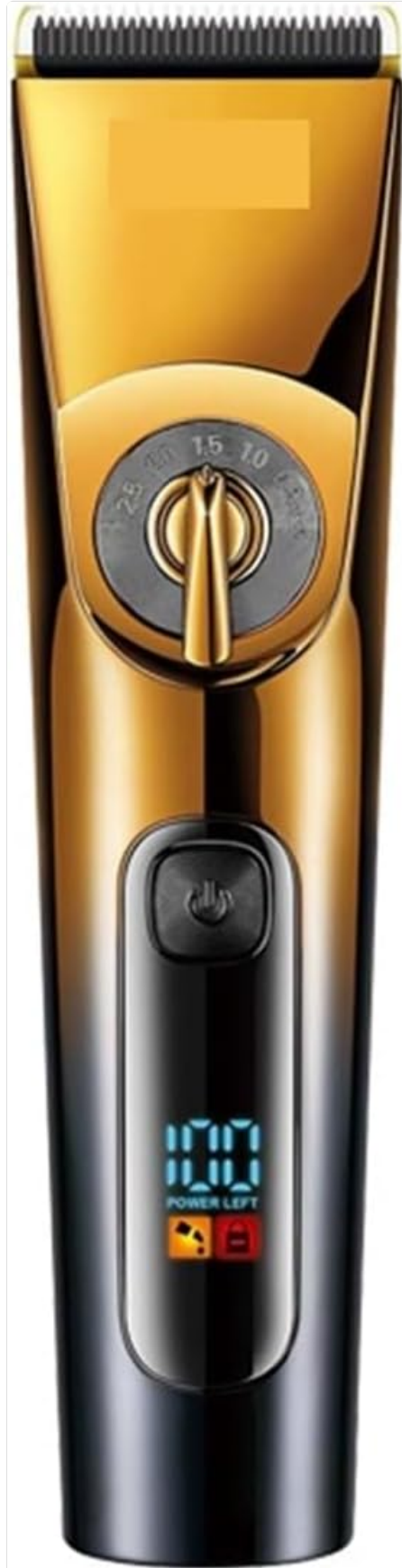
Image 2: Front view of the FFGHUI V-663 Hair Clipper, showing the golden blade housing, the power button, the taper lever, and the digital display indicating battery level.

Familiarize yourself with the different parts of your hair clipper.