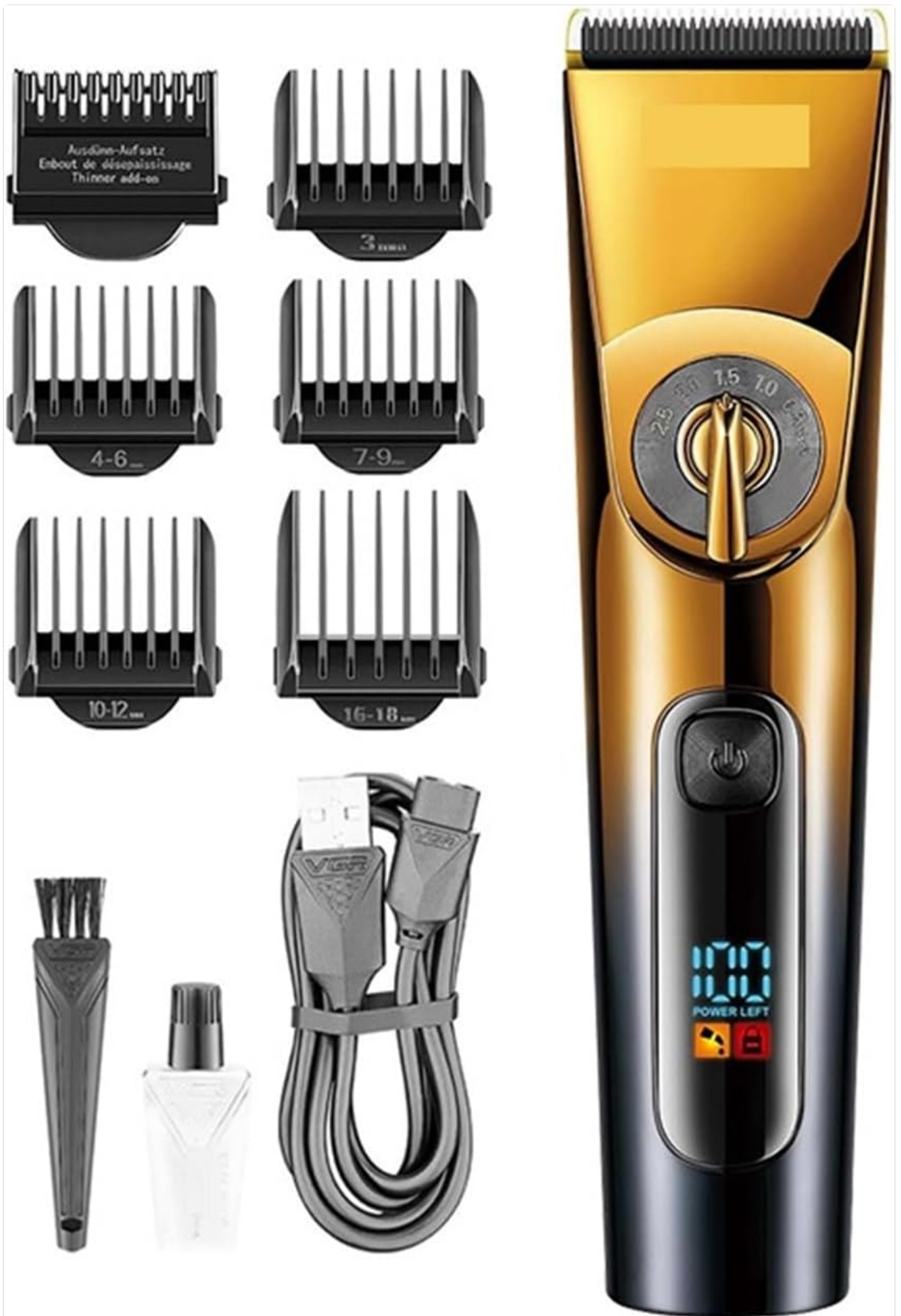
Image 1: Contents of the FFGHUI V-663 Hair Clipper package, including the clipper, various guide combs, a USB charging cable, a