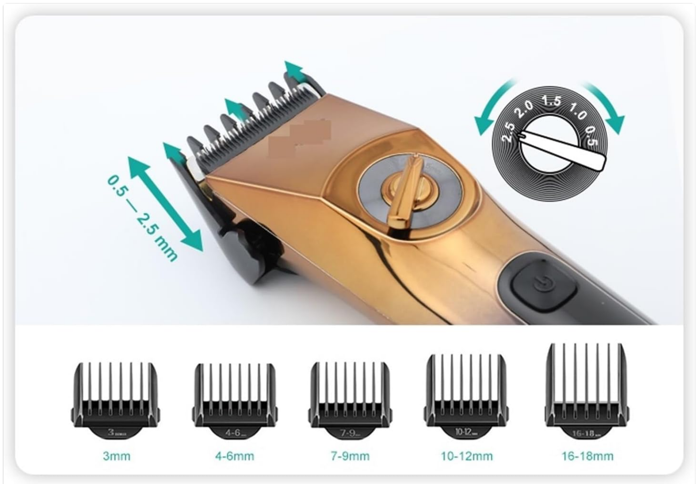
Image 4: The FFGHUI V-663 Hair Clipper demonstrating the adjustable taper lever (0.5mm to 2.5mm) and showing the various guide comb sizes: 3mm, 4-6mm, 7-9mm, 10-12mm, and 16-18mm.

Select the desired guide comb for your preferred hair length.