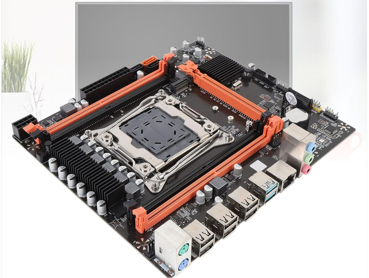
Figure 4: Storage Connectivity. This image shows the Serial ATA ports and the M.2 slot, supporting NGFF and NVME protocols for various storage solutions.

Desktop motherboard supports Serial ATA port, which is compact and easy to install. It is easy to use and has high compatibility.