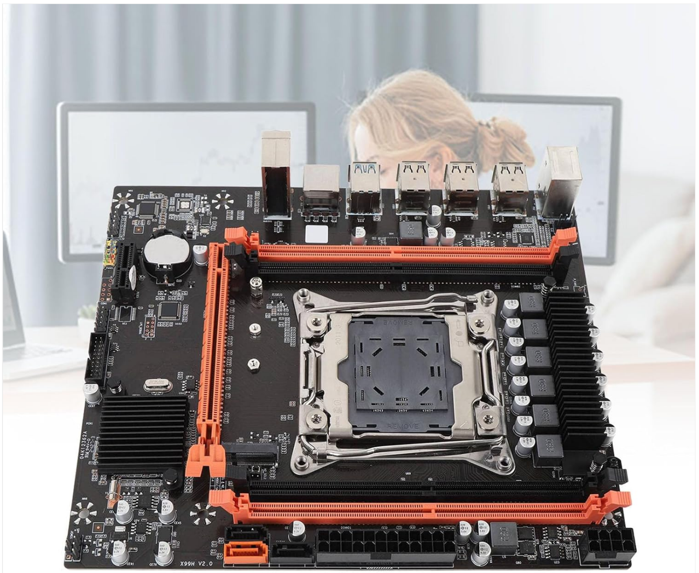
Figure 1: Zunate X99H Motherboard - Top View. This image displays the overall layout of the motherboard, including the LGA 2011-3 CPU socket, four DDR4 DIMM slots, PCIe slots, and various headers and ports.