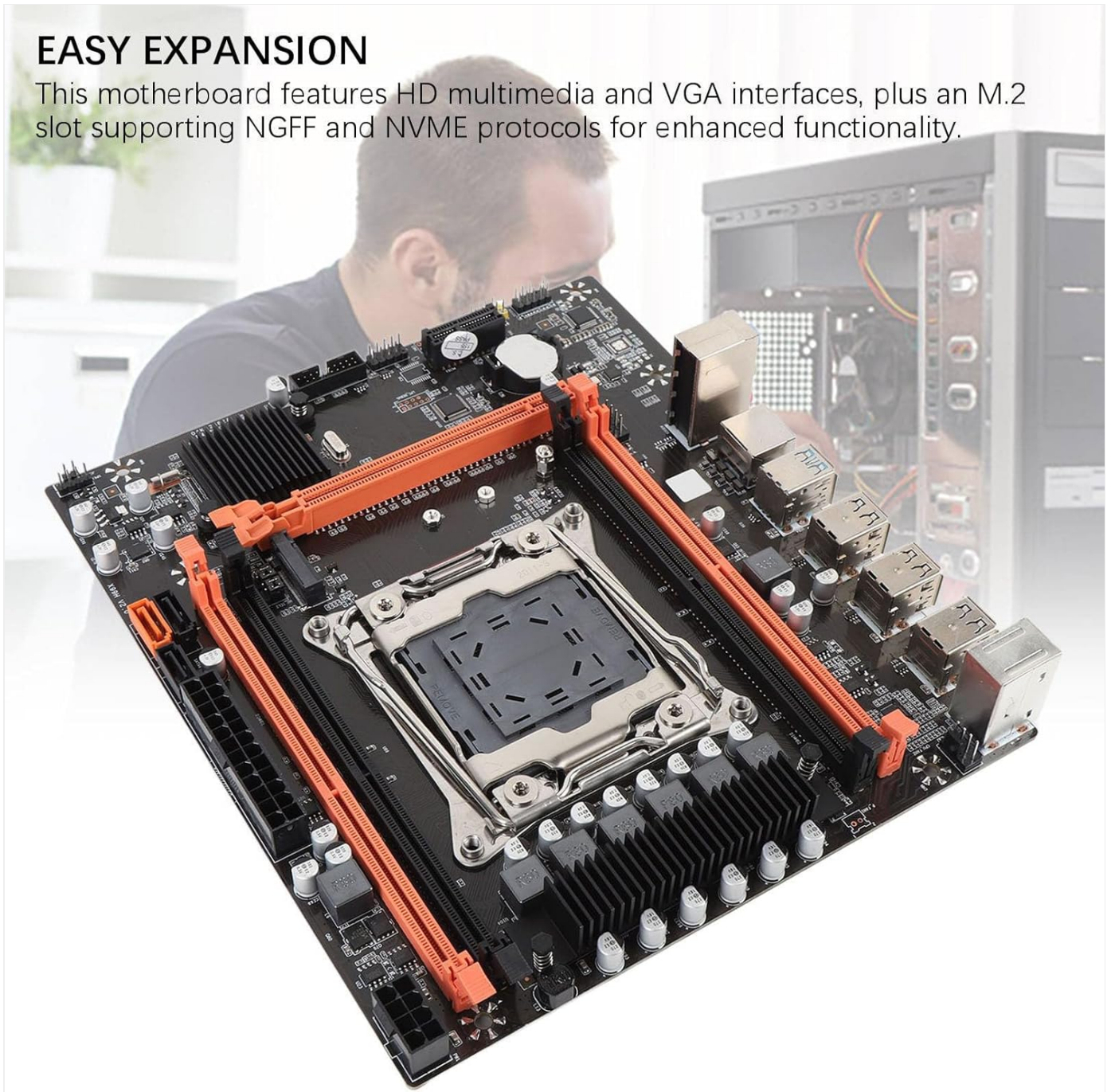
Figure 7: Expansion Capabilities. This image highlights the M.2 slot, supporting NGFF and NVME protocols, and other expansion slots like PCIe x16 and PCIe x1, along with HD multimedia and VGA interfaces.

This motherboard features HD multimedia and VGA interfaces, plus an M.2 slot supporting NGFF and NVME protocols for enhanced functionality.