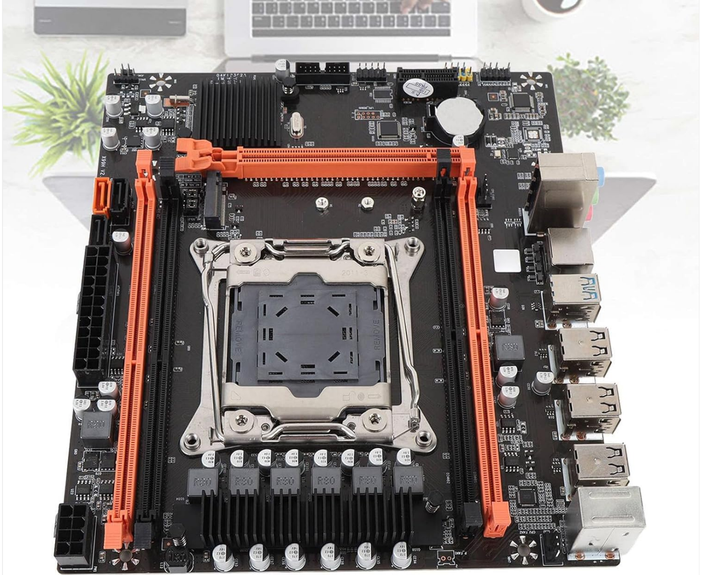
Figure 6: Stable Performance Components. This image highlights the solid capacitors used on the motherboard, contributing to its stability and extended lifespan.

Equipped with all solid capacitors for stability and prolonged lifespan, ensuring dependable motherboard operations, bringing you convenient use.