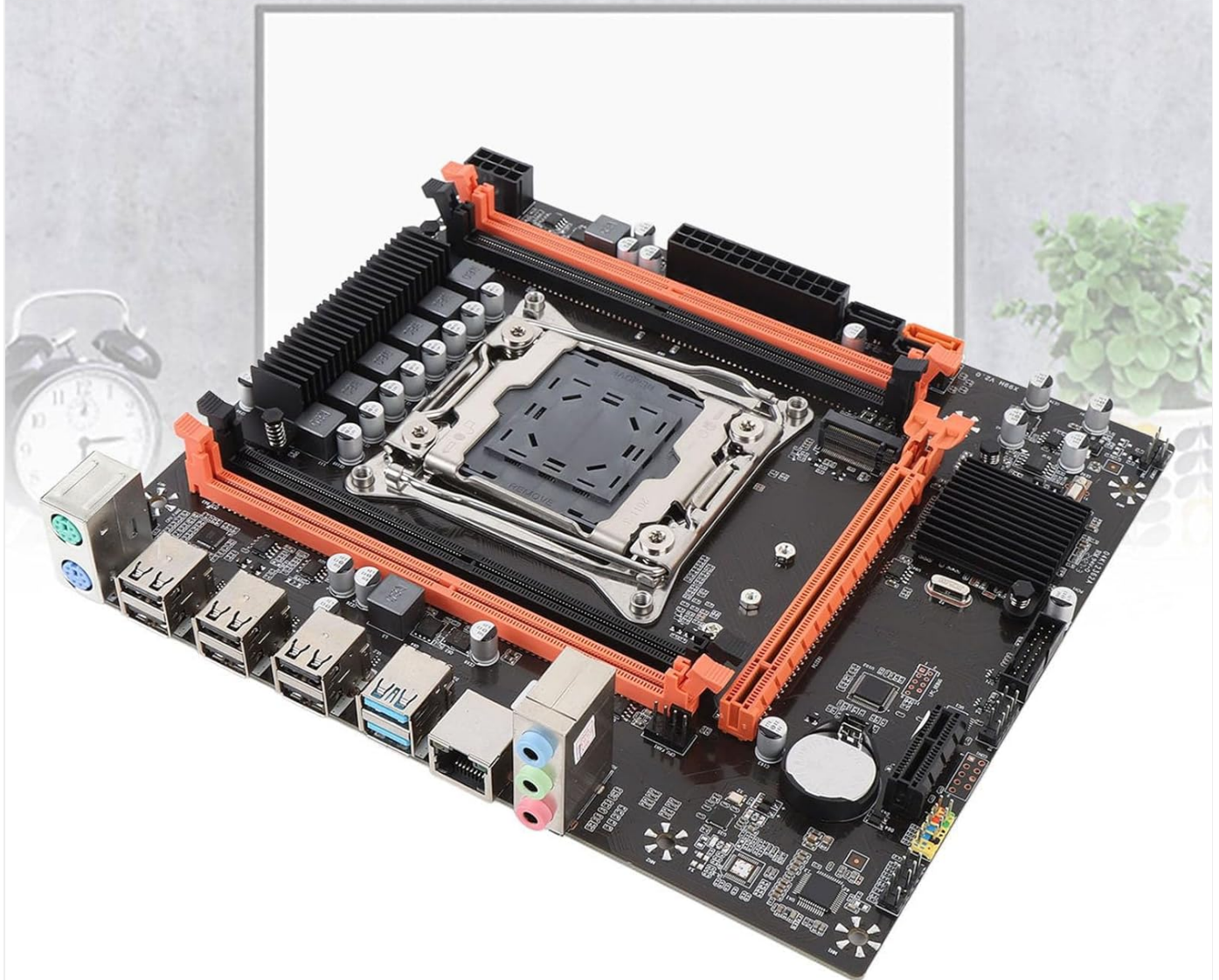
Figure 3: Memory Support. This image highlights the four DDR4 DIMM slots, capable of supporting up to 128GB of DDR4 2666/2400/2133MHz memory.

Computer motherboards support 4×DDR4 DIMMs with a maximum capacity of 128G, memory types is DDR4 2666, 2400, 2133MHz.