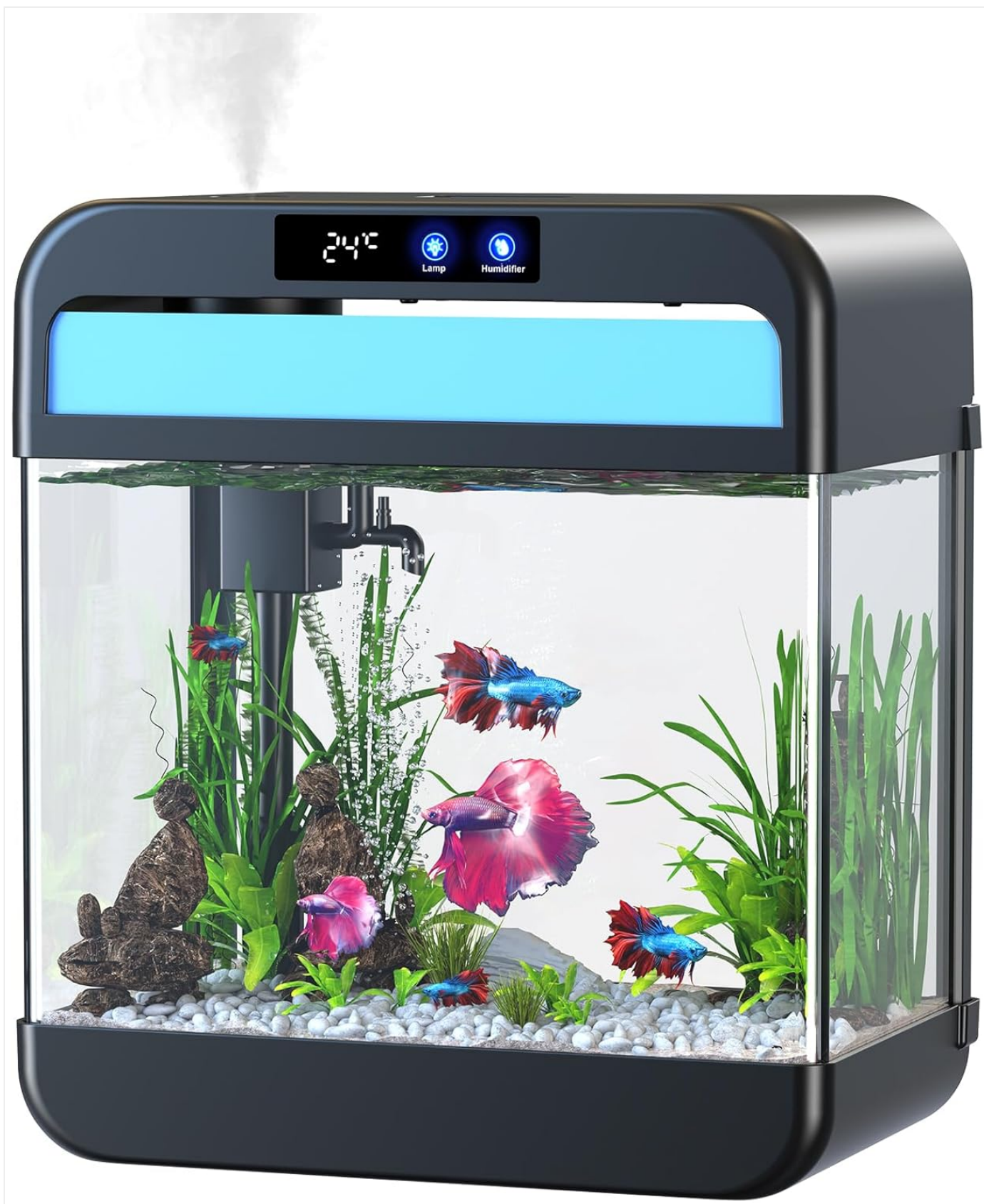
Image 1.1: The JPHYLL 2.2 Gallon Smart Fish Tank, showcasing its integrated humidifier and vibrant lighting.