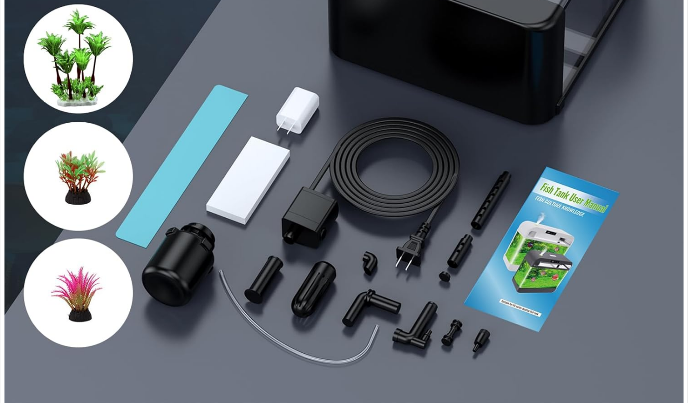
Image 3.1: Contents of the JPHYLL Smart Fish Tank package, including the tank, pump, plants, and accessories.