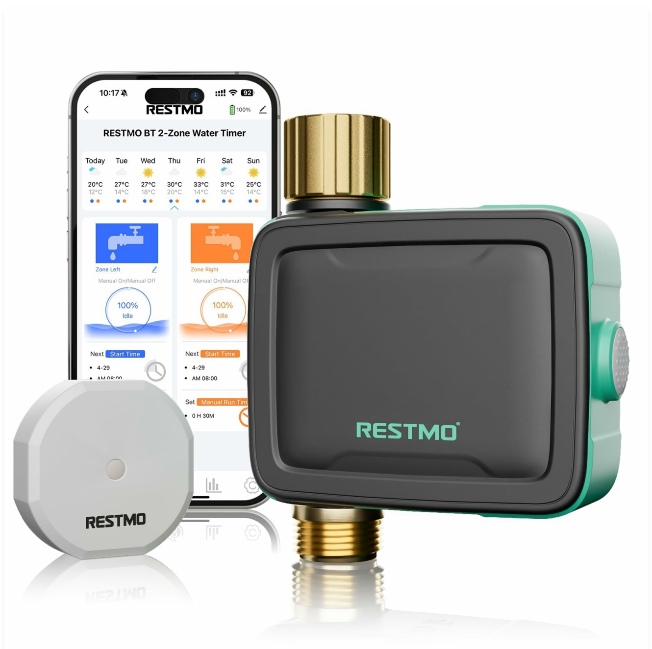
The RESTMO Smart Sprinkler Timer, ready for installation.