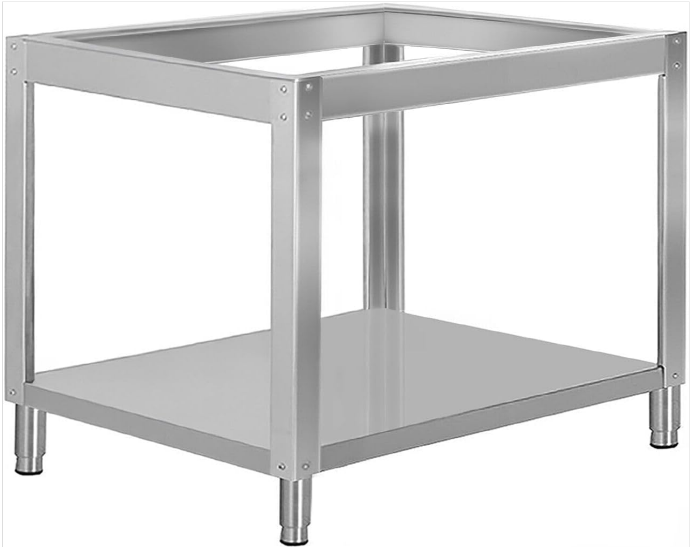
Figure 1: The fully assembled GGM Gastro UDP99-N Support Stand, ready for use with a compatible pizza oven. This image shows the robust stainless steel construction and the lower storage shelf.