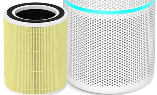
Figure 2: The DAYETTE AP203 Air Purifier shown with its compatible replacement filter, emphasizing quality, optimal performance, and value.