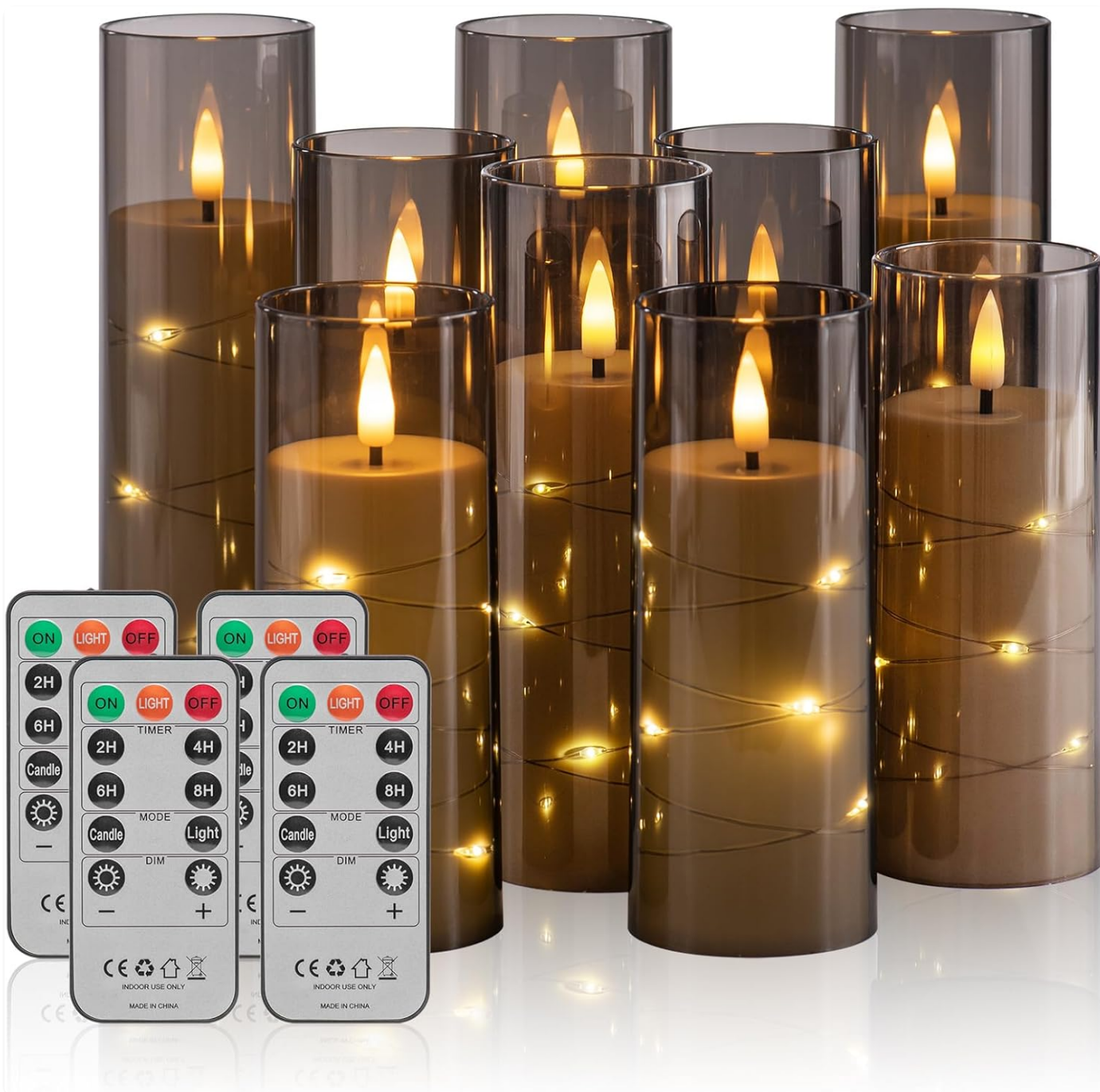
Image: An 18-pack of Pandaing flameless LED candles in various heights, featuring embedded star strings and accompanied by four remote controls. The candles are grey with a warm, flickering light.