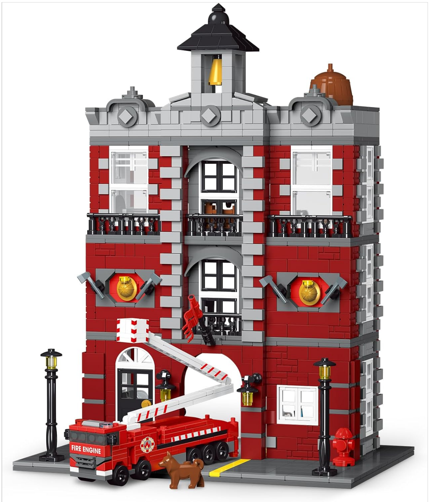
Image: The fully assembled City Fire Rescue Building Set, showcasing the detailed three-story fire station with its red brick facade, grey accents, and a fire truck parked in front. A fire hydrant and street lamps are also visible.