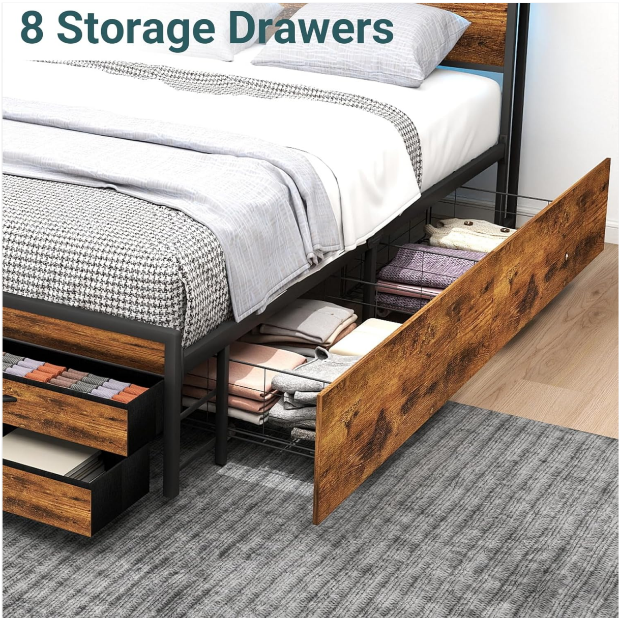
Image: The bed frame with its eight storage drawers extended, demonstrating ample storage capacity.

The bed frame includes 8 integrated storage drawers. To open, gently pull the handle. To close, push the drawer back until it is fully seated under the bed. Ensure drawers are not overloaded to prevent damage.