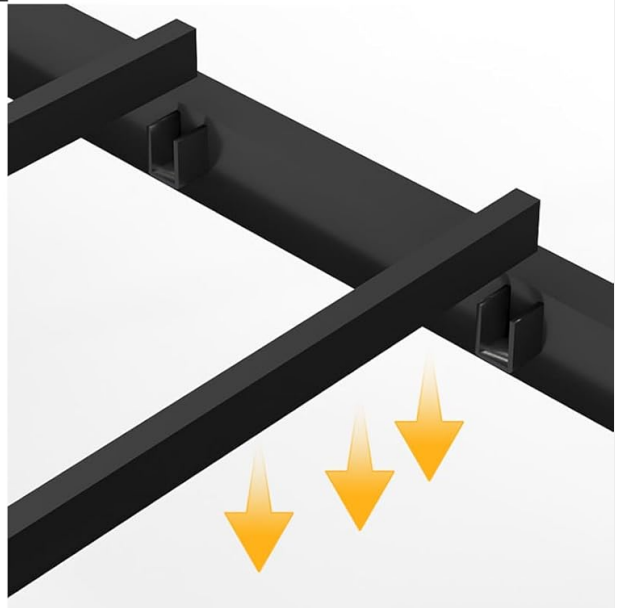
Image: Illustration of the bed frame's quiet design elements and simplified assembly process.