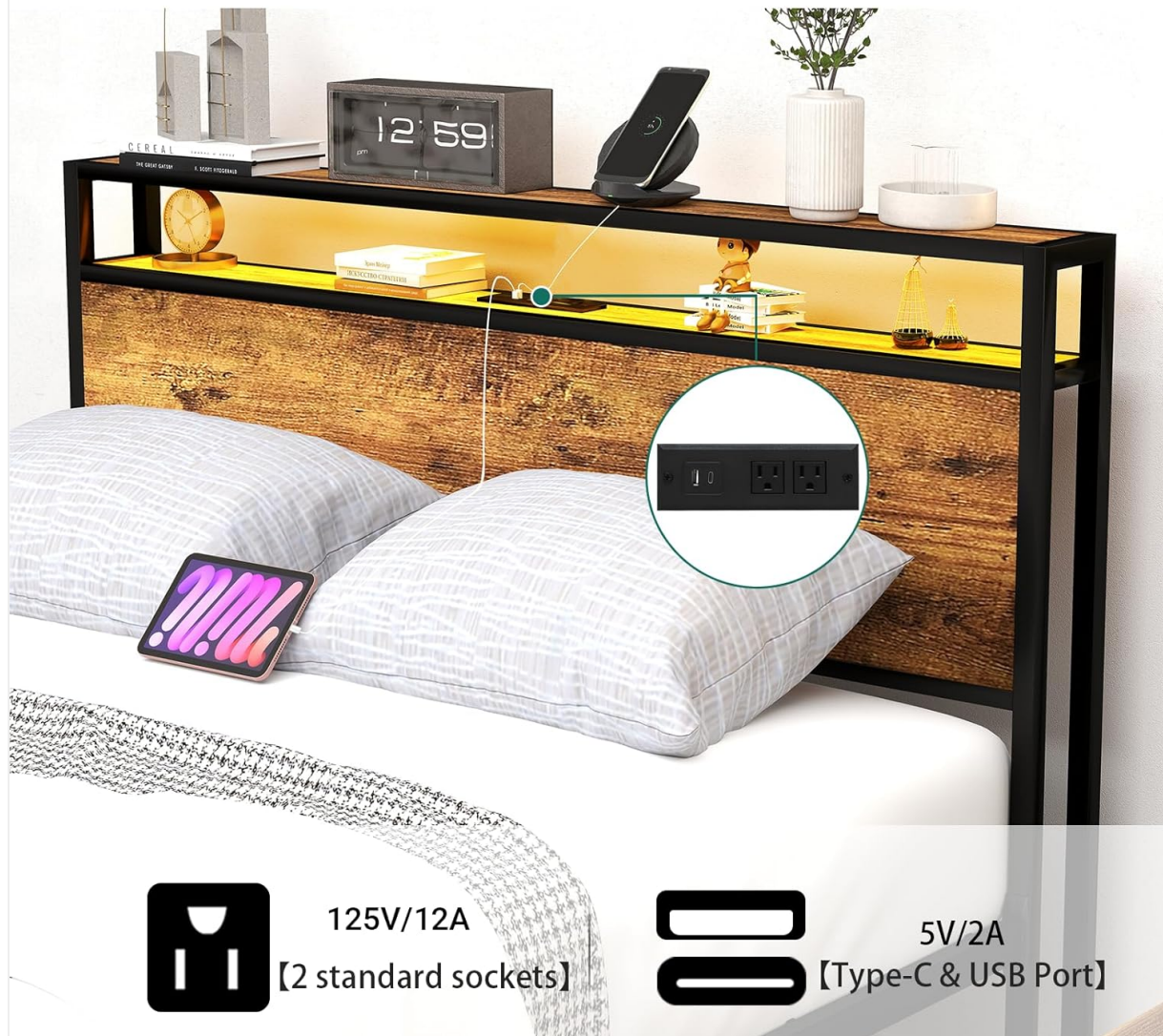
Image: Detail of the headboard's charging station, featuring two standard 125V/12A outlets and a 5V/2A Type-C & USB port.

The headboard features a built-in charging station with USB ports and standard AC outlets. Plug the bed frame's power cord into a wall outlet. You can then connect your devices to the USB ports or AC outlets for charging. Do not exceed the maximum power rating of the charging station.