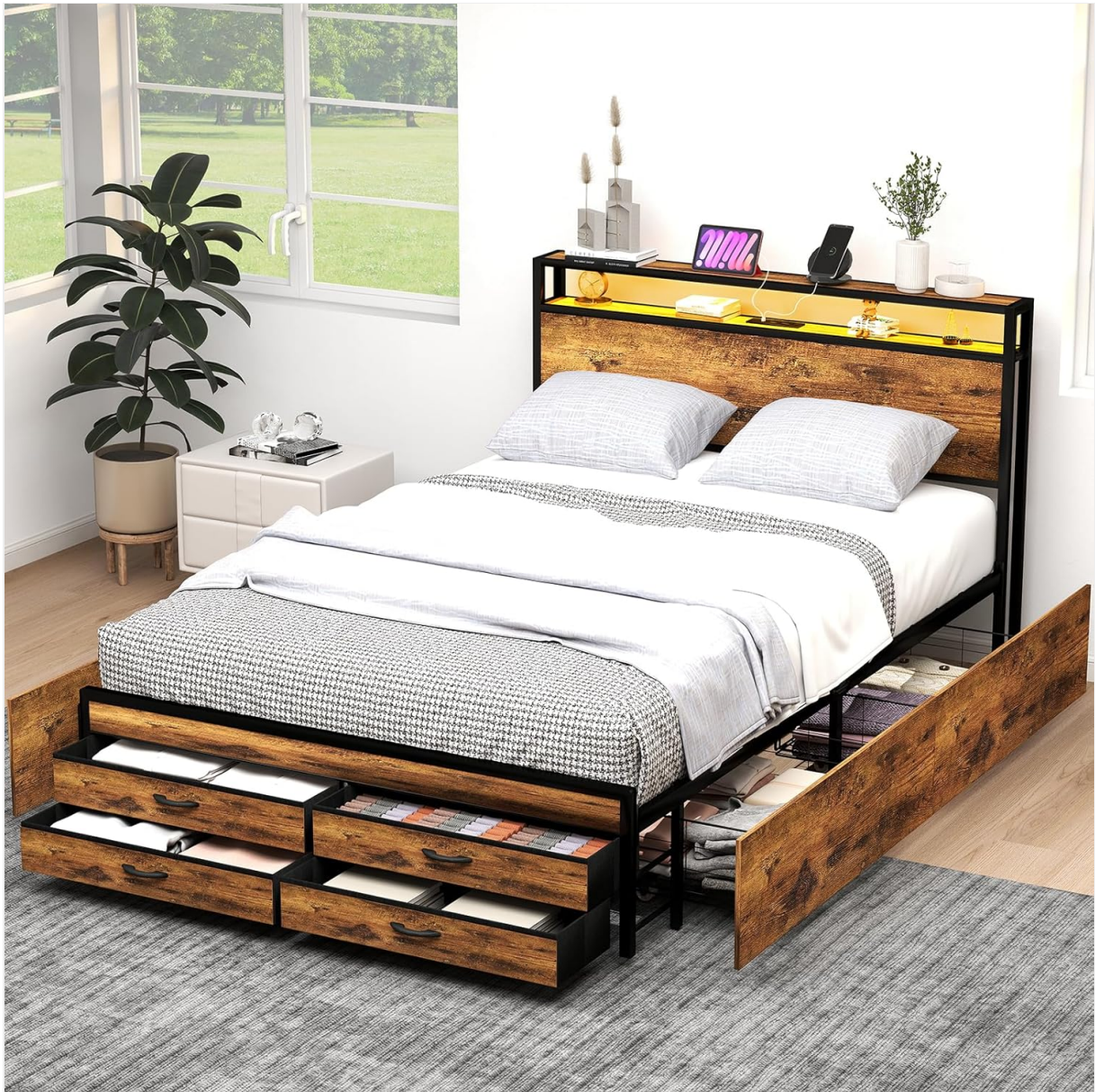
Image: Overview of the Zevemomo Full Size Bed Frame, highlighting its integrated headboard, storage drawers, and overall design.