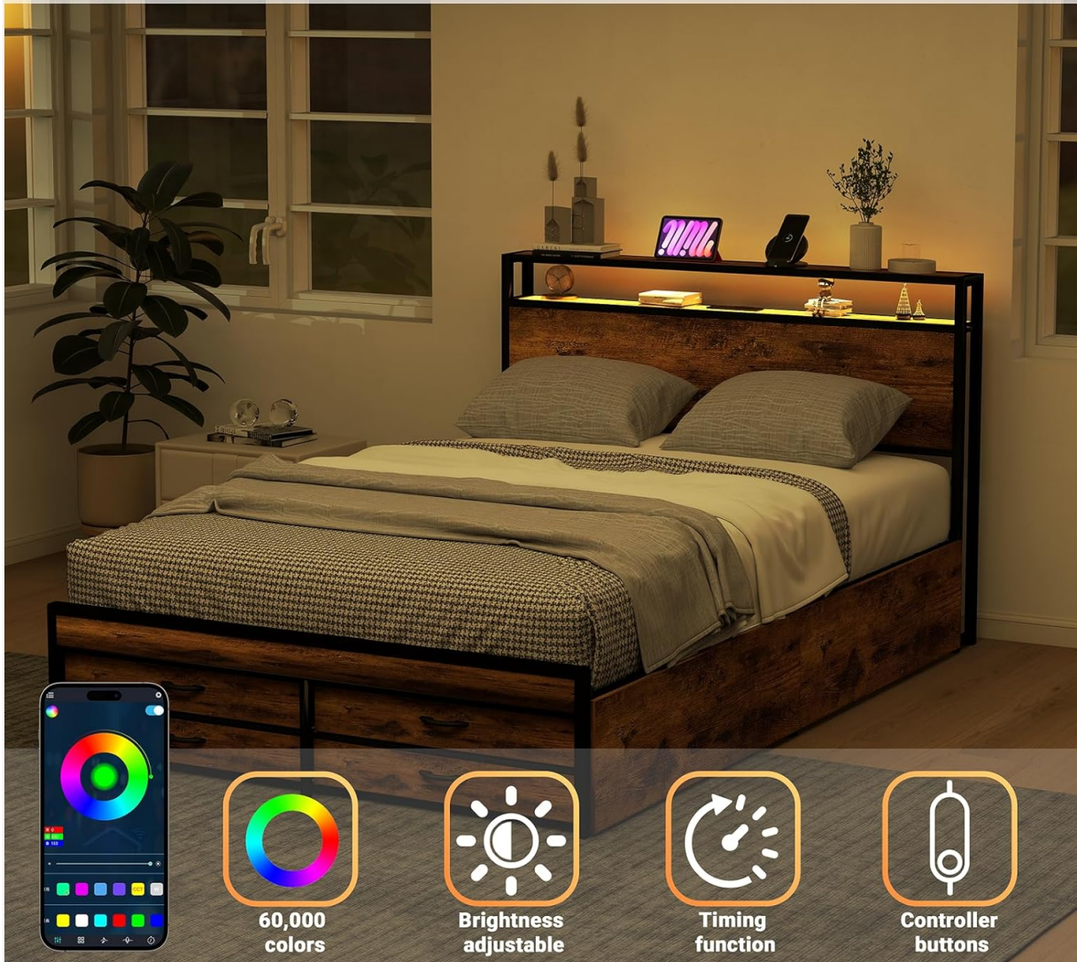
Image: The bed frame's headboard illuminated by RGB LED lights, demonstrating various color settings and control options for brightness and timing.

The headboard is equipped with adjustable RGB LED lights. Use the provided remote control or integrated buttons to change colors, adjust brightness, and set timing functions. Refer to the separate LED light manual for detailed instructions on specific modes and features.