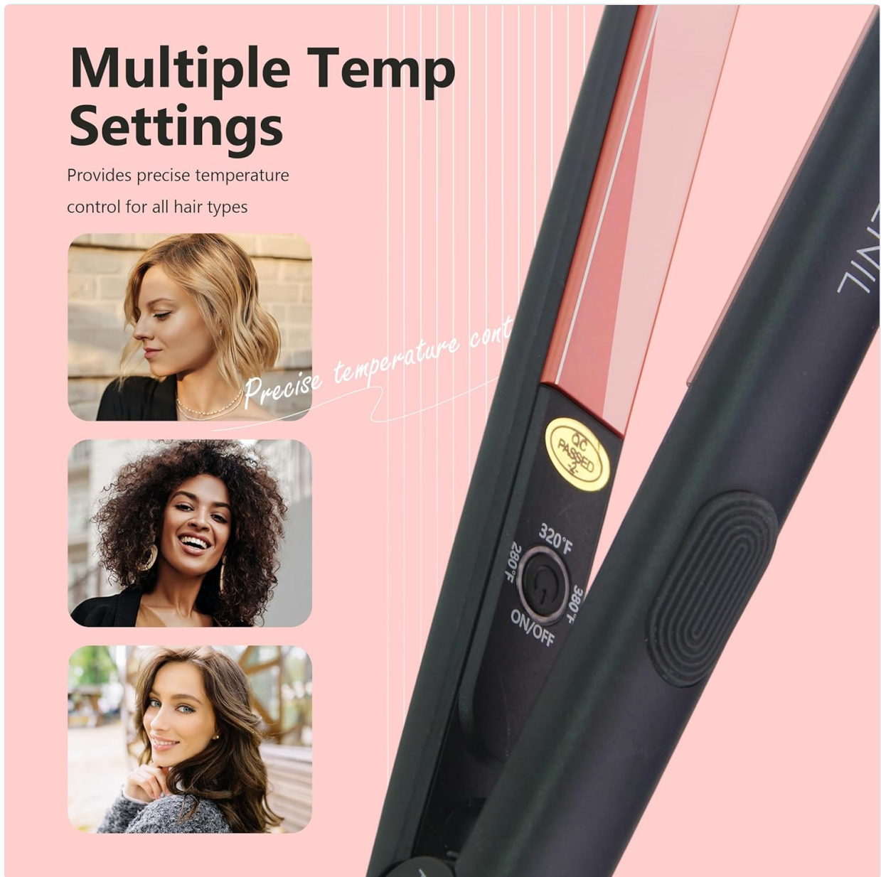
Image: A close-up of the ANGENIL Ultra Mini Hair Straightener's internal controls, displaying the power button and selectable temperature settings of 280°F, 320°F, and 380°F.