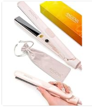
Image: The ANGENIL Ultra Mini Hair Straightener alongside its soft travel bag, designed for convenient and safe storage.