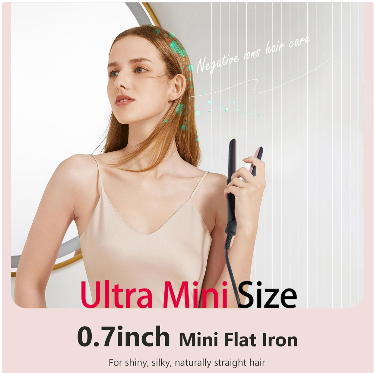
Image: A woman styling her hair with the ANGENIL Ultra Mini Hair Straightener. The image highlights the negative ion technology for smooth, shiny results.