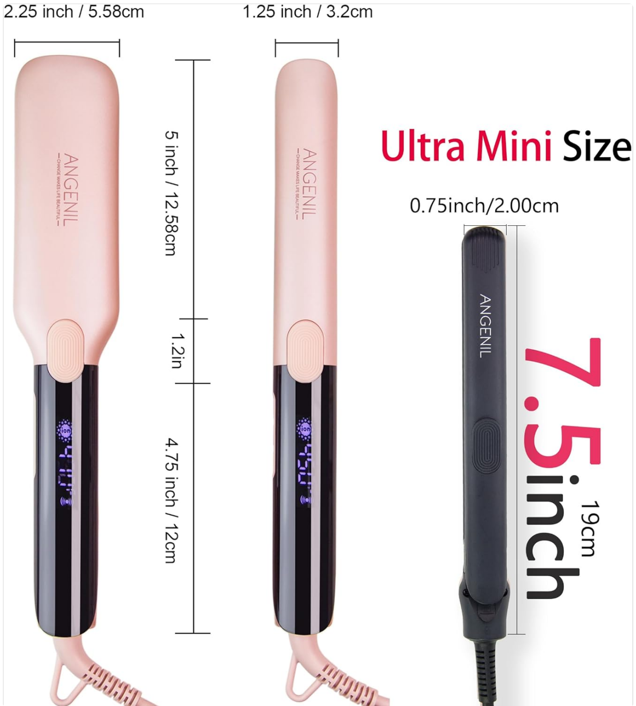
Image: Technical drawing illustrating the precise dimensions of the ANGENIL Ultra Mini Hair Straightener, including its 0.7-inch plate width and overall length, emphasizing its compact design.