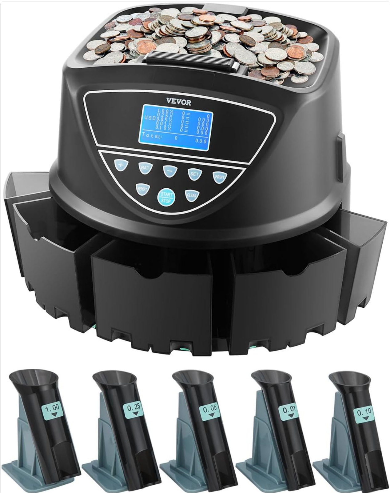
Figure 1: VEVOR Upgraded Coin Counter & Sorter with coin tubes.