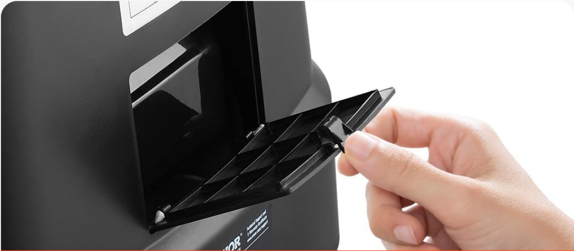
Coin Jamming Device: Easy Jam Handling