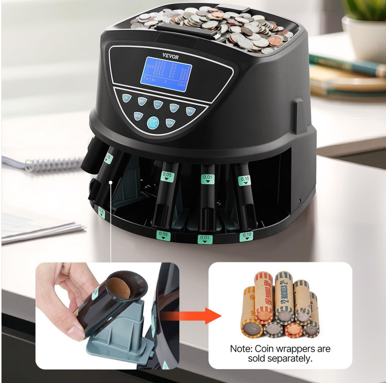
Figure 5: Illustration of the coin sorting and wrapping process, showing how coin wrappers are inserted.