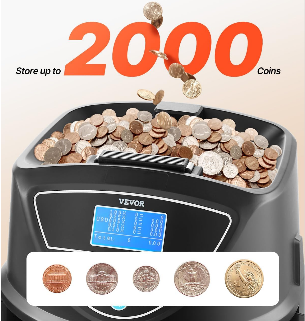
Figure 3: The large capacity hopper capable of holding up to 2000 coins.