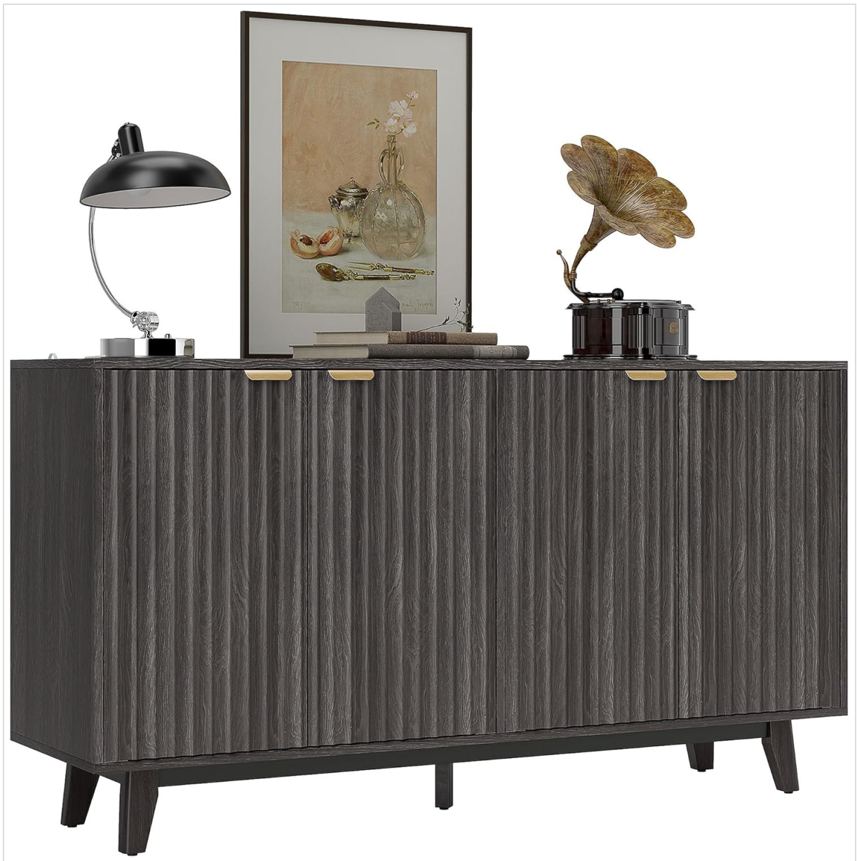
Image 1.1: The HOMCOM Fluted Sideboard Buffet Cabinet, showcasing its distressed gray finish and fluted door design.