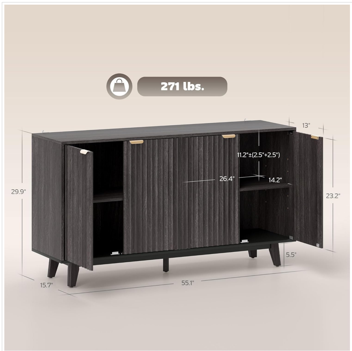
Image 4.1: Visual representation of the cabinet's dimensions and overall weight capacity.