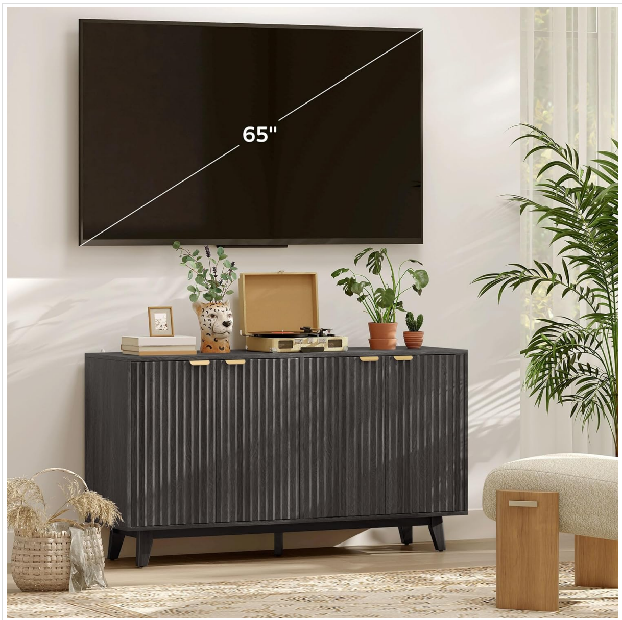
Image 5.2: The cabinet functioning as a media console, supporting a television up to 65 inches.