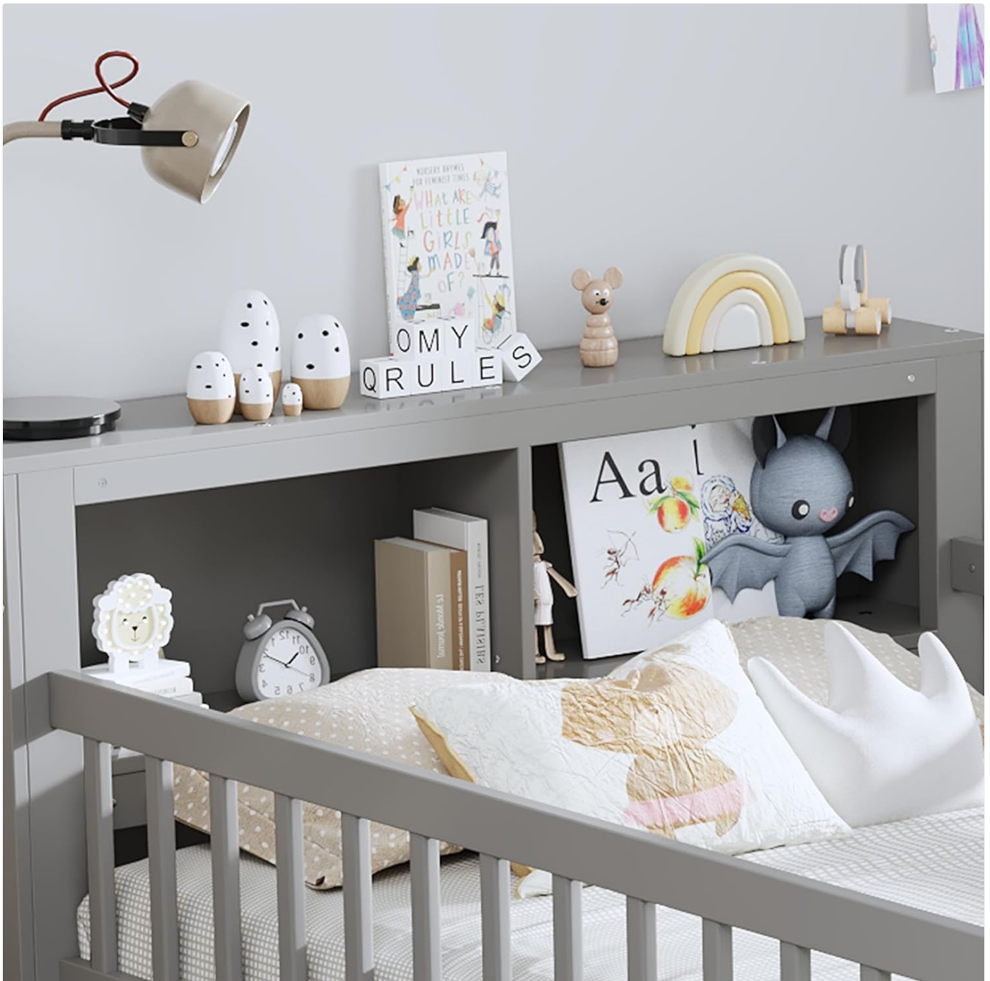
Image: A detailed view of the bed's headboard, showing the two open storage shelves filled with books and small decorative items, demonstrating their practical use.

The integrated headboard features two open compartments for convenient storage. These can be used to store books, small decorative items, or other essentials, keeping them easily accessible from the bed.