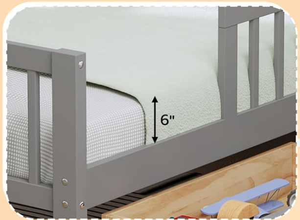
Recommended Mattress Thickness: \leq 6''

Image: A close-up view of the bed frame's side guardrail, showing the vertical slats and the smooth finish. This highlights the safety feature for children.