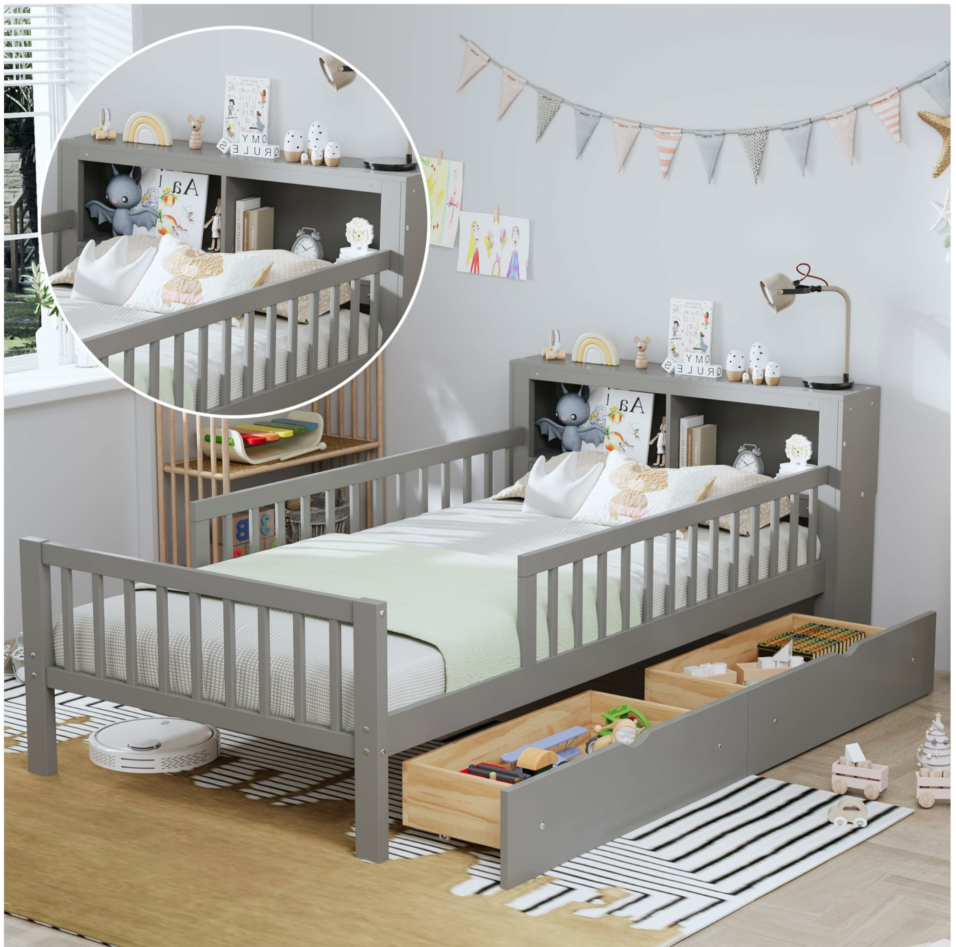
Image: The Bellemave Kids Twin Bed Frame in grey, featuring a headboard with open storage compartments and two pull-out drawers beneath the bed. The bed also has slatted guardrails on three sides.