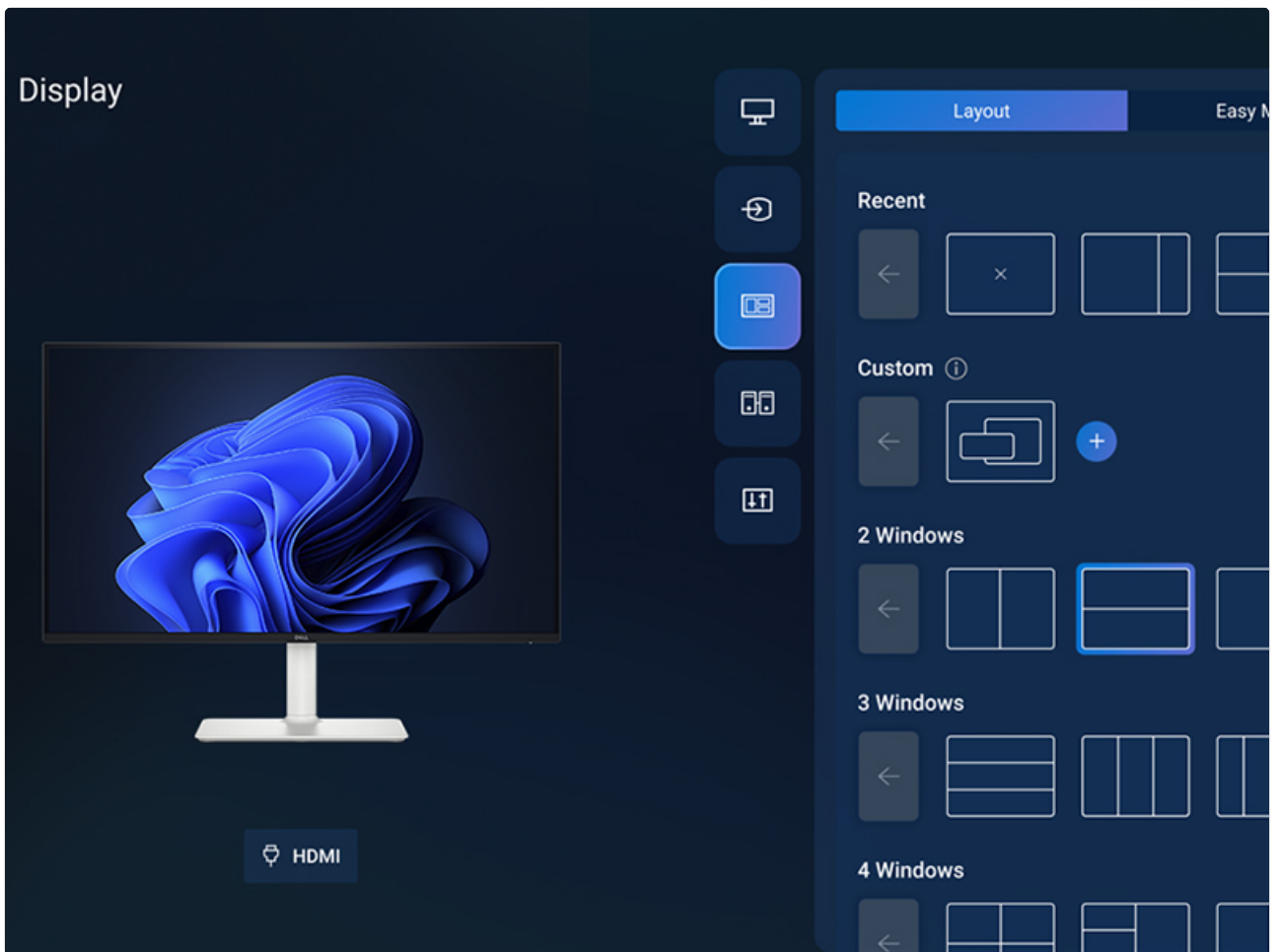
Image: Screenshot of the Dell Display and Peripheral Manager software, showing layout options for window management and display settings.

For advanced control and customization, Dell recommends installing the Dell Display and Peripheral Manager software on your connected PC.