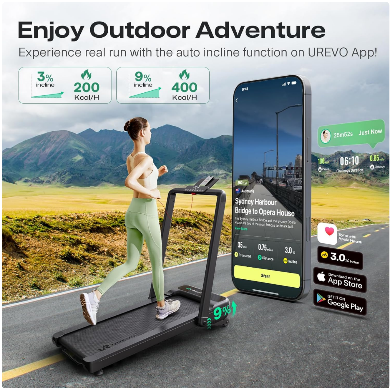
Figure 5: The UREVO App provides real-time workout data, scenic routes, and interactive challenges.

Your browser does not support the video tag.