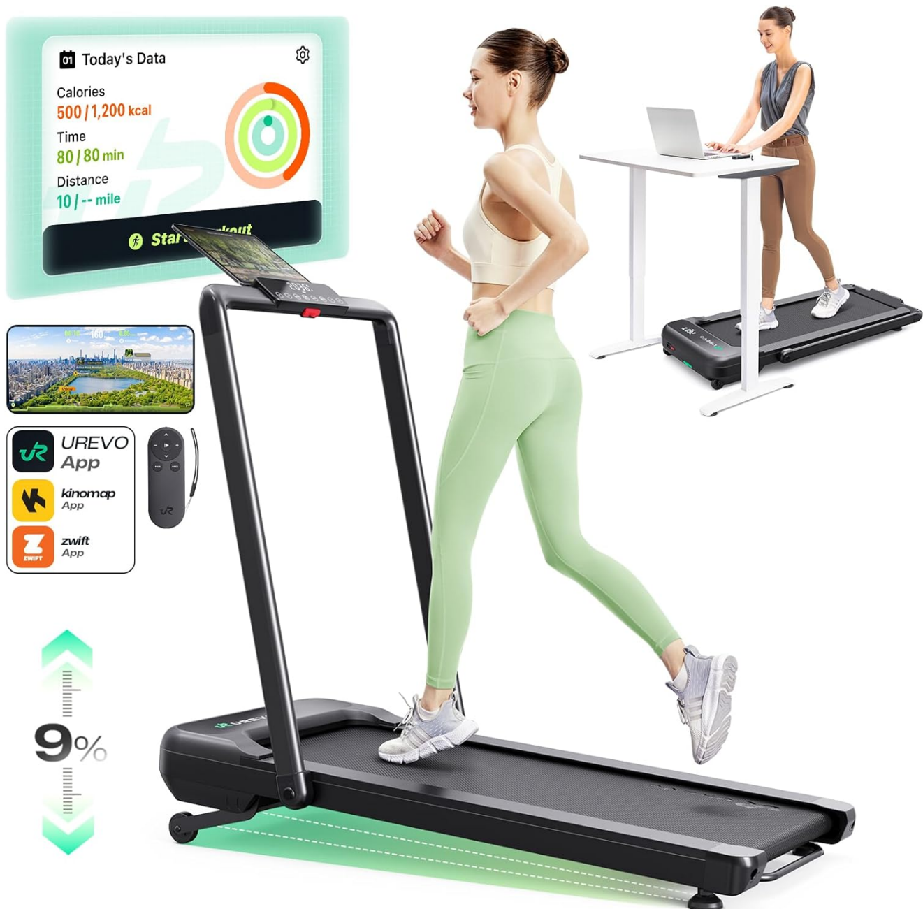
Figure 1: UREVO Smart Treadmill in a home setting, showcasing its compact design and integrated app features.