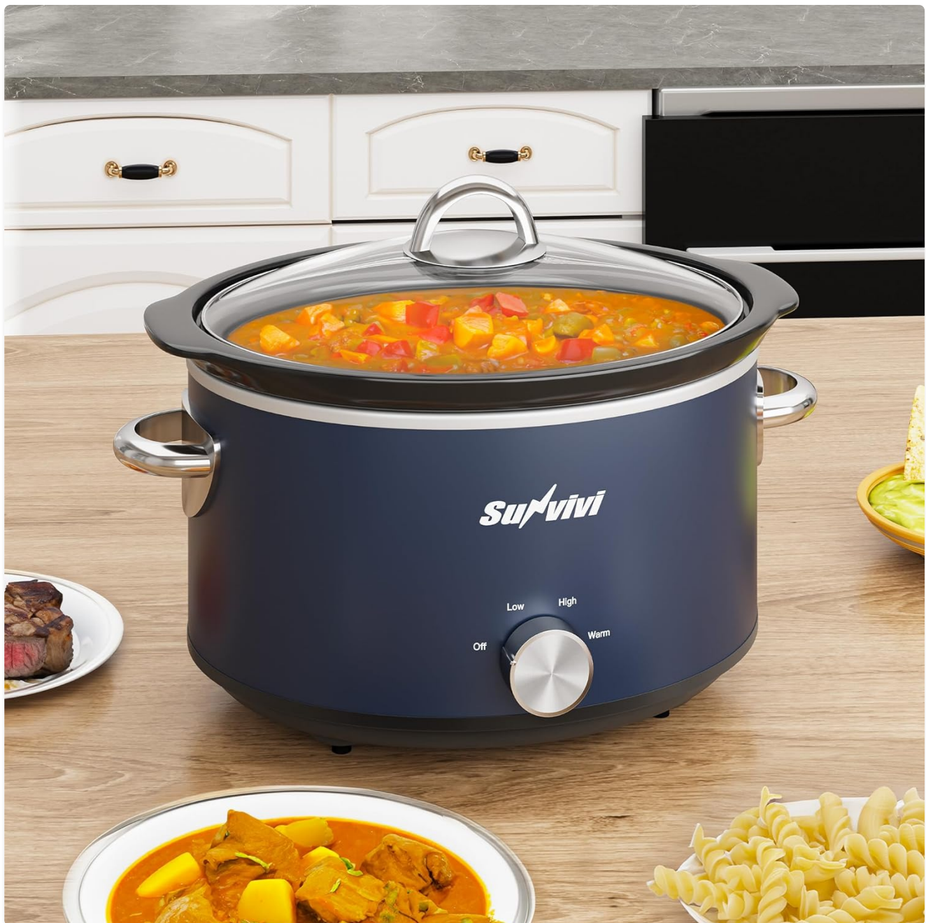
Image: The Sunvivi 4 Quart Slow Cooker, blue exterior, with a clear glass lid, containing a cooked meal. It is positioned on a wooden kitchen counter.