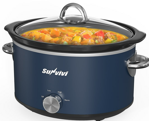
Image: A visual representation of the control knob with 'Off', 'Low', 'High', and 'Warm' settings, indicating the three heating modes.