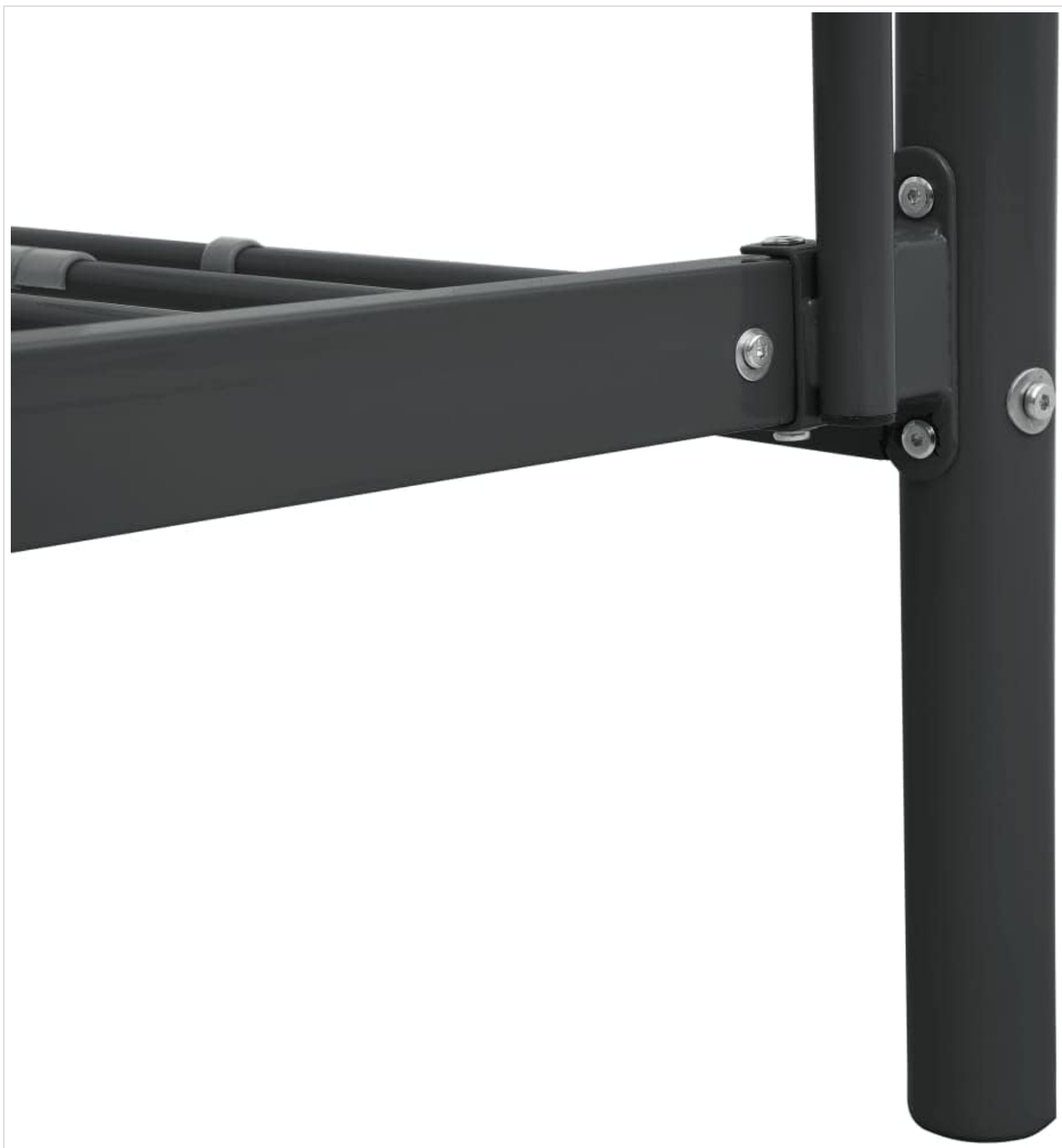
Image: Detail of a leg and frame connection, highlighting a securely fastened bolt for structural integrity.