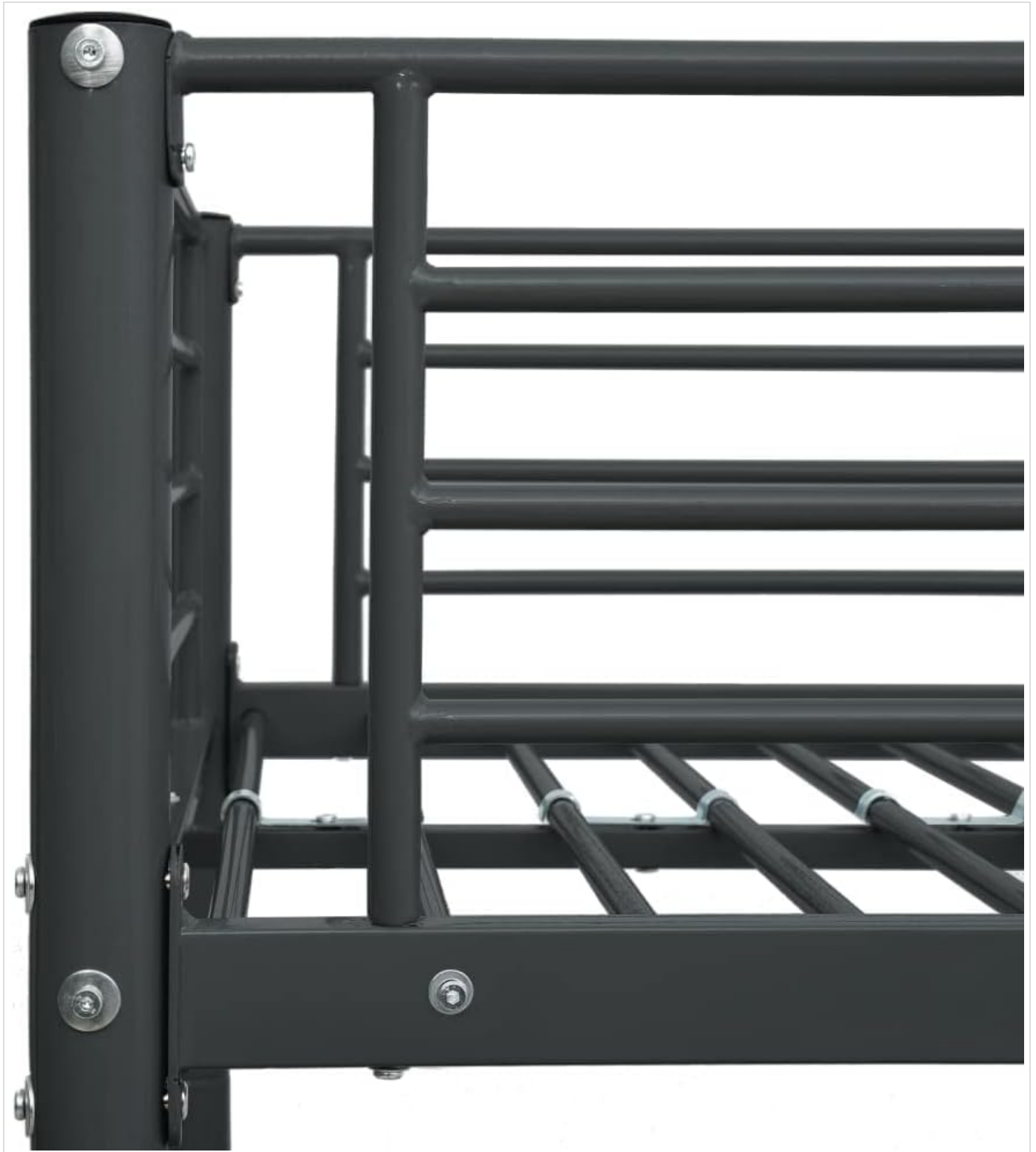
Image: Detail of the upper bunk frame connection, illustrating how the metal rails are secured with bolts.