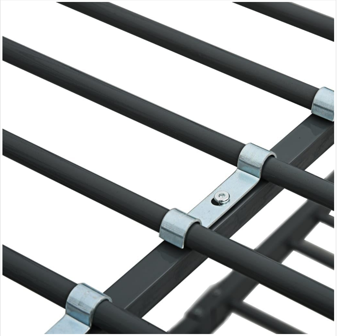
Image: Close-up view of the metal bed slats, showing the clips that secure them to the bed frame for mattress support.

slat is properly seated and fastened according to the instructions.