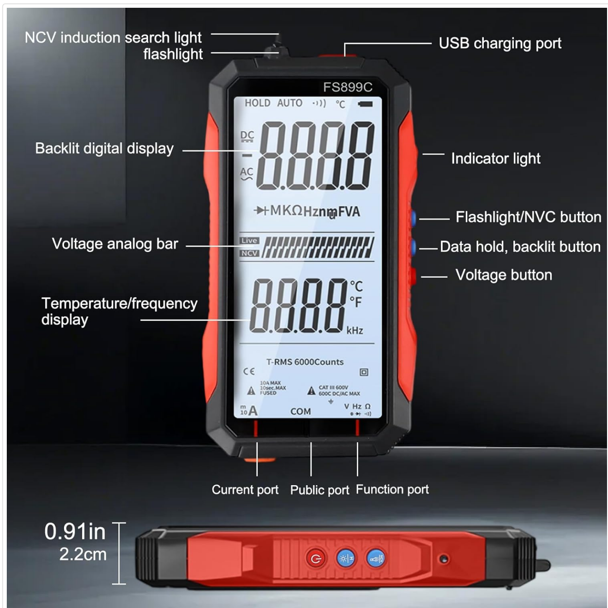
Image 3.2: A detailed diagram labeling the key components of the FS899C multimeter, including the backlit digital display, NCV induction search light, USB charging port, indicator light, flashlight/NCV button, data hold/backlight button, voltage button, current port, public port, and function port.