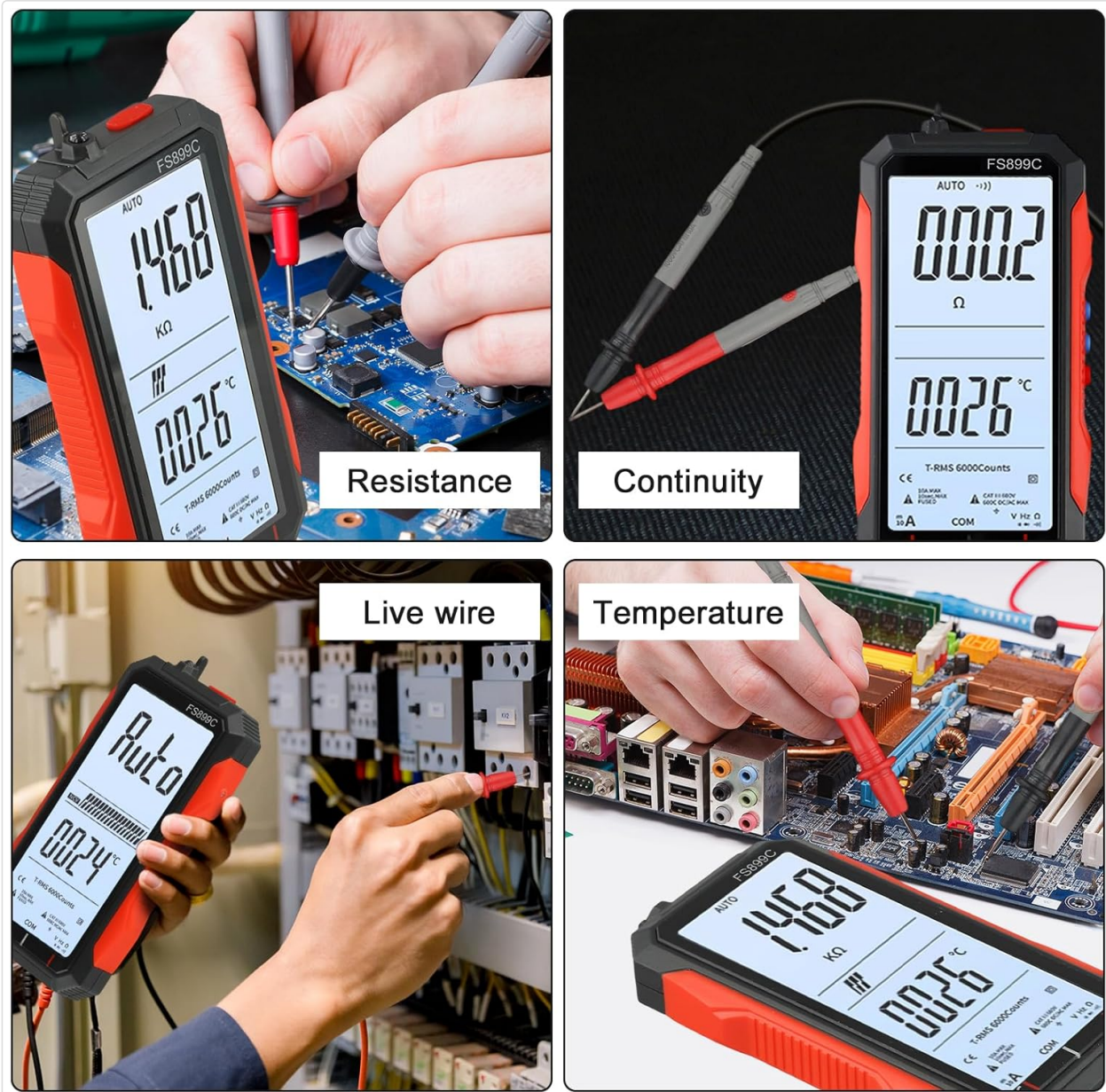
Image 5.3: A collage showing the multimeter in action for various measurements: Resistance (top left), Continuity (top right), Live Wire detection (bottom left), and Temperature measurement (bottom right).