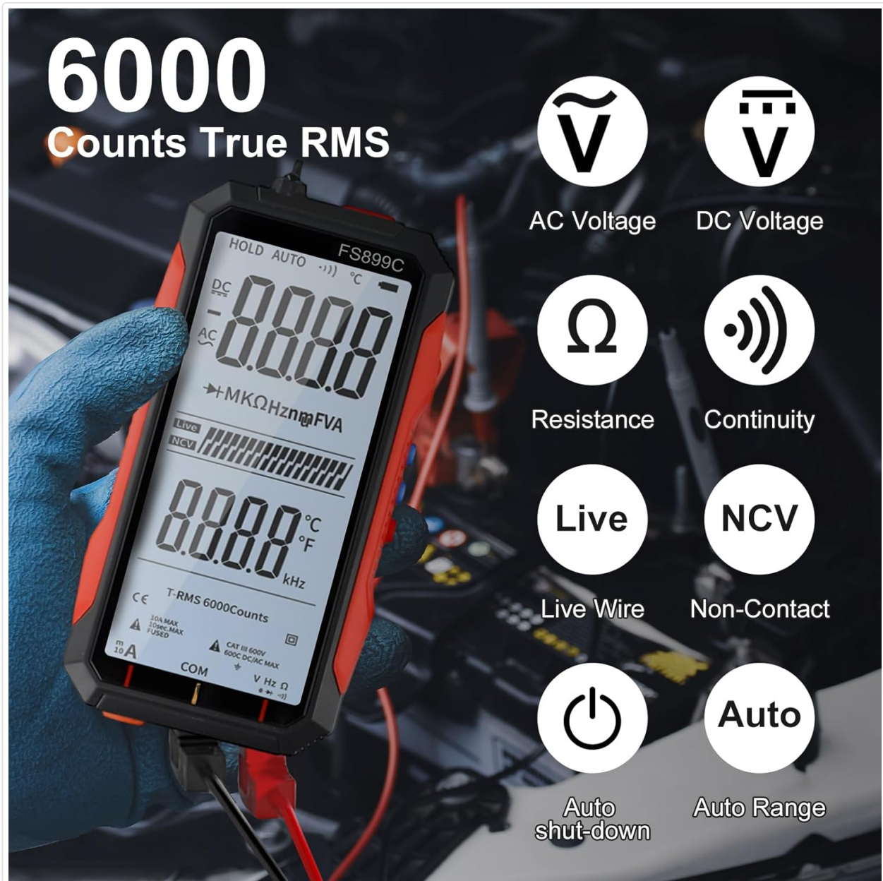
Image 5.1: The multimeter display highlighting its 6000 Counts True RMS capability and icons representing various functions like AC Voltage, DC Voltage, Resistance, Continuity, Live Wire, Non-Contact Voltage (NCV), Auto Shut-down, and Auto Range.

The FS899C automatically selects the appropriate measurement range (Auto Range) for most functions. Use the function button to cycle through different measurement types if needed.