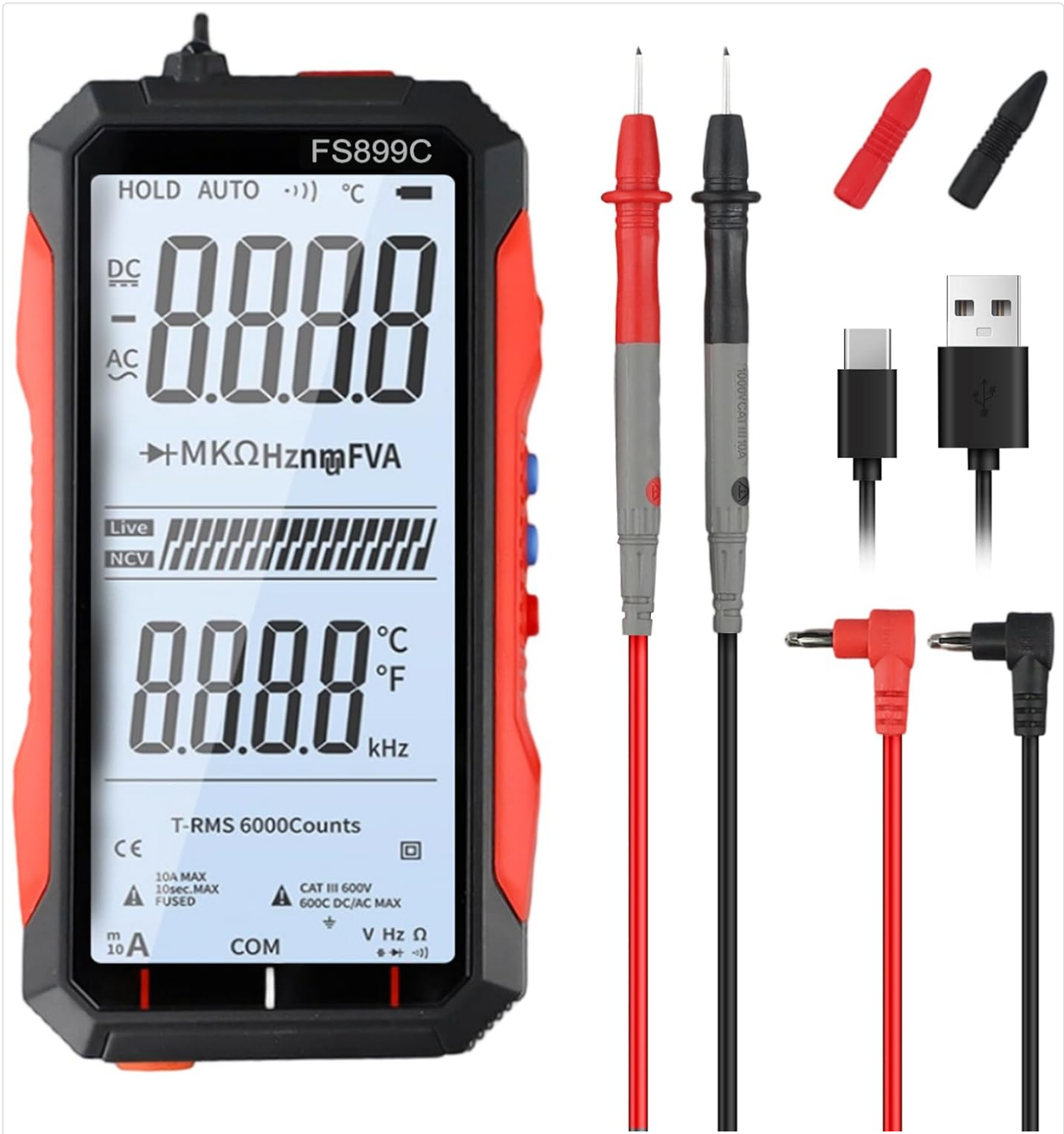
Image 3.1: The Cloudpower FS899C Digital Multimeter shown with its included test leads, USB-C charging cable, and temperature probe.

The Cloudpower FS899C Digital Multimeter comes with essential accessories for various measurements.