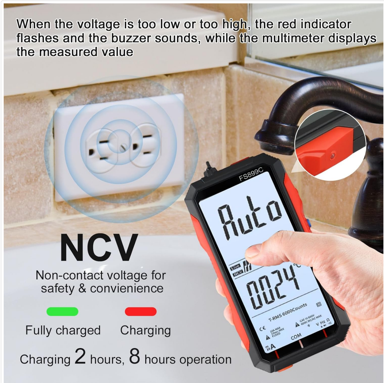
Image 4.1: The multimeter display indicating charging status (red for charging, green for fully charged) and demonstrating the NCV function.