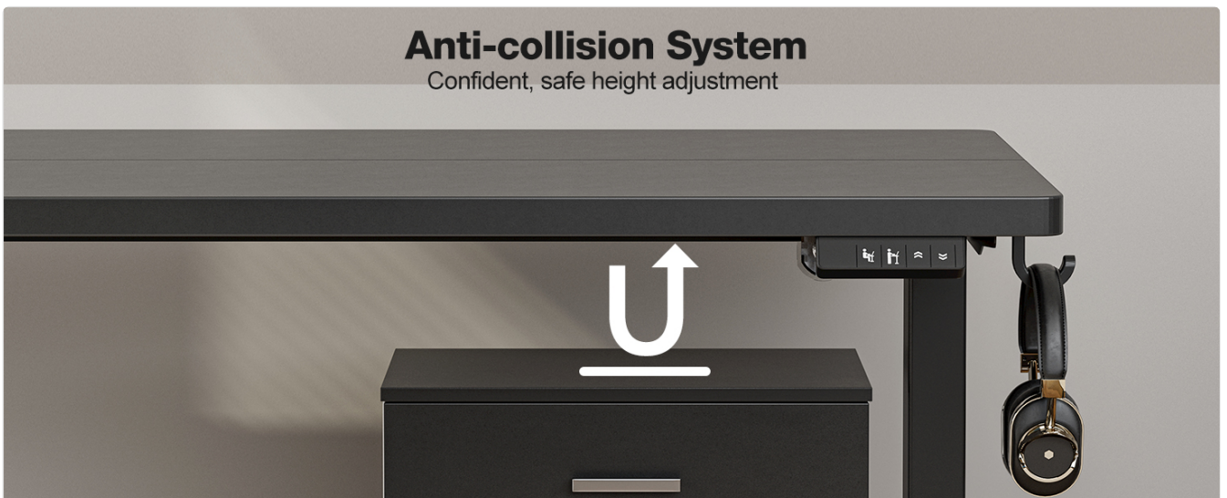
Figure 5.2: The anti-collision system ensures safe height adjustments.