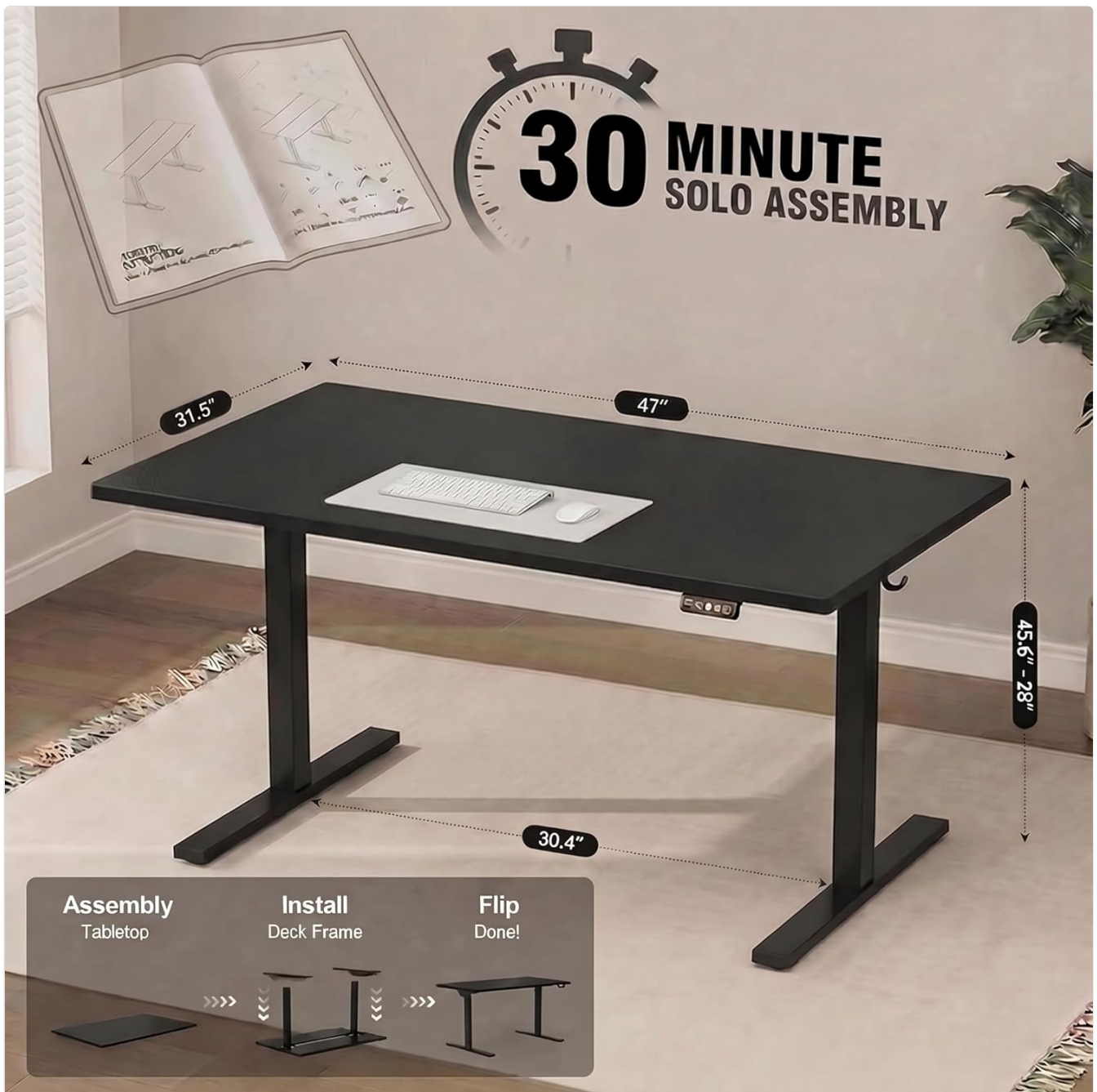
Figure 4.1: Visual overview of the desk assembly process.

Your browser does not support the video tag.