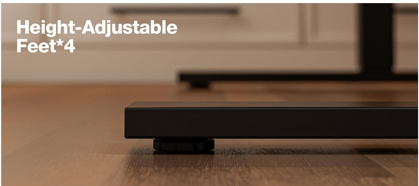
Figure 5.3: Desk hooks and height-adjustable feet for convenience.