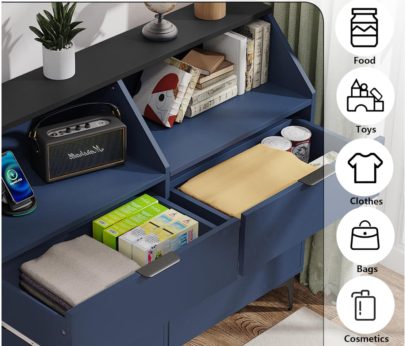
Image: Overview of the dresser's large storage capacity.

You can efficiently store your clothes, toys, ornaments and other items with 6 large drawers