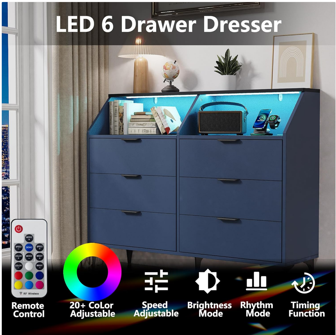
Image: The dresser with its LED lights active, alongside the remote control for adjusting settings.