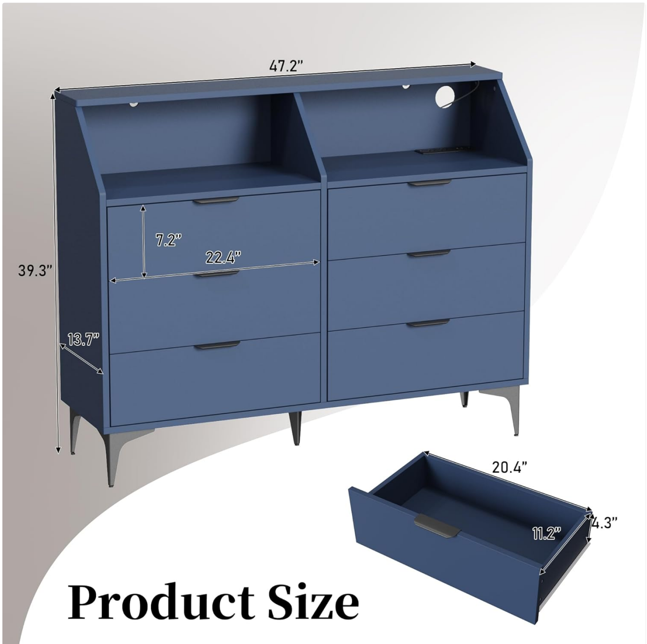
Image: Front view of the LOUVIXA 6-Drawer Dresser.