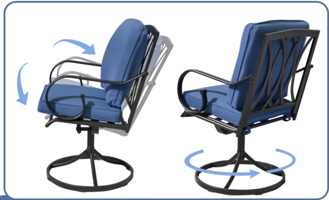
Image: Rocking and 360-degree swivel functionality.

Full-rotation chairs allow you to face or leave the sun easily. The rocking motion allows you to enjoy ultimate relaxation.