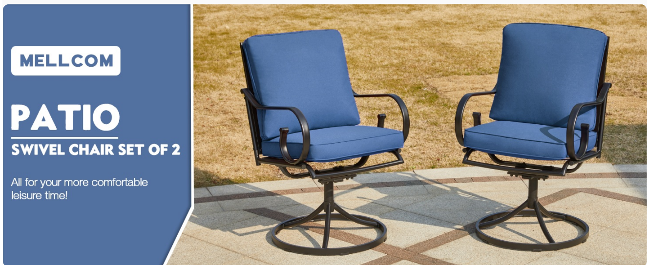
Image: MELLCOM Patio Swivel Rocker Dining Chairs, Set of 2.

Thank you for choosing the MELLCOM Patio Swivel Rocker Dining Chairs. This manual provides essential information for the safe assembly, operation, and maintenance of your new outdoor chairs. Please read these instructions carefully before assembly and retain them for future reference.