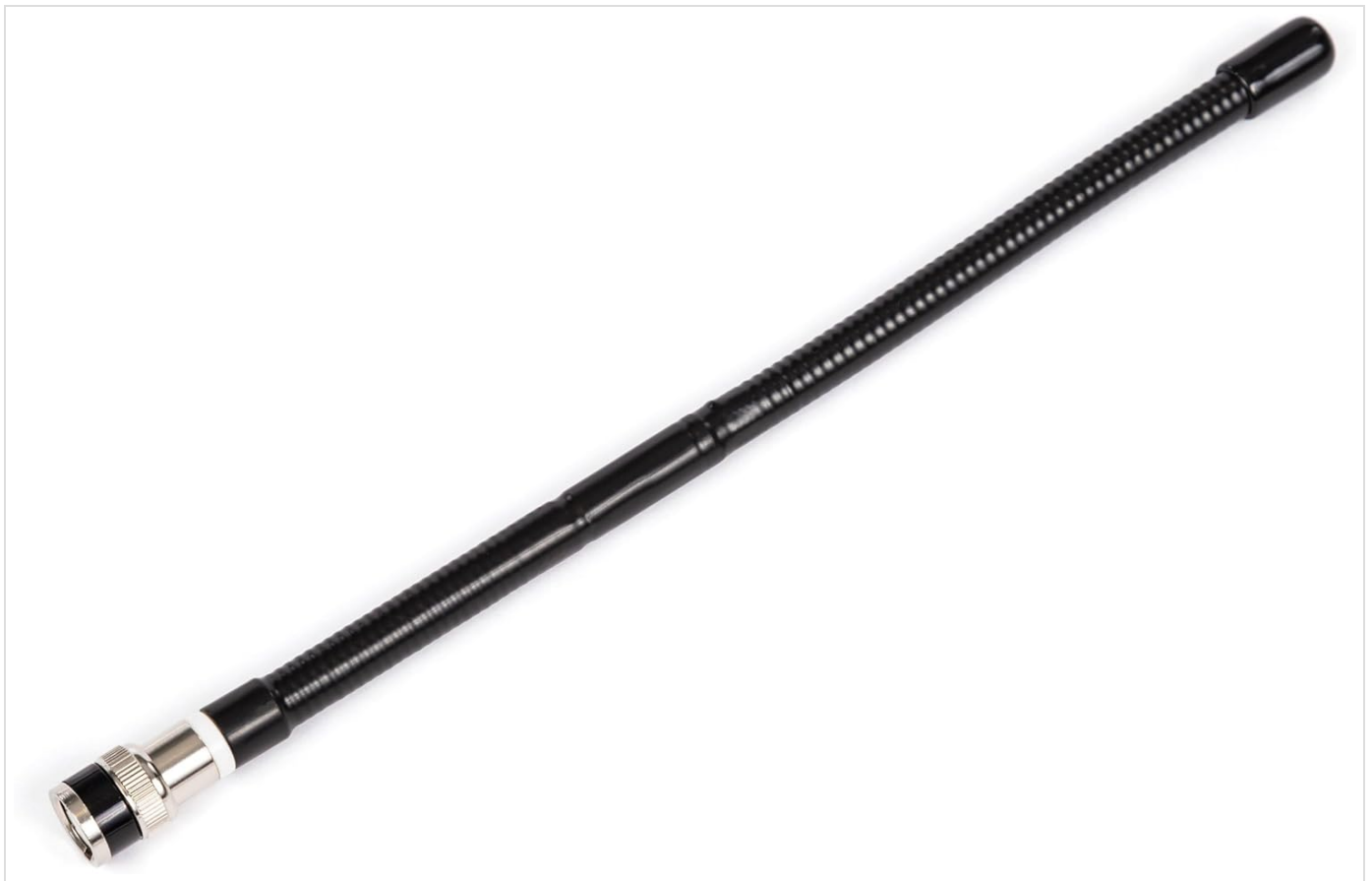
Figure 1: Full view of the Jopix CB-80 Antenna, showing its flexible shaft and BNC connector.