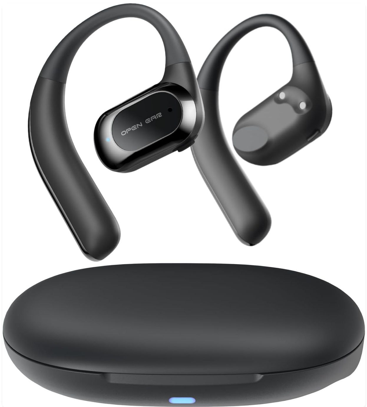
Image: JOYWISE G1 True Bone Conduction Headphones and their charging case.