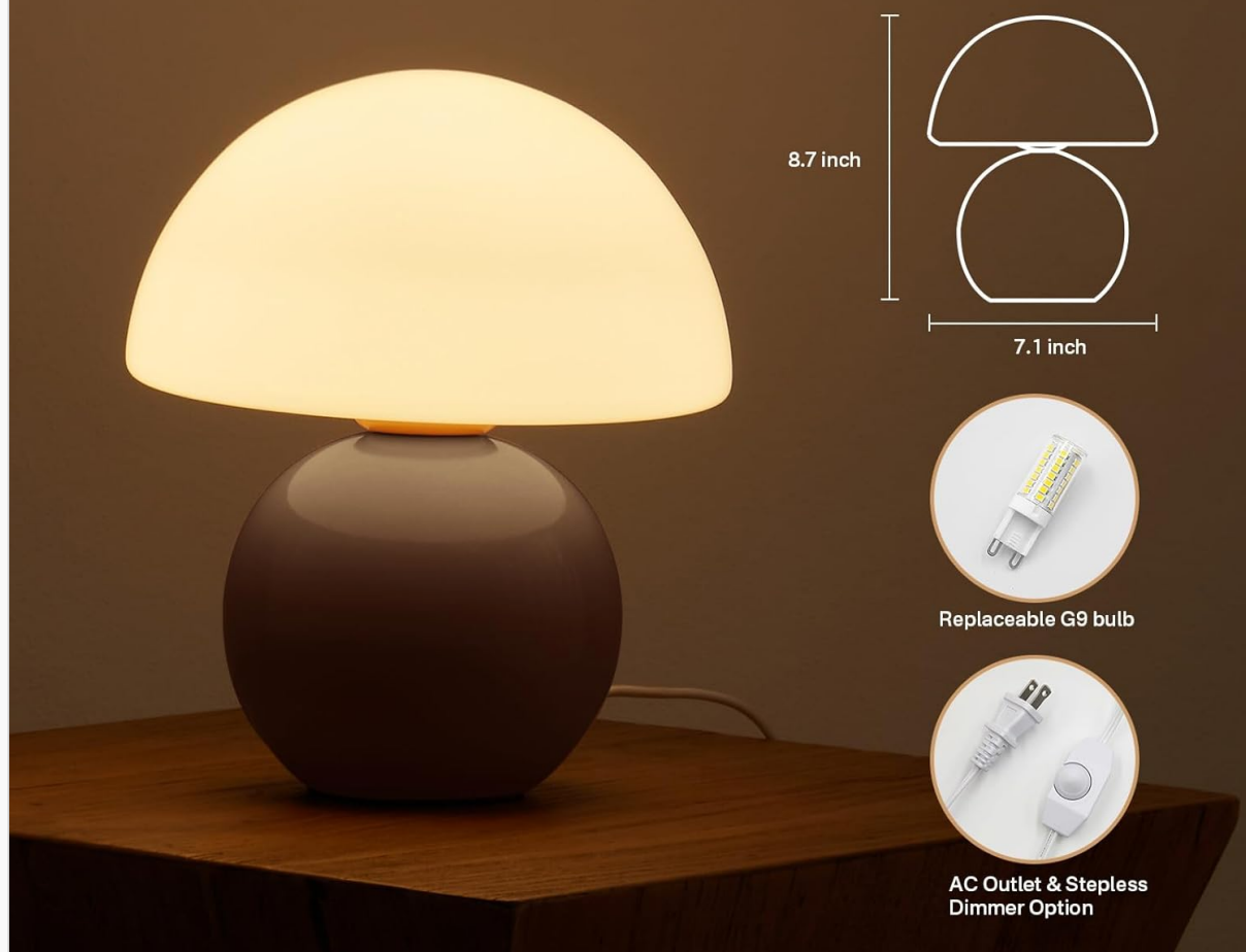
Image: Visual guide for bulb installation and lamp assembly, highlighting the G9 bulb and dimmer switch.