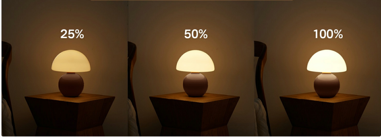
Image: The lamp displaying 25%, 50%, and 100% brightness levels, illustrating the stepless dimming capability.

Customize Your Glow, Customize Your Comfort.