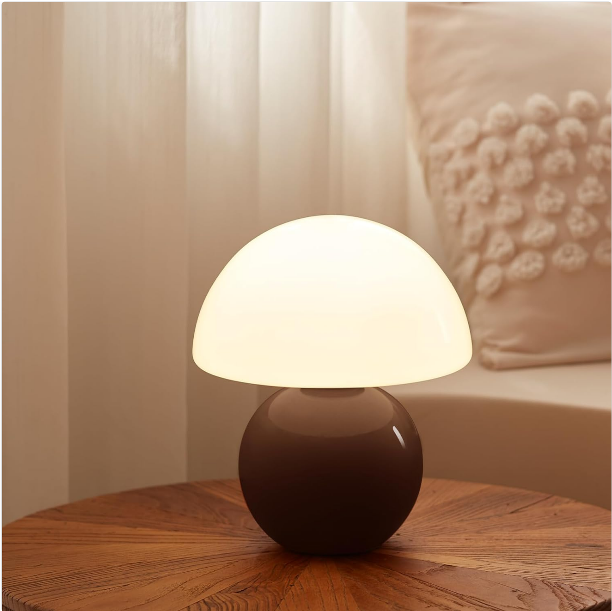
Image: The Dawnwake Mushroom Table Lamp in Coffee color, providing a warm glow on a wooden surface.