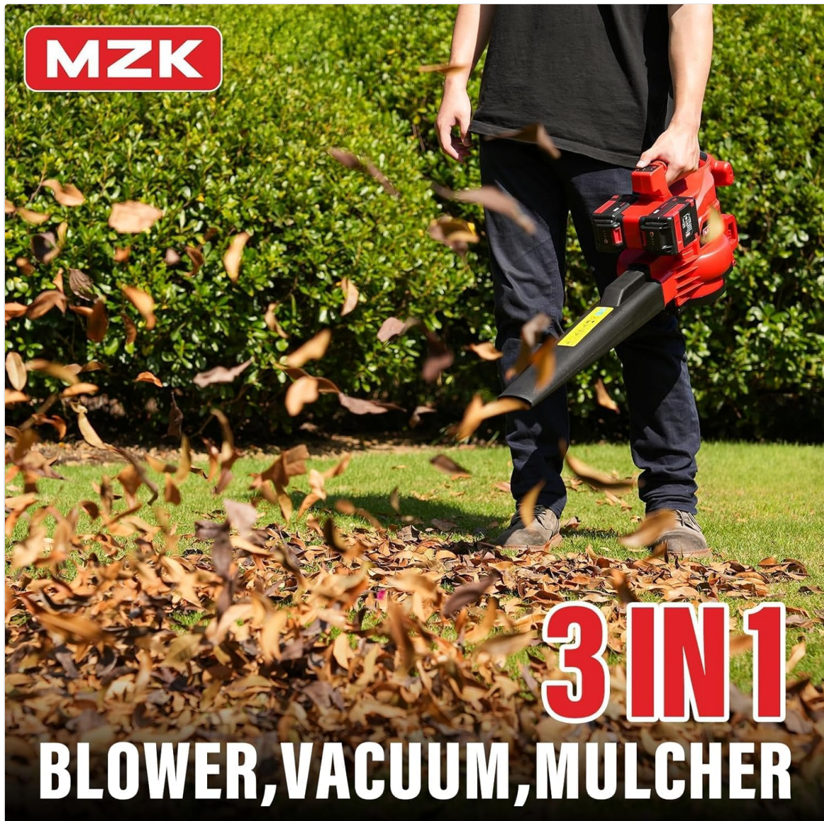
Figure 1: Operating the MZK 3-in-1 tool in blower mode.