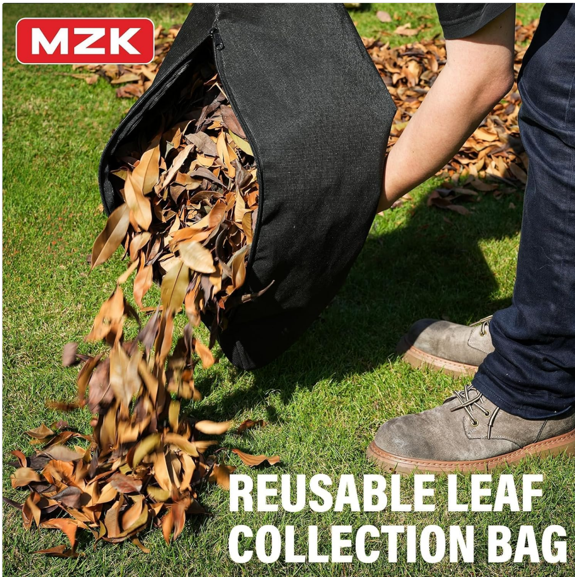
Figure 5: The 35L collection bag efficiently gathers mulched debris.