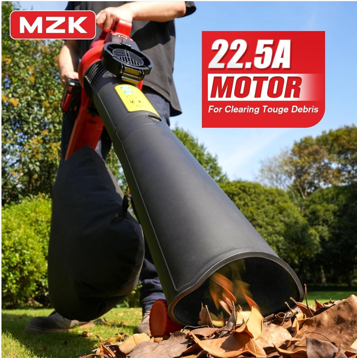
Figure 2: Operating the MZK 3-in-1 tool in vacuum mode.