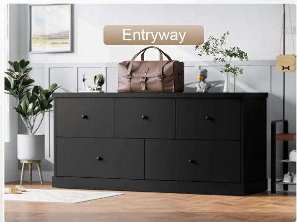
Image: The JUMMICO dresser shown in different home environments, including a living room, bedroom, and entryway, demonstrating its versatility.