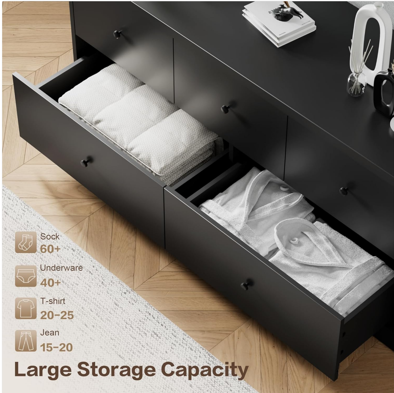
Image: Open drawers of the JUMMICO dresser, illustrating its large storage capacity for items like socks, underwear, t-shirts, and jeans.