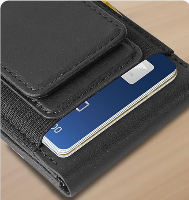
Elastic Band Design