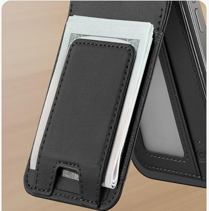
Magnetic Money Clip