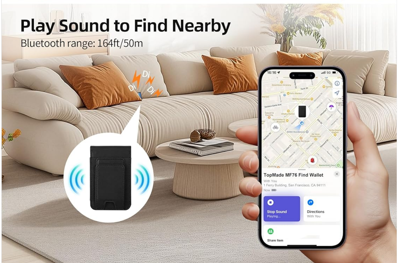
Illustrating the 'Left-Behind Notification' and 'Play Sound' features of the Apple Find My app for the wallet.