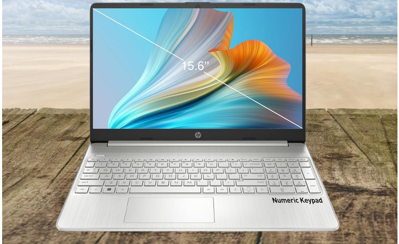
Figure 1.2: Laptop screen showing the Windows 11 Pro interface.