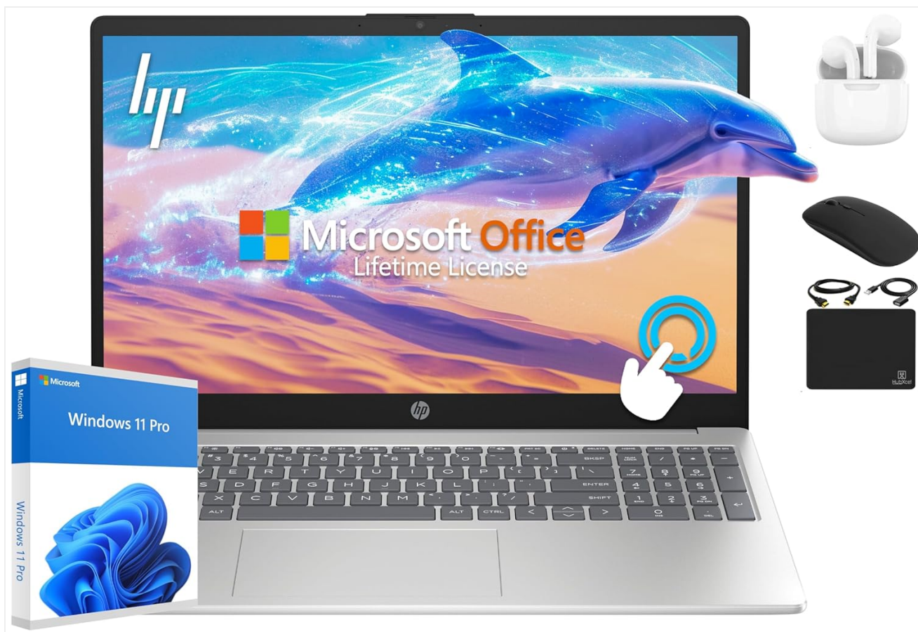
Figure 1.1: HP Laptop and HubxcelAccessory bundle (wireless earbuds, mouse, cables, external drive).