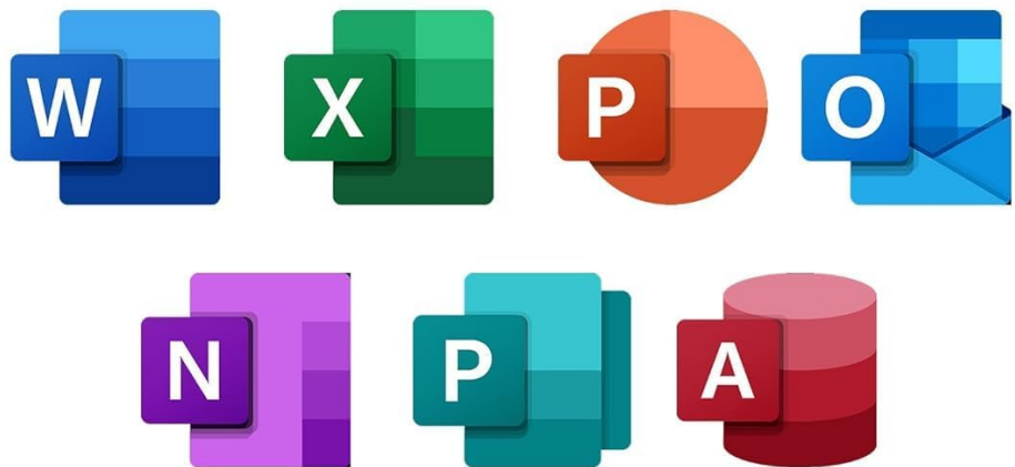
Figure 1.4: HubxcelAccessory 6-in-1 Value Pack.