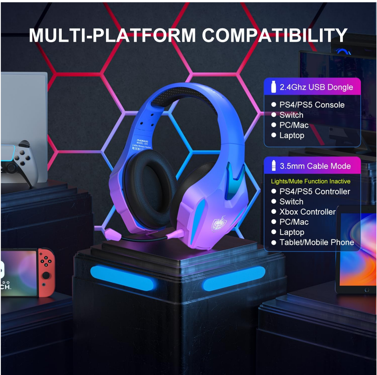
Image 4.1: Multi-platform compatibility overview for PHOINIKAS headsets.