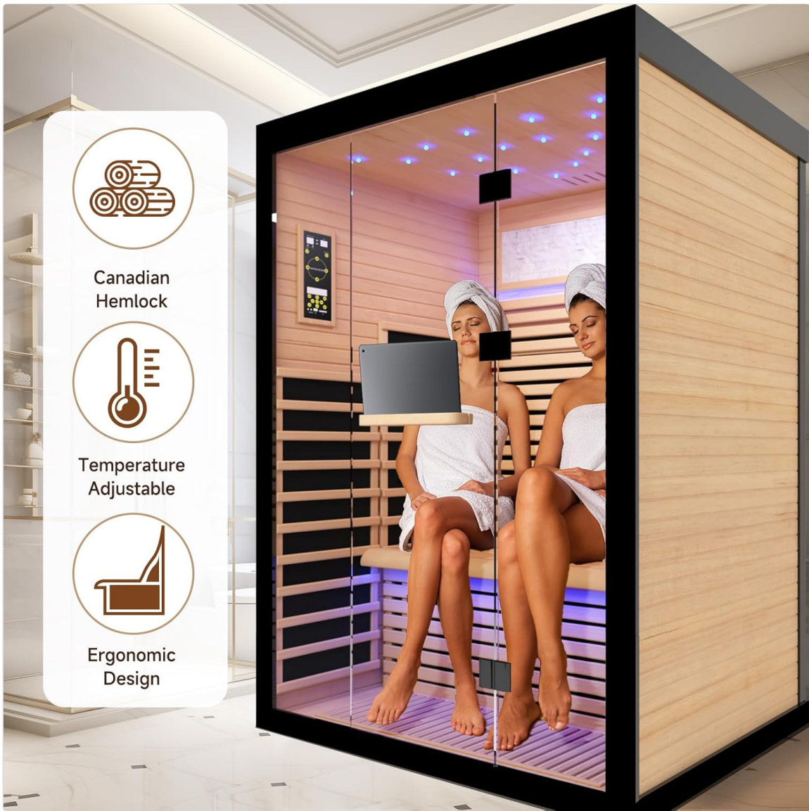
Image: Key features of the OUTEXER Infrared Sauna, including Canadian Hemlock construction, adjustable temperature, and ergonomic design.