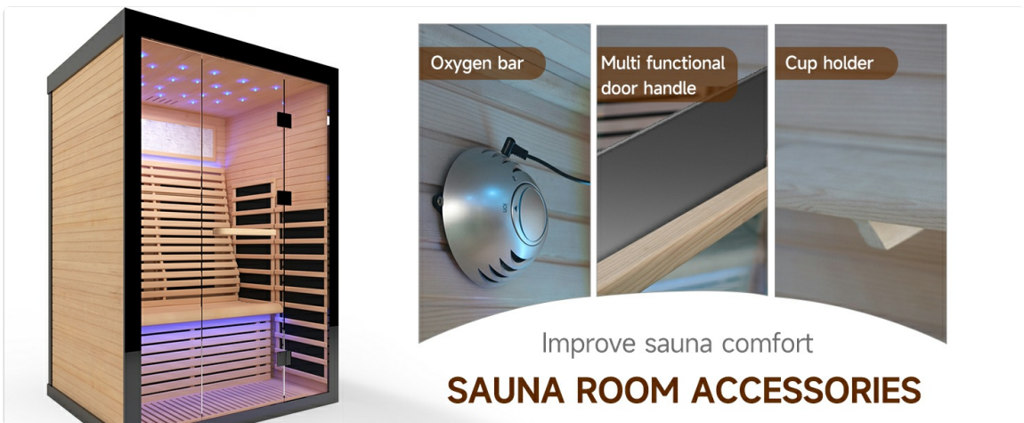
Image: Accessories such as the oxygen bar, multi-functional door handle, and cup holder, designed to improve sauna comfort.