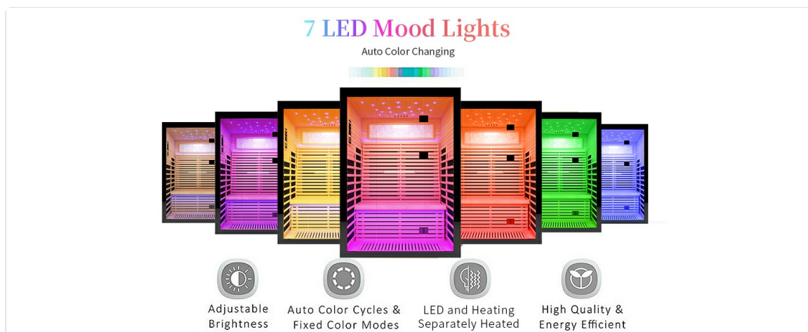
Image: The sauna interior illuminated with seven different LED mood light colors, demonstrating the color therapy feature.