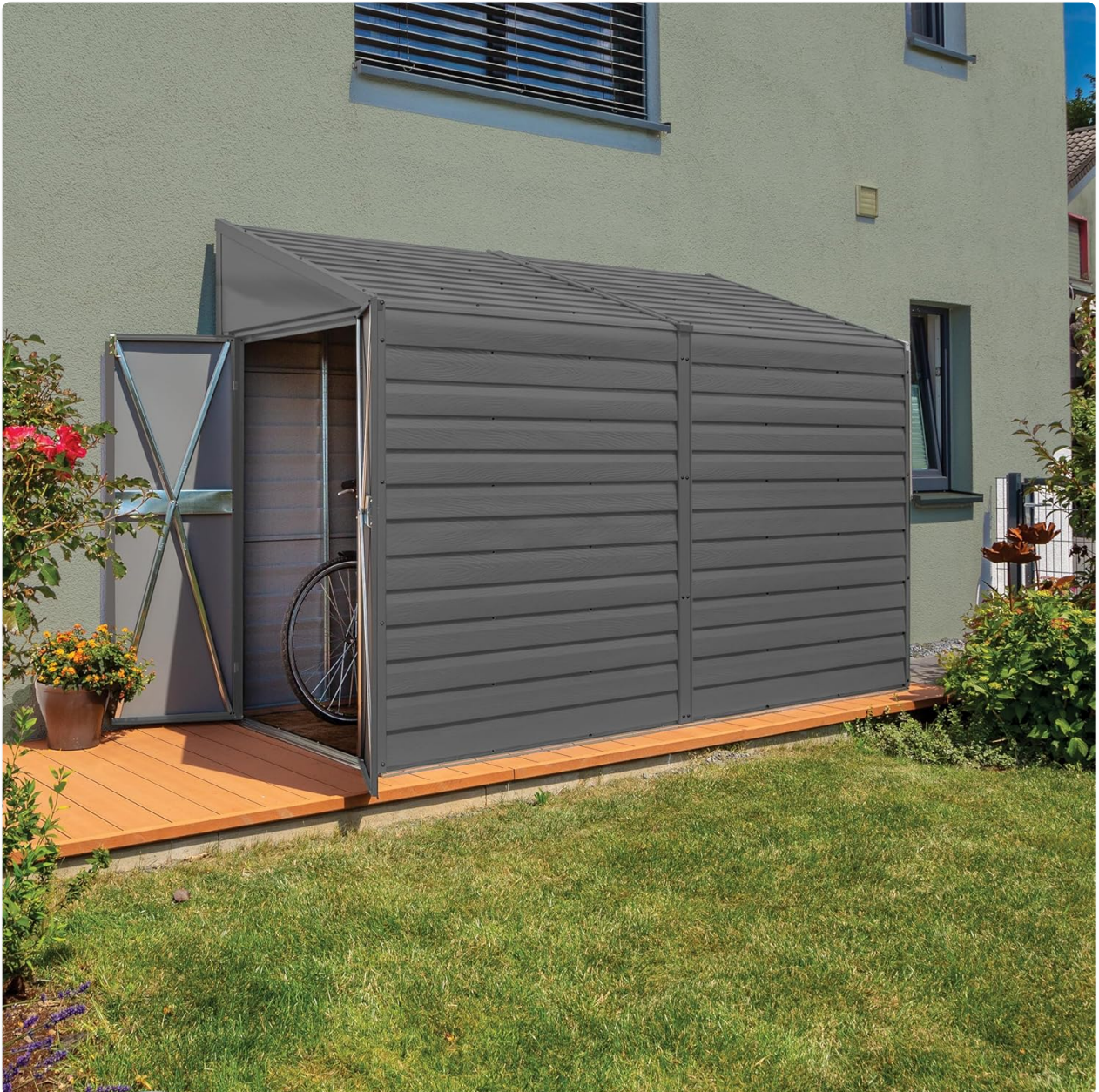
Image: Detailed view of the shed's horizontal siding, showing its texture and finish.