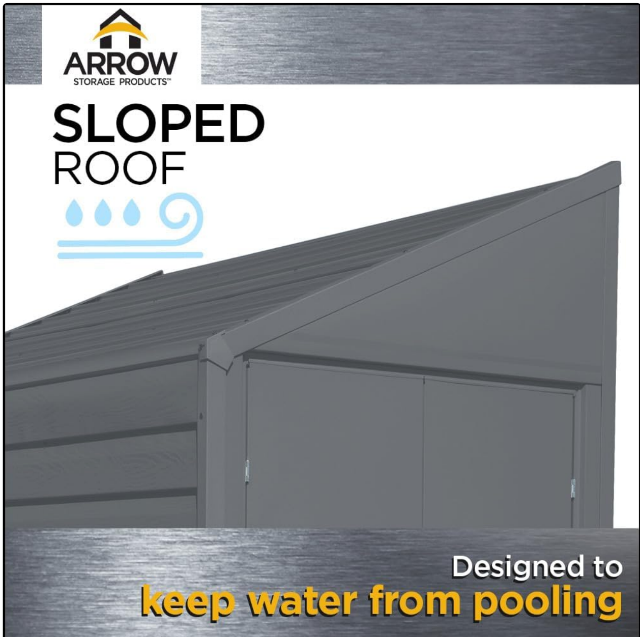
Image: Detail of the shed's sloped roof, engineered to shed water effectively.