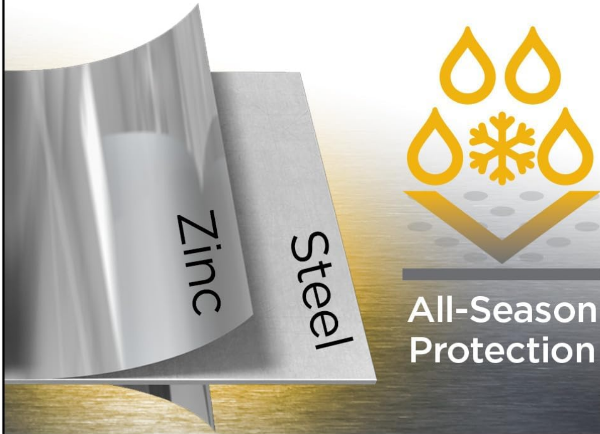
Image: A visual representation of the rust-resistant galvanized steel, indicating all-season protection.