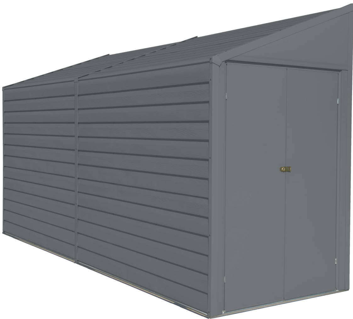
Image: The Arrow Yardsaver 4' x 10' Storage Shed, showcasing its space-saving design and interior capacity for various outdoor items.