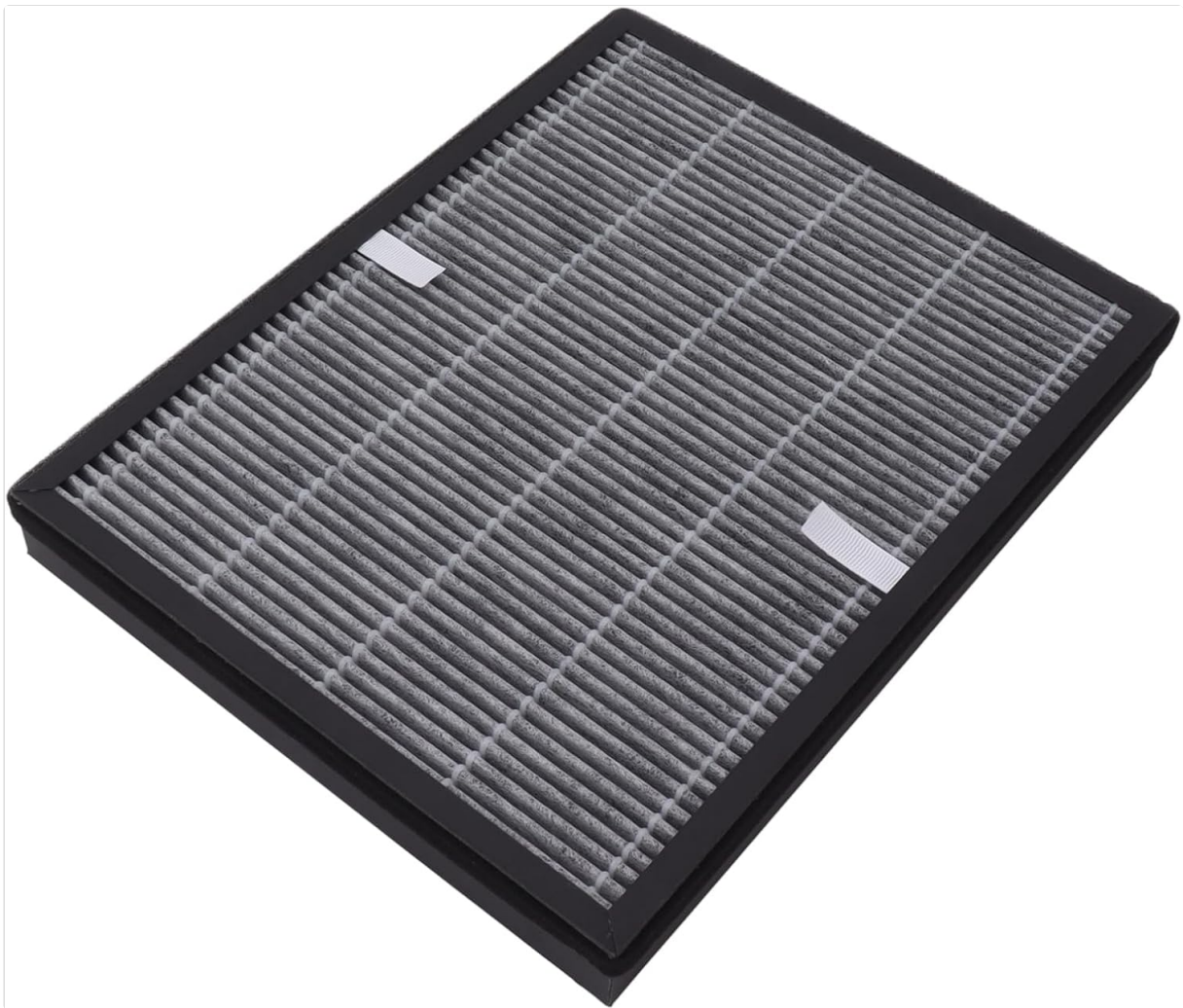
Image: Back view of the filter, revealing the grey activated carbon layer designed for odor absorption. This side typically faces inwards towards the air purifier's fan.