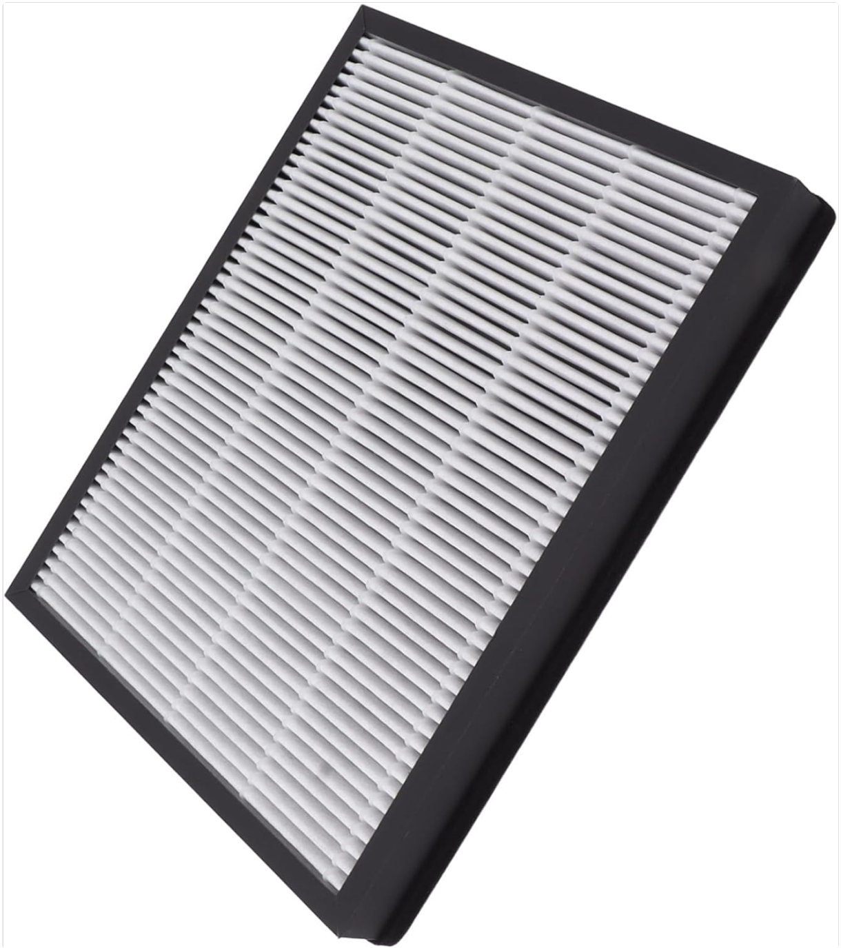
Image: Front view of the filter, showing the pleated white filtration material within a black frame. This is the side typically facing outwards in the air purifier.