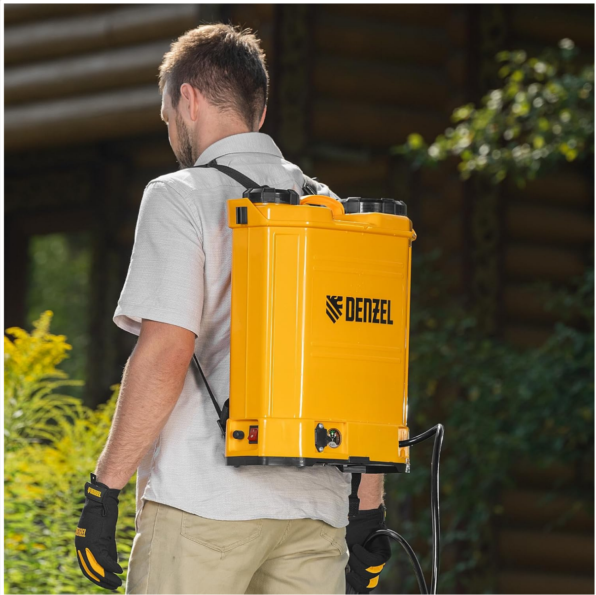
Figure 4.1: A person wearing the Denzel sprayer as a backpack, demonstrating its intended use for portability during operation.

Place the sprayer on your back using the adjustable straps, similar to a backpack. Ensure the straps are snug and comfortable to distribute the weight of the filled tank.