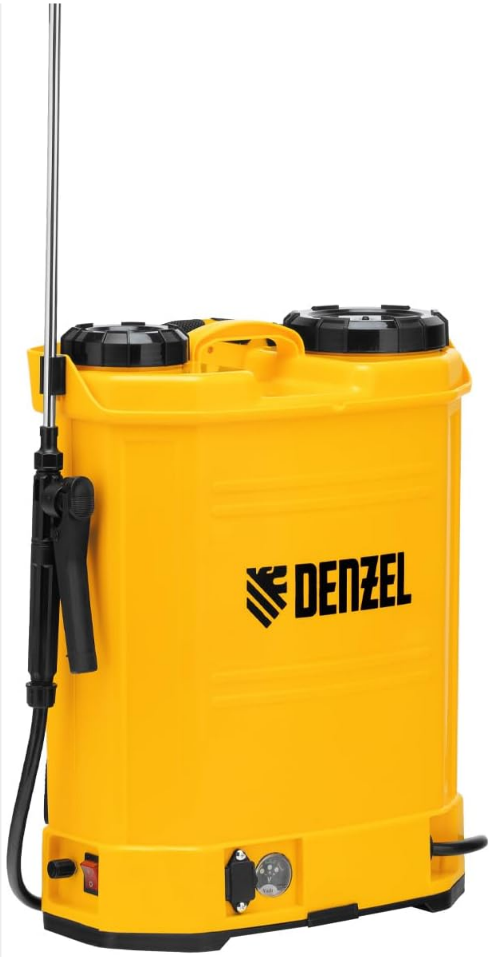
Figure 2.1: Overall view of the Denzel 16-Liter Battery-Powered Backpack Agricultural Sprayer. The sprayer features a yellow tank, a spray lance, and a control panel at the base.