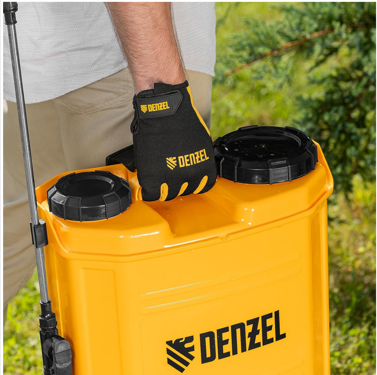
Figure 2.2: Top view of the sprayer, showing the two black caps for the tank opening and potentially a battery compartment.