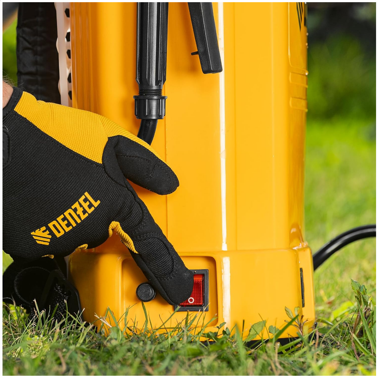
Figure 4.2: A hand operating the red on/off switch located at the base of the sprayer, indicating the power control.