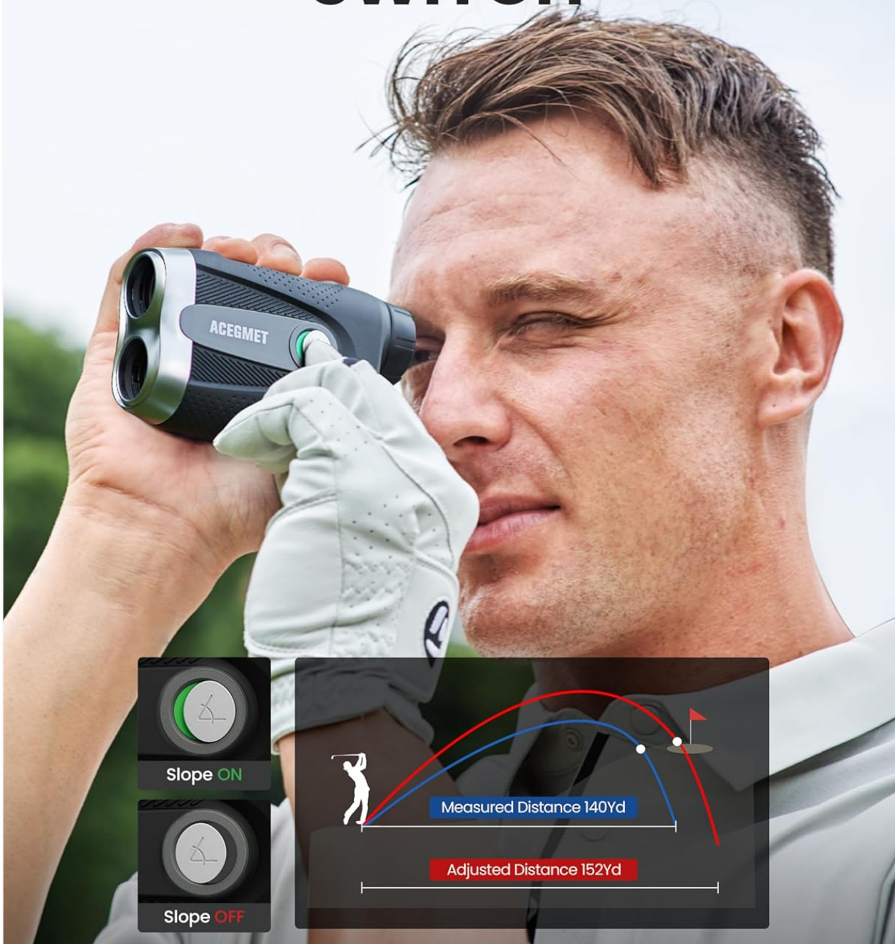
Image 4.2: Illustration of slope compensation in use, showing both measured and adjusted distances.