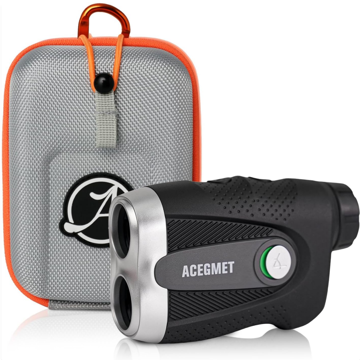
Image 1.1: The ACEGMET PF2C Golf Rangefinder with its protective carrying case.