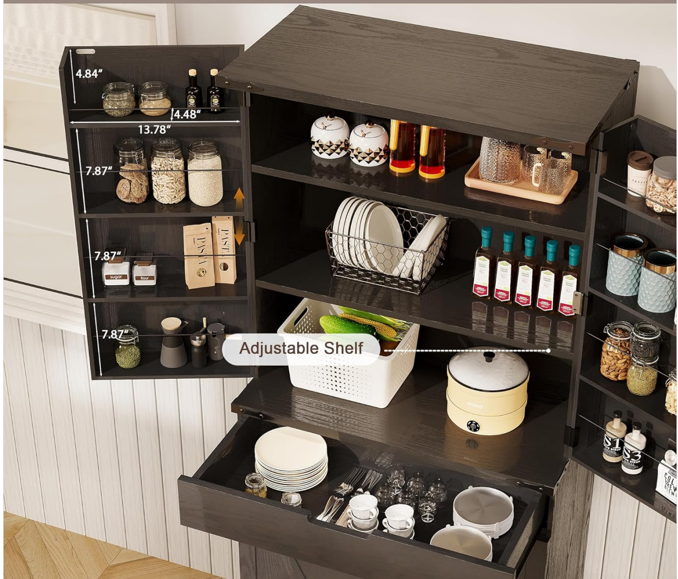
Figure 3: Interior view of the cabinet demonstrating adjustable shelves and door storage.

This image provides a clear view of the cabinet's interior when open, highlighting the adjustable shelves that allow for customized storage configurations. It also showcases the practical door shelves, perfect for organizing smaller items like spices and jars, making everything easily accessible.