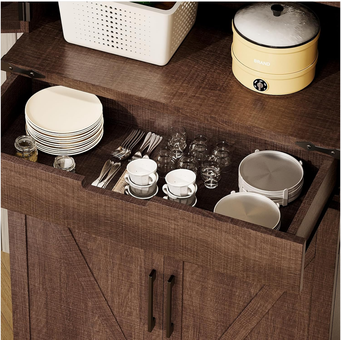
Figure 4: Close-up of the large, smooth-gliding drawer for organizing utensils and small items.

This close-up image focuses on the cabinet's spacious drawer, illustrating its capacity for organizing various kitchen items such as plates, silverware, and small cups. The smooth-gliding mechanism ensures effortless opening and closing, enhancing user convenience.