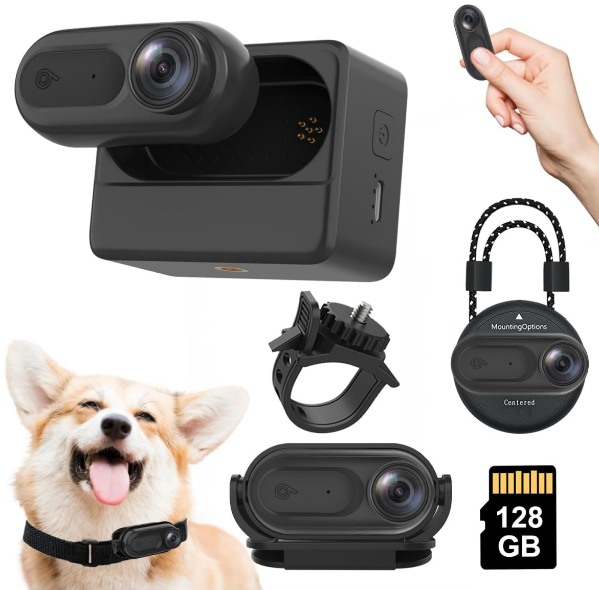
Image: All components included in the Muayb Mini Body Camera VD02 package.