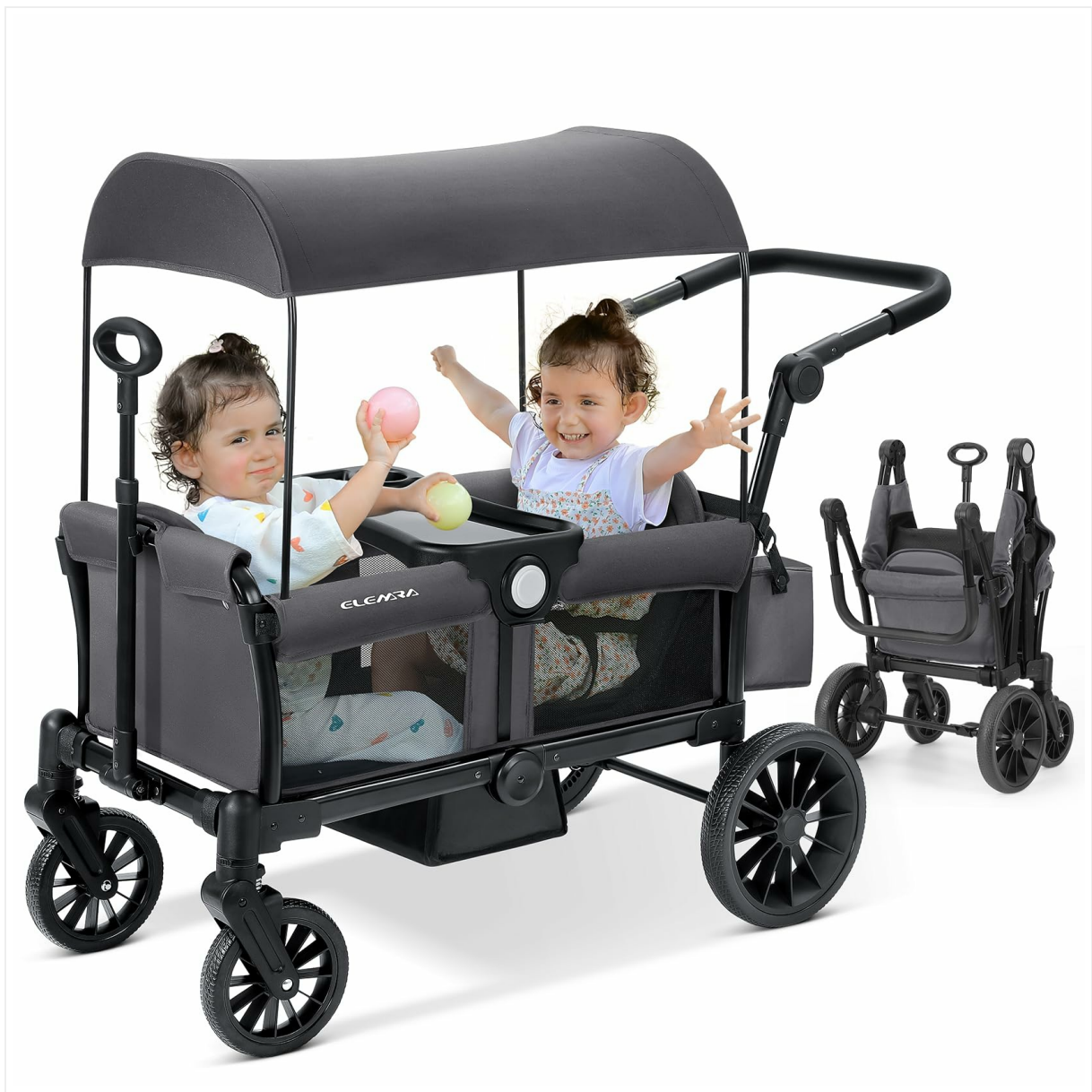
Figure 1: The ELEMARA Foldable Wagon Stroller in Gray, designed for two children.