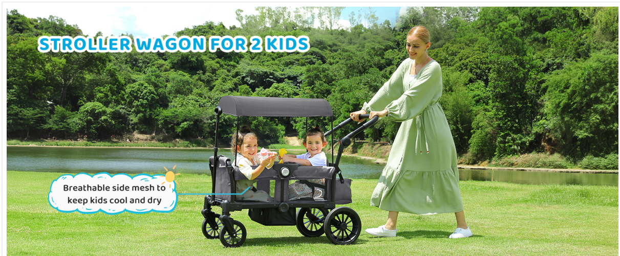
Figure 8: All-terrain wheels for diverse environments.