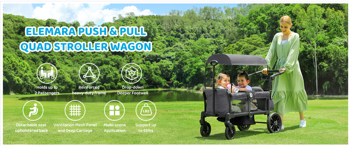
Figure 7: Convenient storage, snack tray, and breathable mesh.