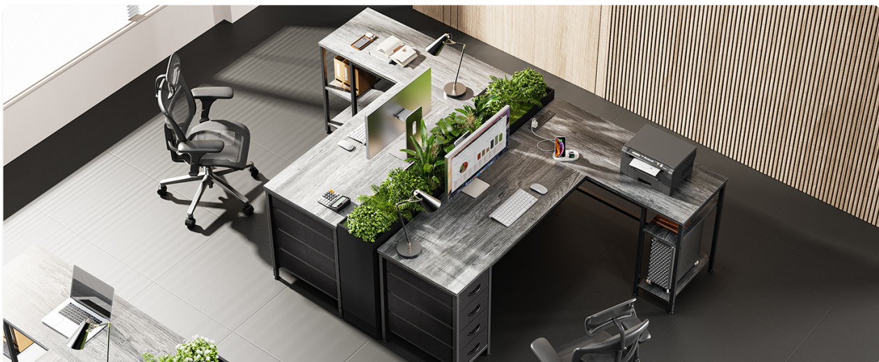
An illustration emphasizing the ample desktop and legroom for comfortable use.