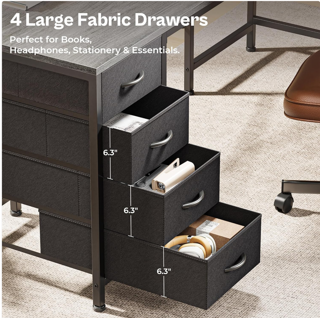
Detailed view of the four fabric drawers, illustrating their depth and storage potential.

The desk is equipped with 4 fabric drawers and 2 adjustable storage side shelves. The fabric drawers are lightweight yet durable, providing convenient storage for office supplies, books, or personal items. The adjustable shelves offer flexibility for organizing larger items like a computer tower or decorative elements.