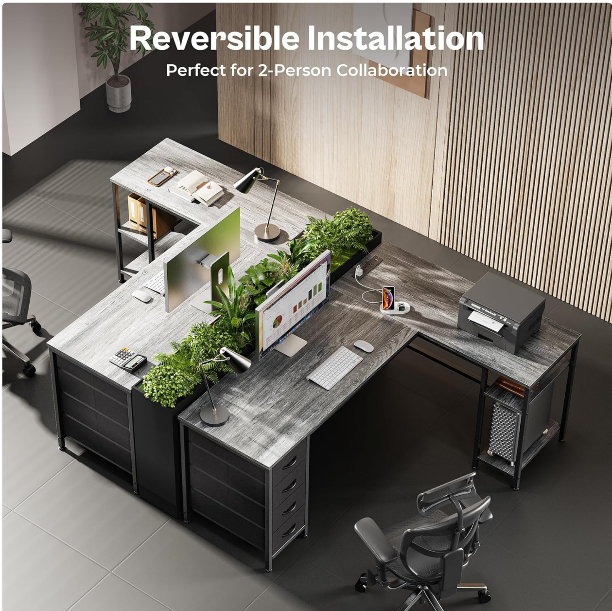
Example of reversible installation, showing two desks arranged for collaborative work.

workspace or combining multiple desks for a shared setup.