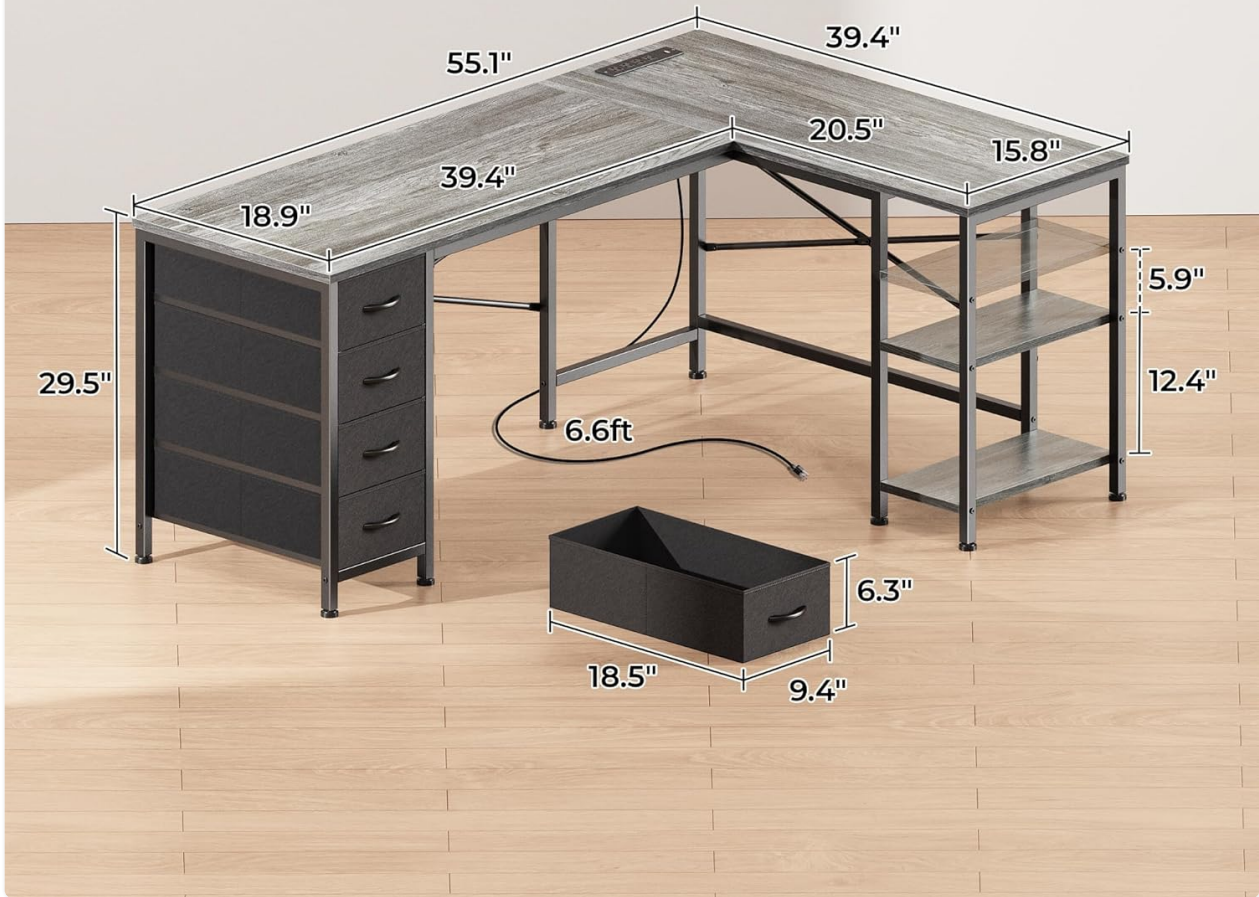
Diagram showing the dimensions and load-bearing capacity of the desk.