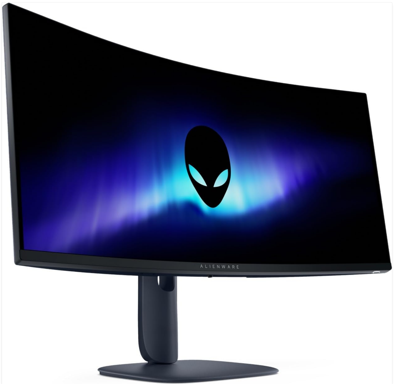
Figure 1: Alienware AW3425DWM 34-inch Curved Gaming Monitor. This image displays the front view of the curved monitor with the Alienware logo on the screen and the stand.