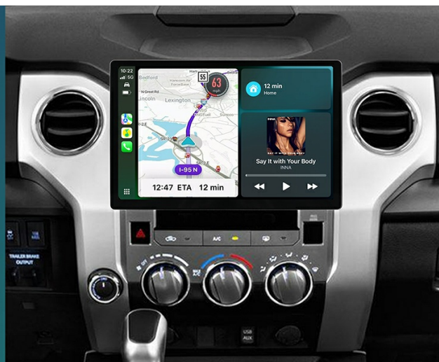
Image: Comparison of the Toyota Tundra dashboard before and after installation of the ASURE 13.1 inch car stereo, highlighting the larger screen size and modern interface.