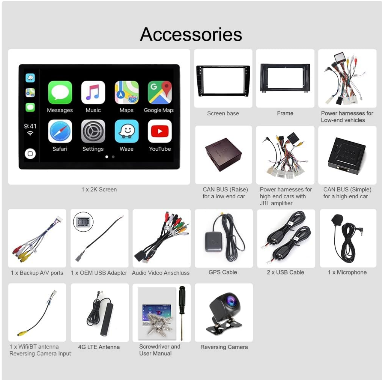
Image: A comprehensive layout of all components and accessories included in the ASURE 13.1 inch car stereo package, including the screen, frame, various cables, antennas, and a reversing camera.