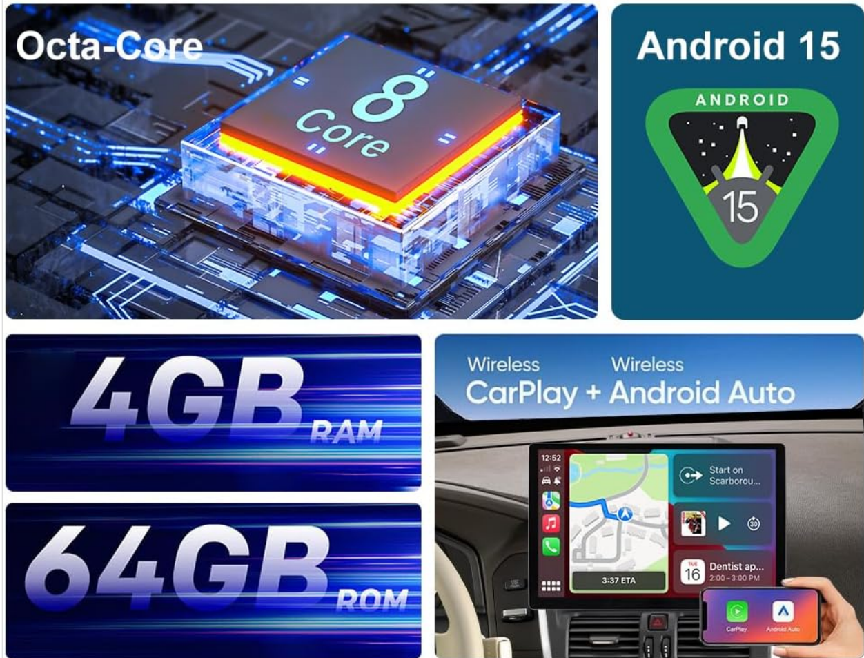
Image: Visual representation of the core specifications including the Octa-Core CPU, Android 15, memory (4GB RAM + 64GB ROM), and wireless connectivity options like CarPlay and Android Auto.