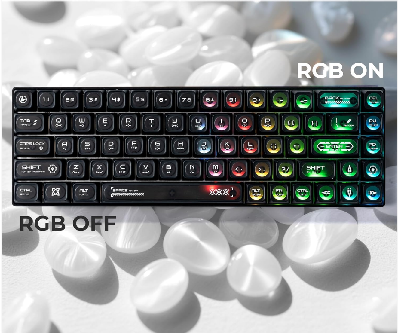
Image: A comparison of the keycaps with RGB lighting on and off, illustrating the distinct "cat-eye" glow and clear legend visibility when illuminated.